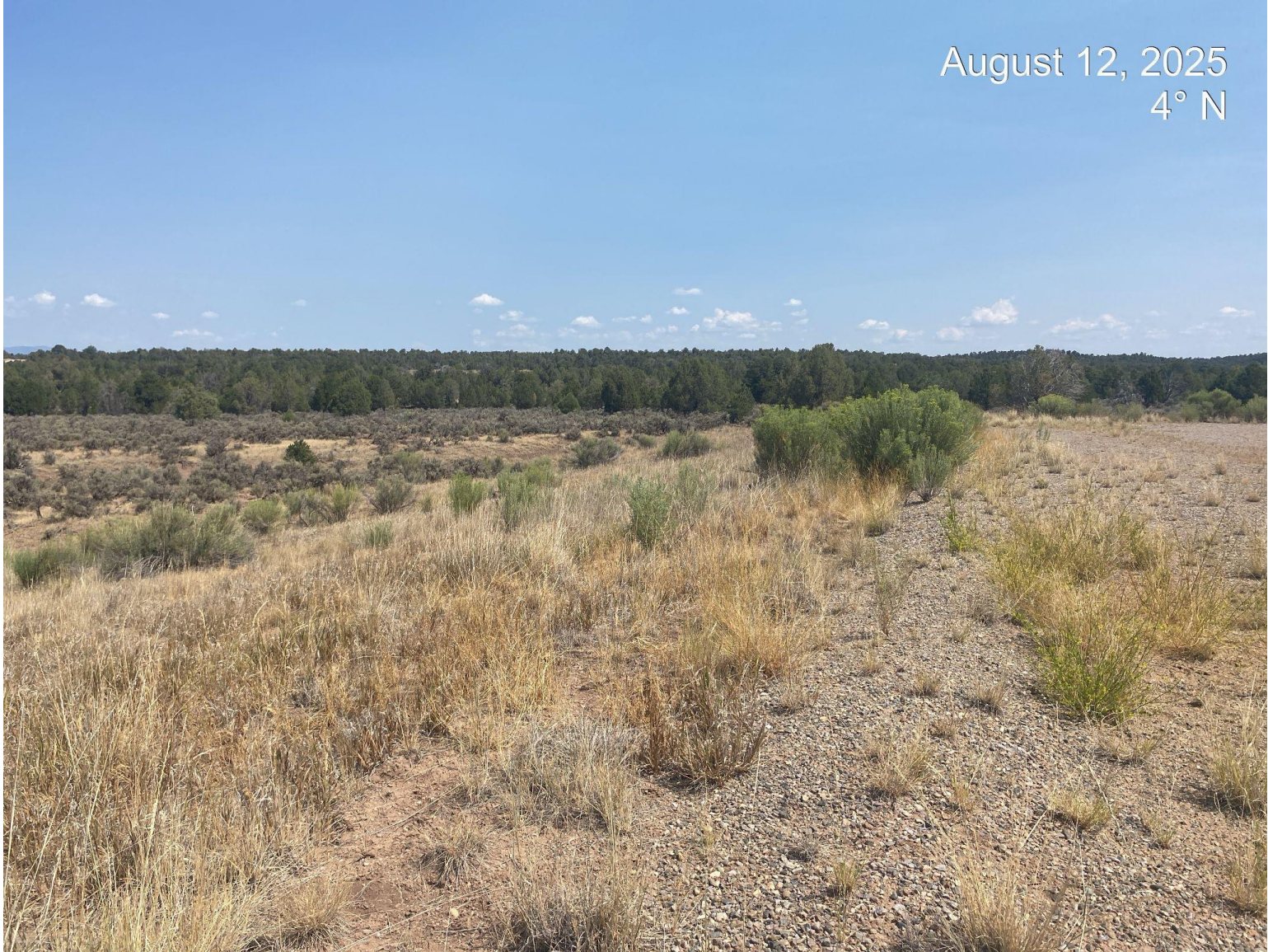
Photo 5. Western interim reclamation area.