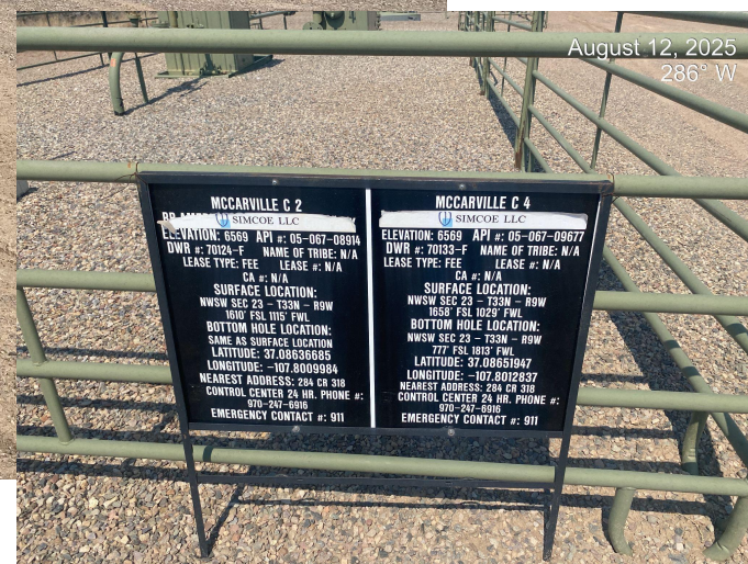
Photo 1. View of the project area taken from the access point facing center.