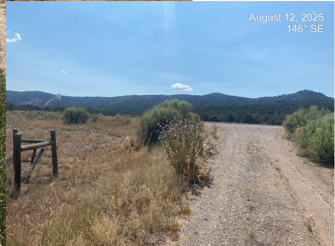
Photo 4. Flowering Musk Thistle and thick patches of Kochia and Russian Thistle lining the length of the access road.