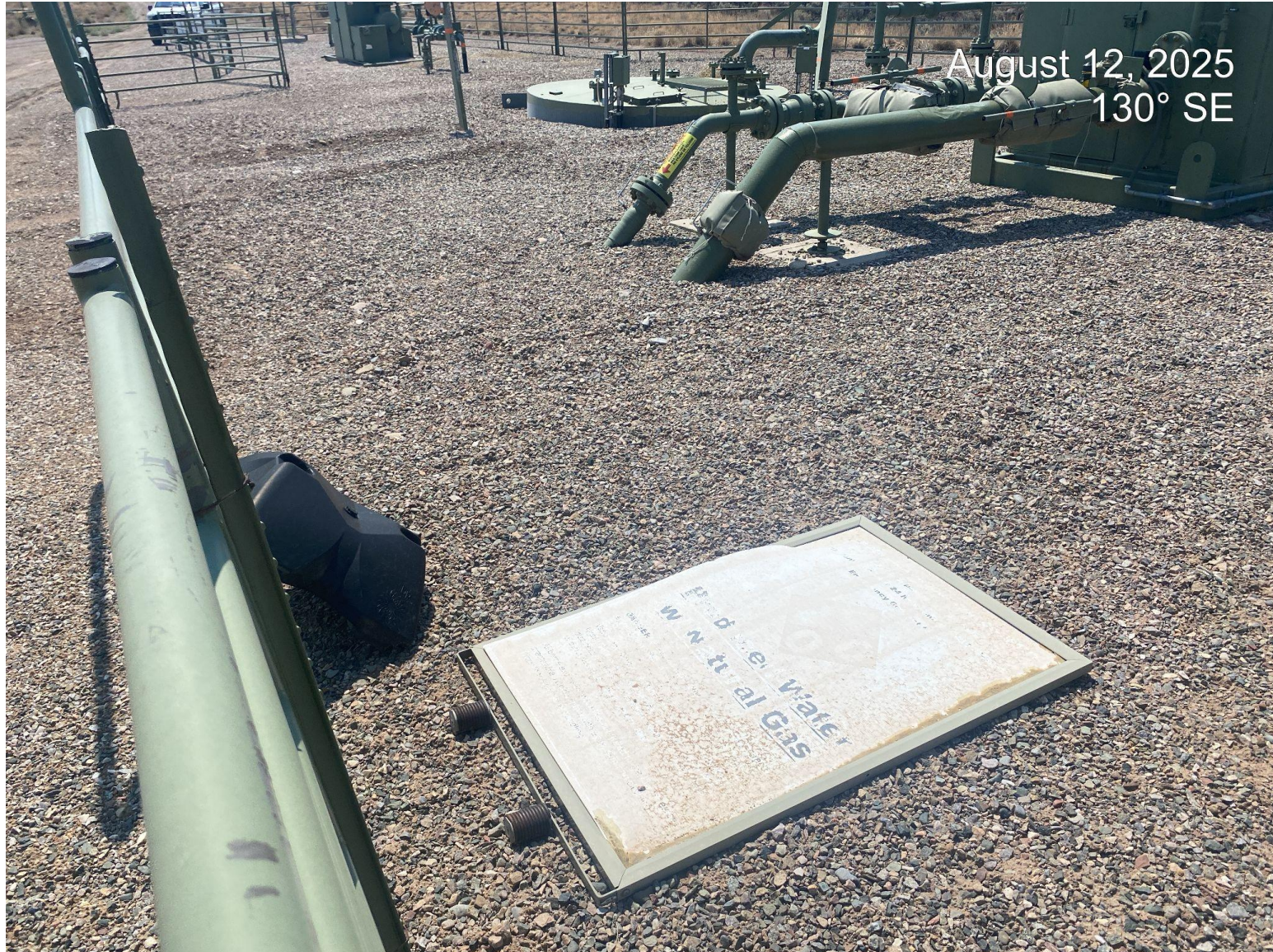
Photo 3. Produced water sign has fallen over and has sun fade; no longer legible.