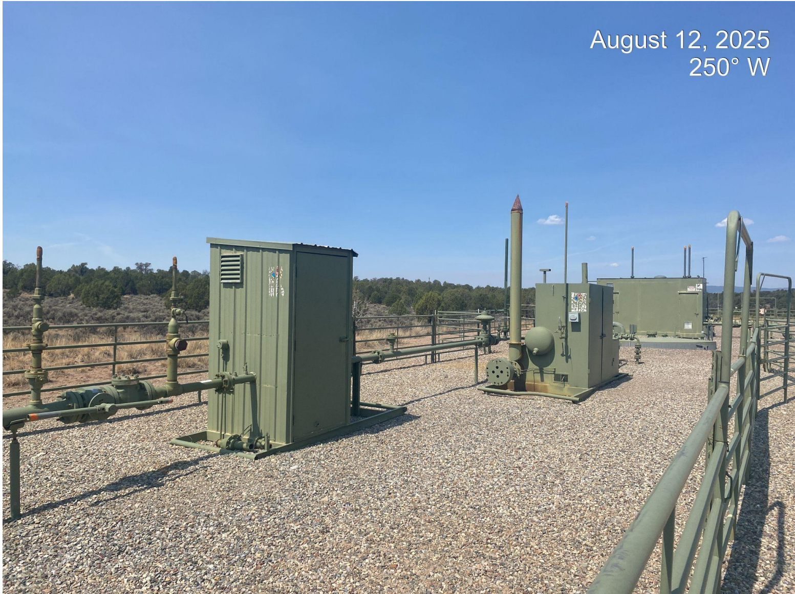
Photo 2. Labels at meter house and separator equipment have deteriorated and are no longer legible.