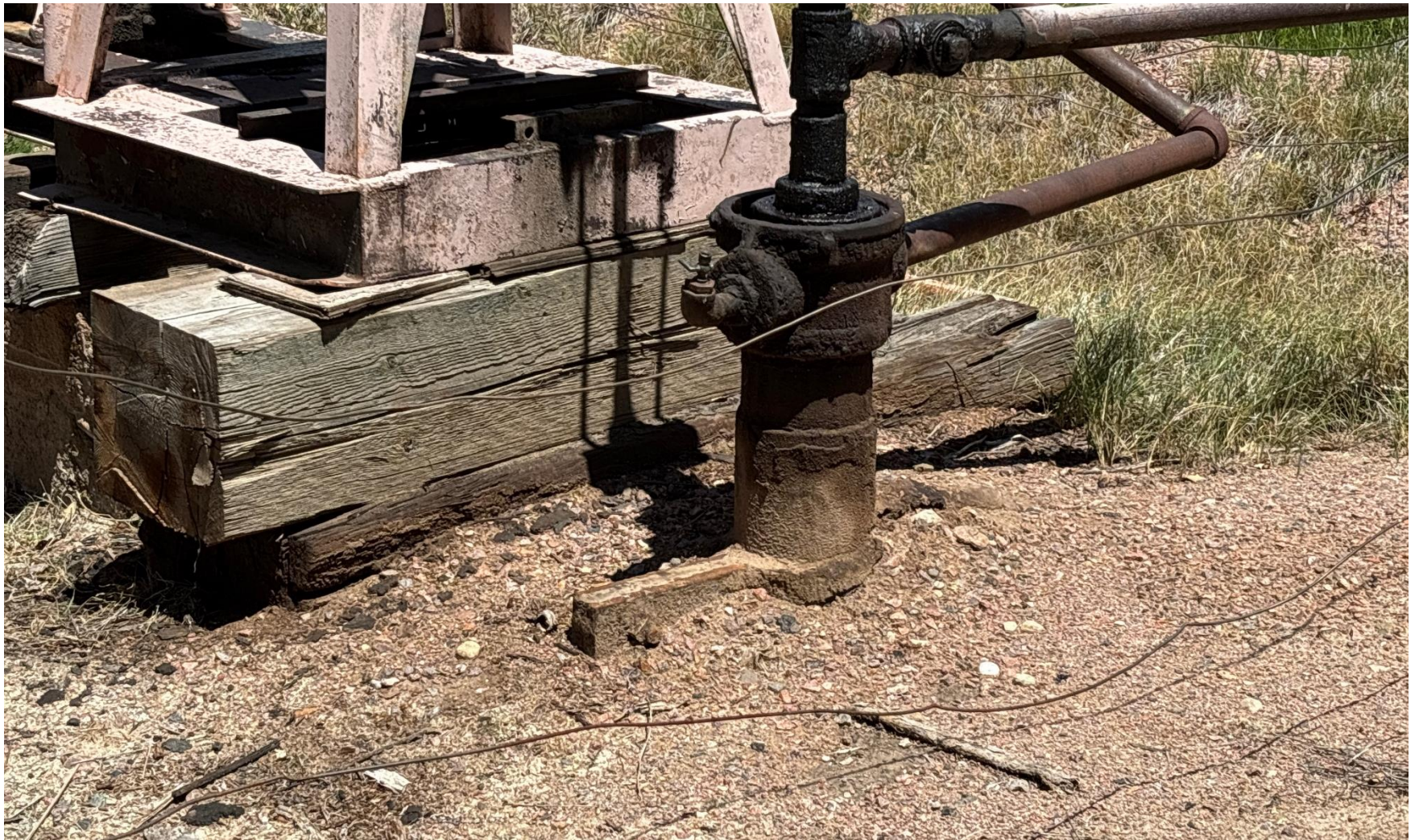
PHOTO 3: WELLHEAD AND EQUIPMENT/NO BRHD INSTALLED ON WELLHEAD ASSEMBLY.