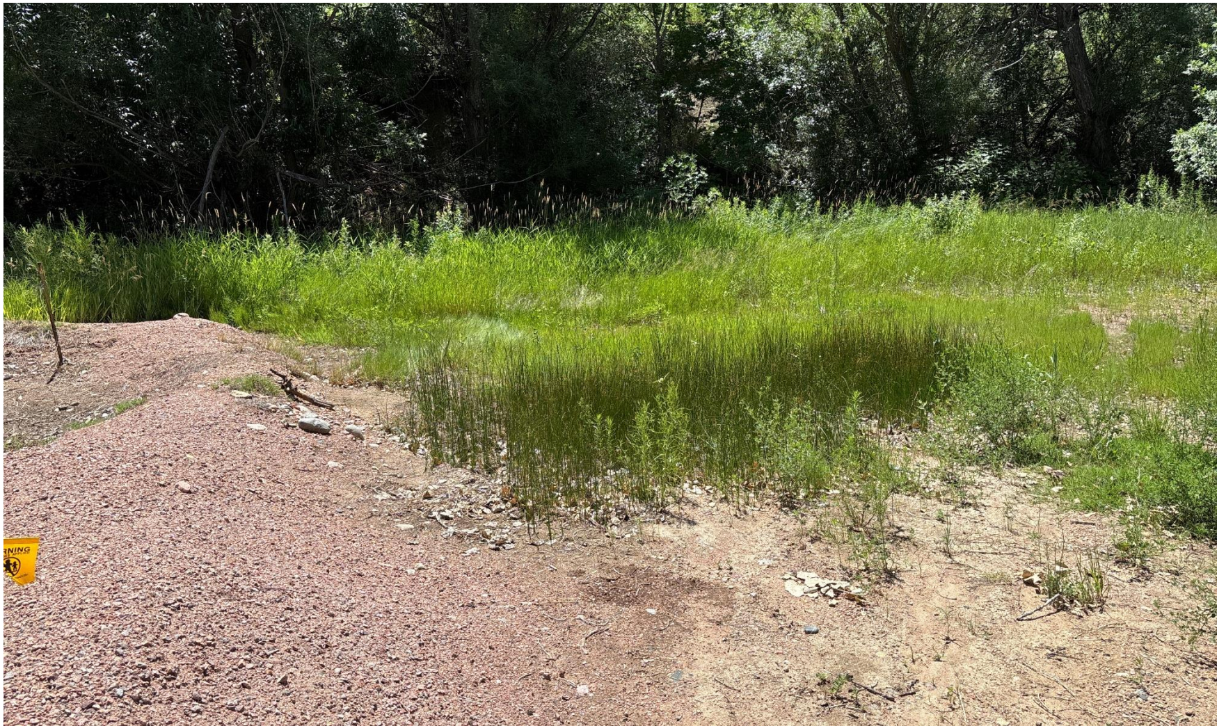
PHOTO 4: WEED MAINTENANCE IS NEEDED AROUND LOCATION PER RULE 606. CA DATE 7-18-2025.