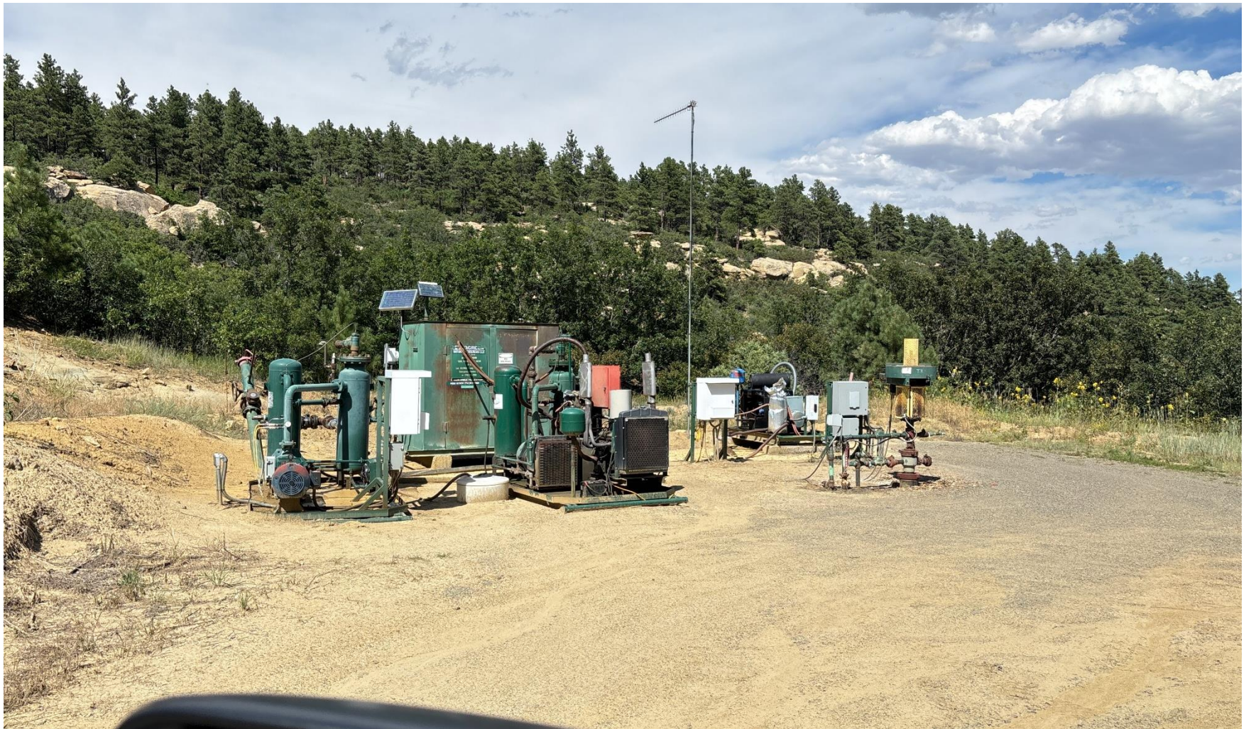
PHOTO 3: WELLHEAD AND EQUIPMENT./ UNUSED EQUIPMENT ELECTRIC COMPRESSOR NOT IN US OR USFULL. REMOVE UNUSED EQUIPMENT PER RULE 606. THIS IS THE SECOND NOTICE FOR THIS CORRECTIVE ACTION IMMEDIATE ACTION IS REQUIRED.