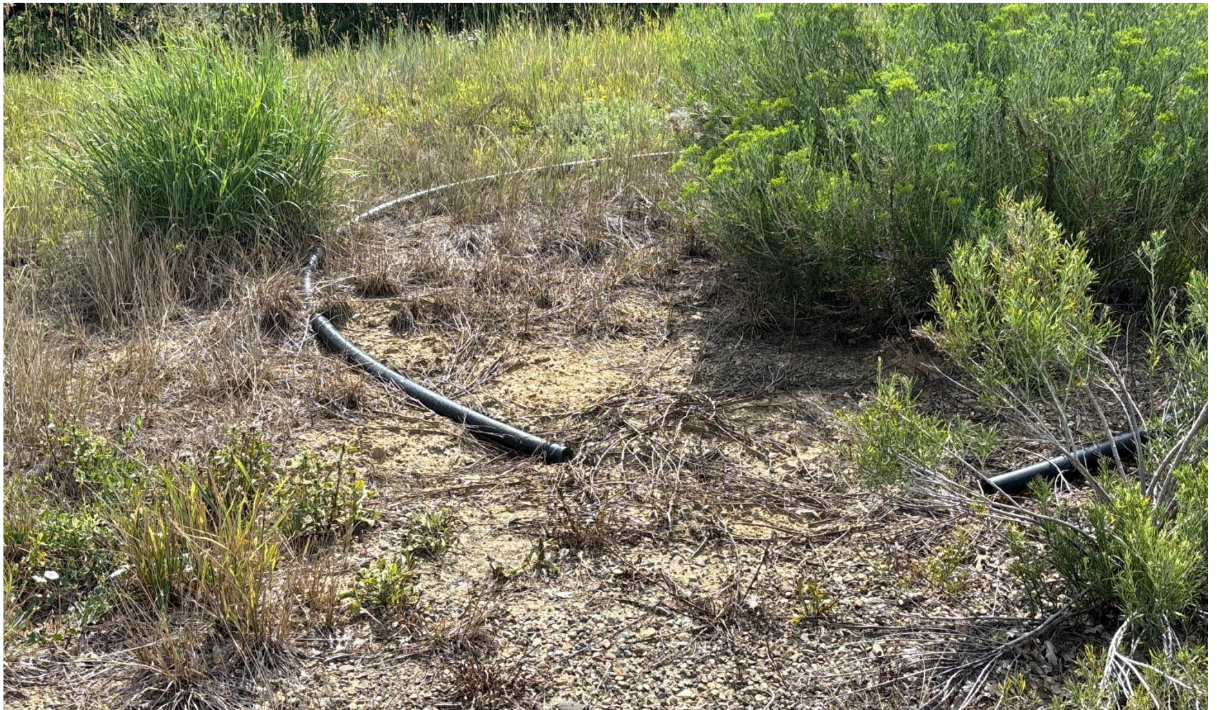
PHOTO 5: UNUSED EQUIPMENT (2" POLY PIPE). REMOVE UNUSED EQUIPMENT PER RULE 606.