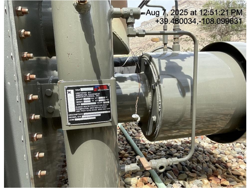
Photo # 9300 PRV vent line on tank burner does not comply with CECMC pressure safety device rules & general safety rules