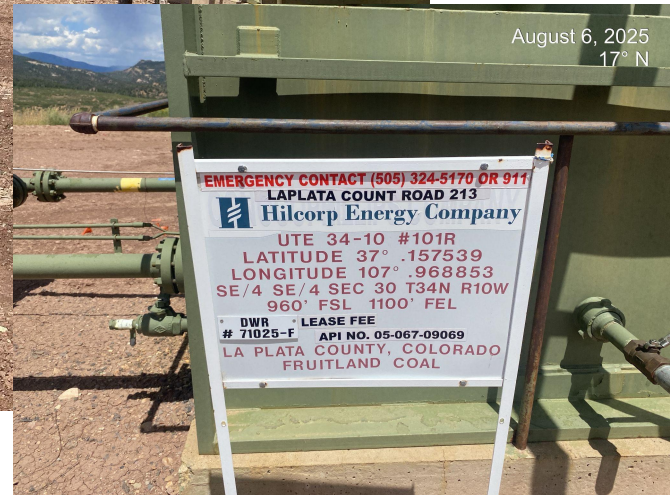
Photo 1. View of the project area taken from the access point facing center.