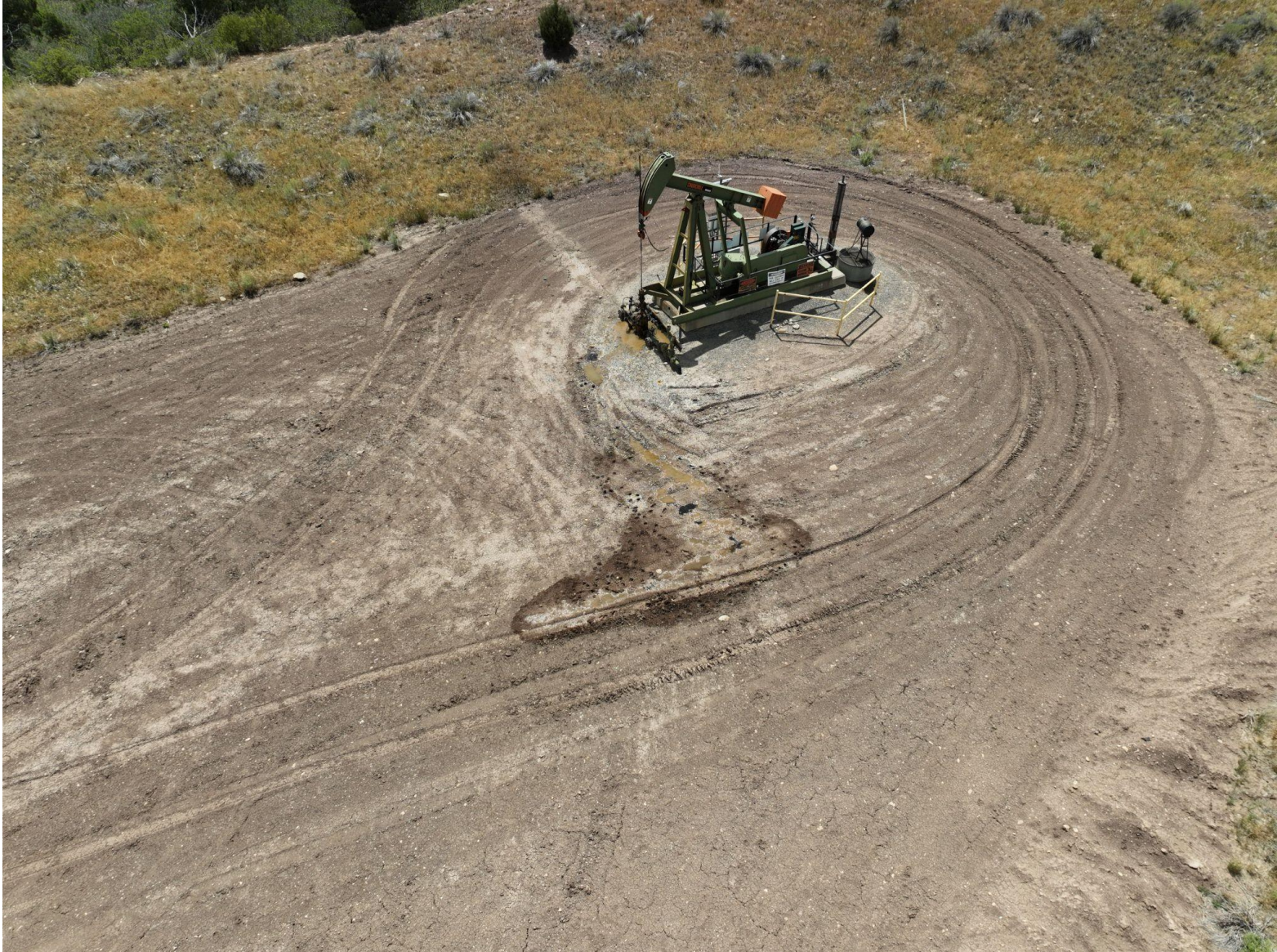
Photo 5. Drone photo showing extent of active spill.