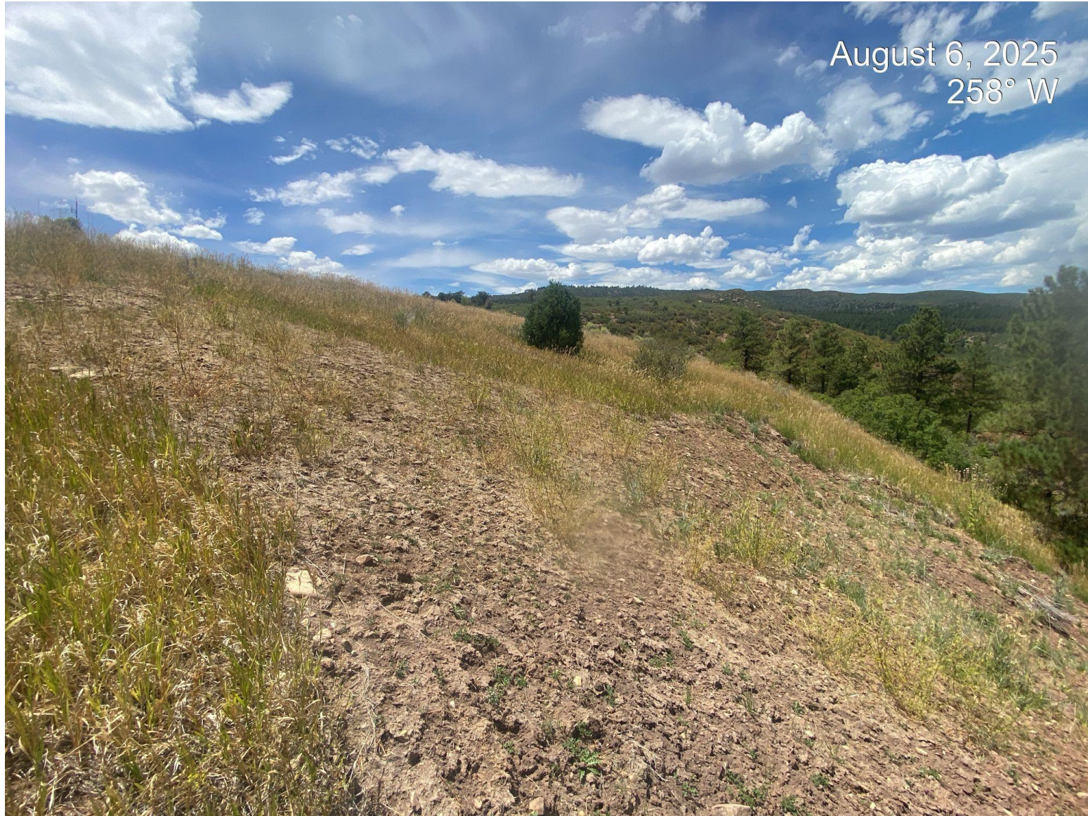
Photo 3. Ground view of collapsed gully erosion and reseeded area.