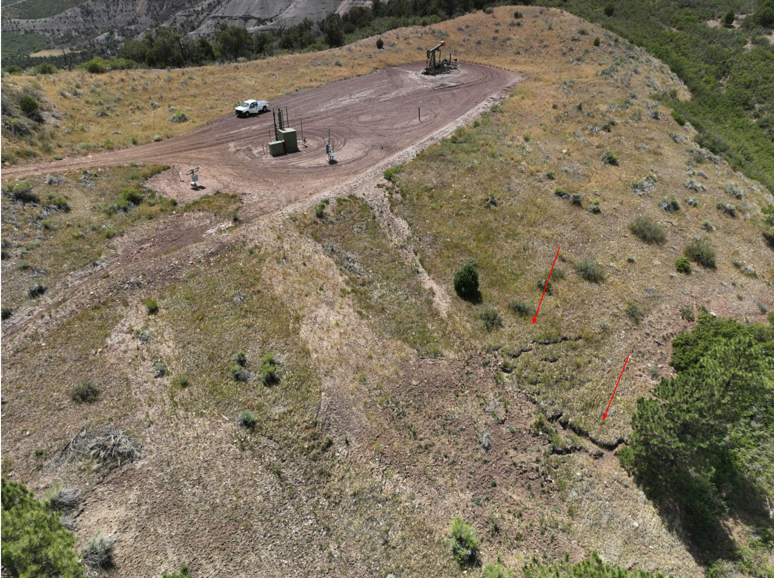
Photo 2. Drone photo of previous active gully erosion area which has been collapsed, filled in and reseeded (evidence of germinating desirable species were observed). Smaller slumping, and erosion observed on the furthest downslope section (red arrow).