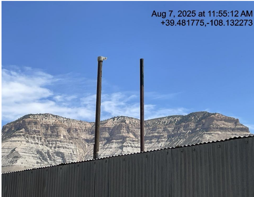
Photo # 9131 PRV vent lines do not comply with CECMC pressure safety device rules