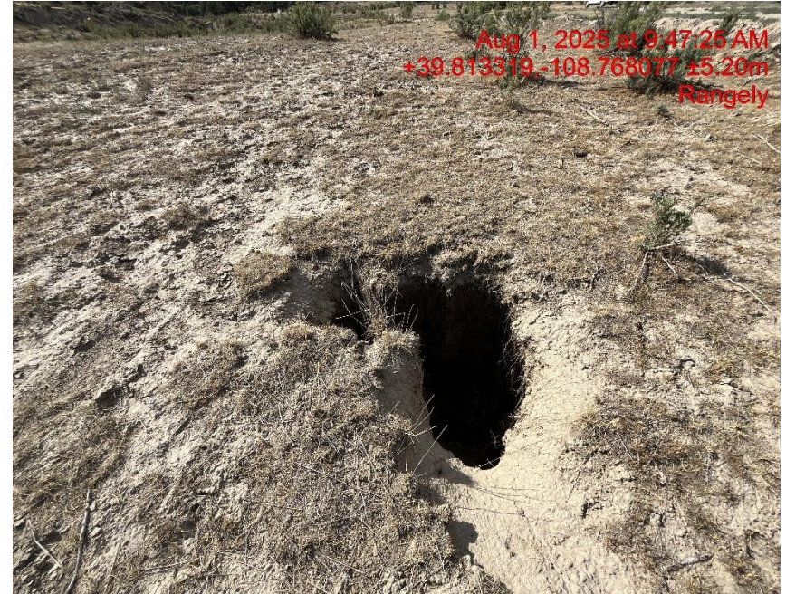
Photo # 1124 Tunnel erosion on location, additionally is a wildlife hazard/personnel safety hazard