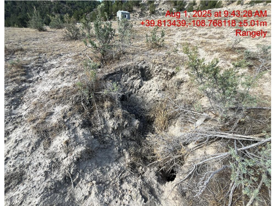
Photo # 1123 Tunnel erosion on location, additionally is a wildlife hazard/personnel safety hazard