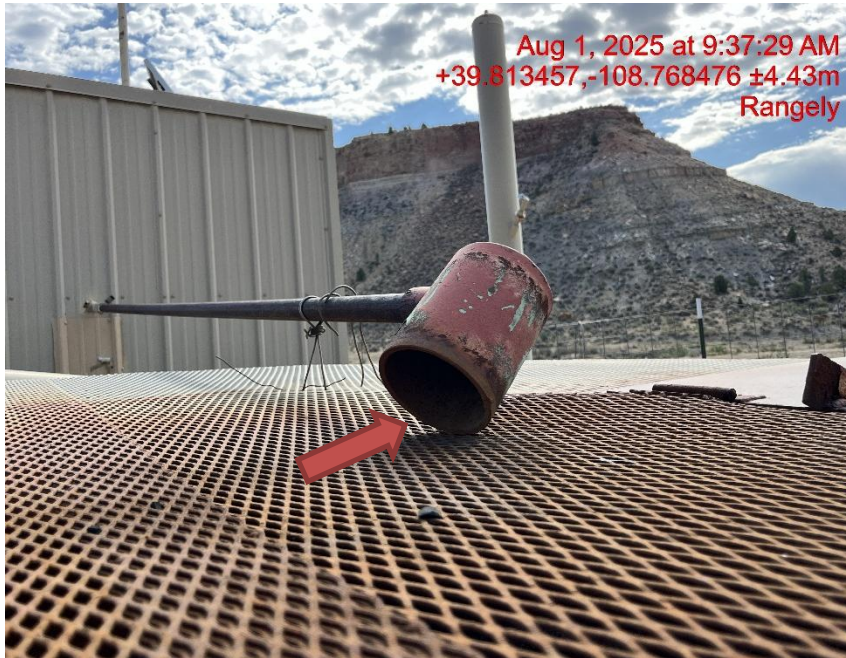
Photo # 1118 Open ended piping/wildlife hazard/available for entry by wildlife