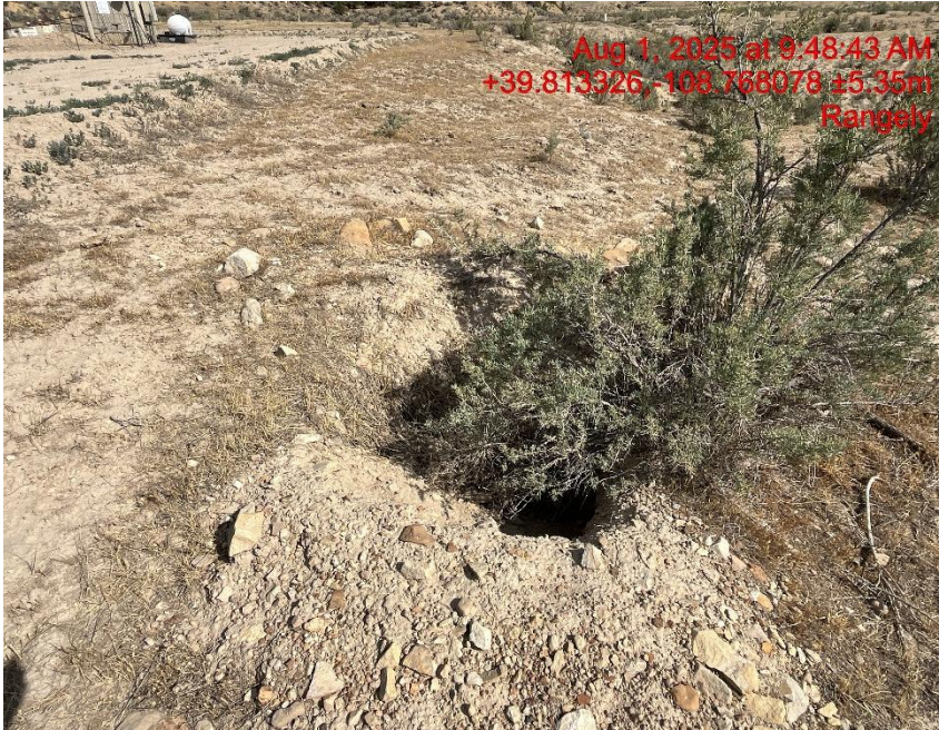
Photo # 1126 Tunnel erosion on location, additionally is a wildlife hazard/personnel safety hazard