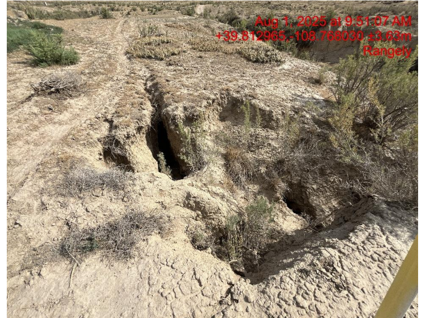
Photo # 1127 Tunnel erosion on location, additionally is a wildlife hazard/personnel safety hazard