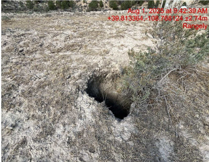
Photo # 1122 Tunnel erosion on location, additionally is a wildlife hazard/personnel safety hazard