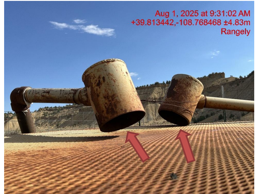
Photo # 1110 Open ended piping/wildlife hazard/available for entry by wildlife