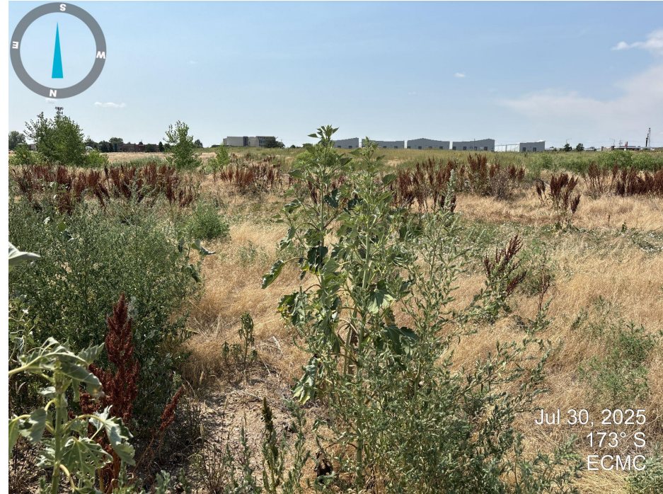
Photo 2. Looking south across the location. Vegetation on the location is primarily weedy species such as kochia and list C noxious weed cheatgrass. Some desirable vegetation is present. Vegetation on location is reflective of the surrounding area. This location appears to have undergone a land use change to construction material storage/ dumping,