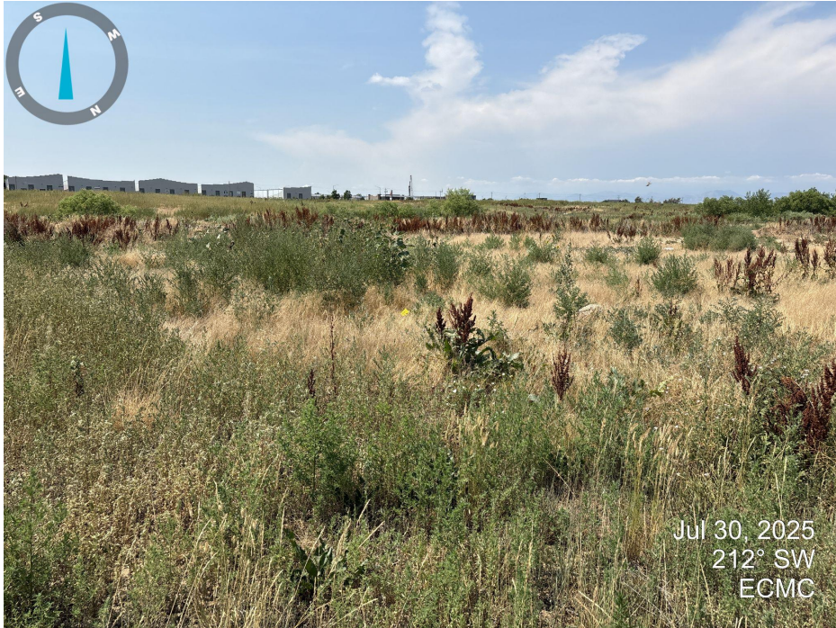
Photo 1. Looking southwest across the location. The fencing has been removed and the excavations filled.