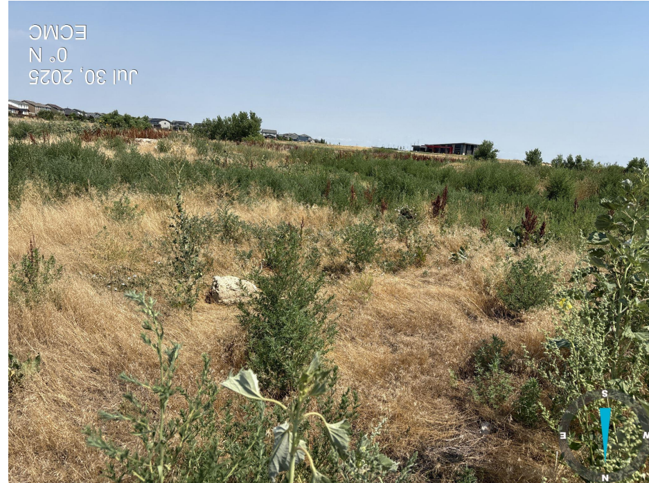
Photo 4. Looking north from the wellbore area. See photo 2 comments.