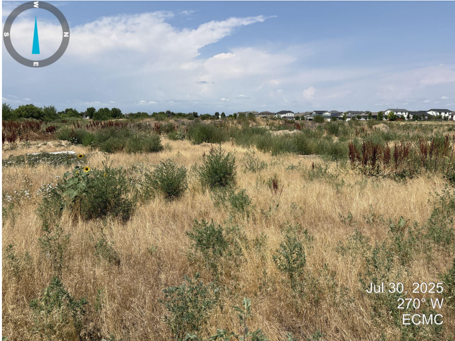
Photo 3. Looking west from the wellbore area. See photo 2 comments.