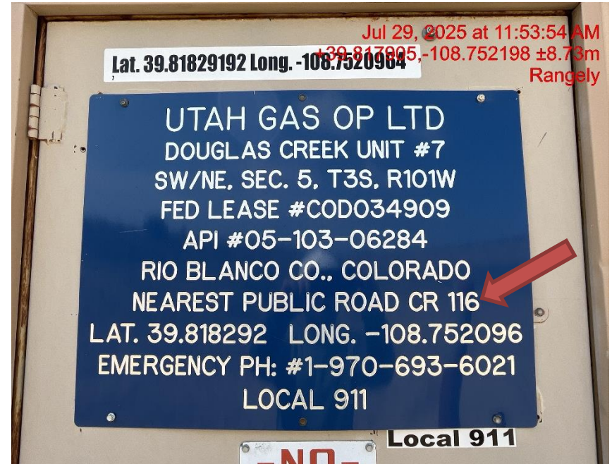
Photo # 0937 Battery sign contains inaccurate nearest public road information