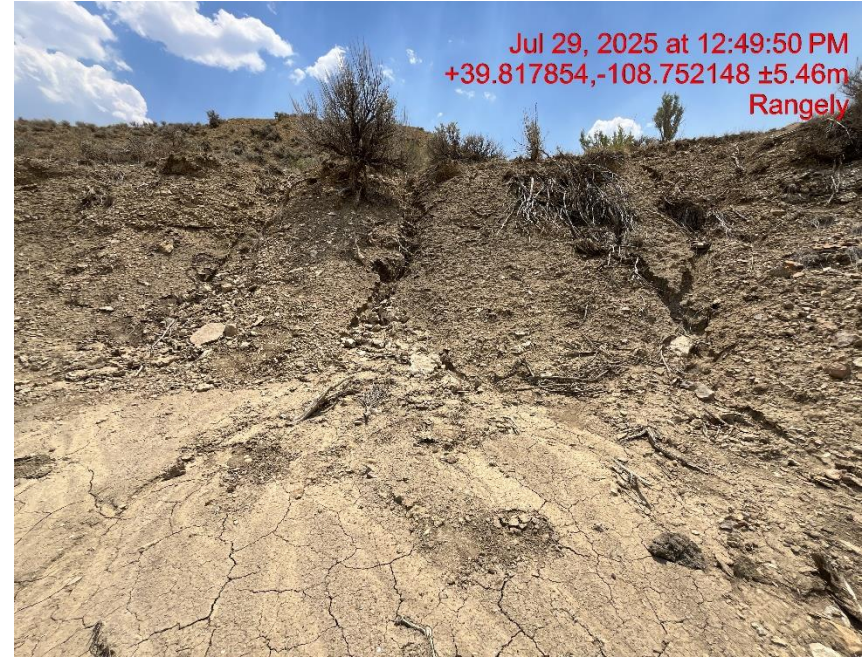
Photo # 0964 Failure to minimize erosion & transport of sediment - Erosion & transport of sediment on cutslope/sediment migrating onto location/insufficient BMP's

Photo # 0966 Failure to minimize erosion & transport of sediment - Erosion & transport of sediment on cutslope/sediment migrating onto location/insufficient BMP's