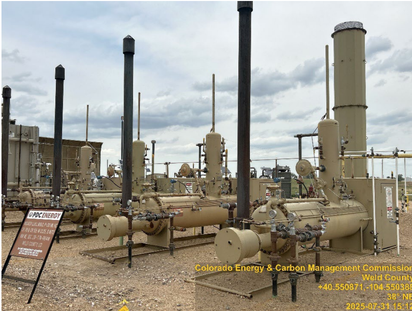
Photo #5 Mojack/28-C Pad ; Mojack Tank Battery Battery site Active Separator(s), ECD(s)