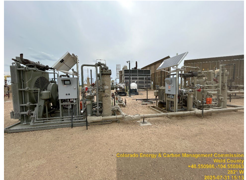
Photo #6 Mojack/28-C Pad ; Mojack Tank Battery Battery site Active Compressor(s), VRU(s)