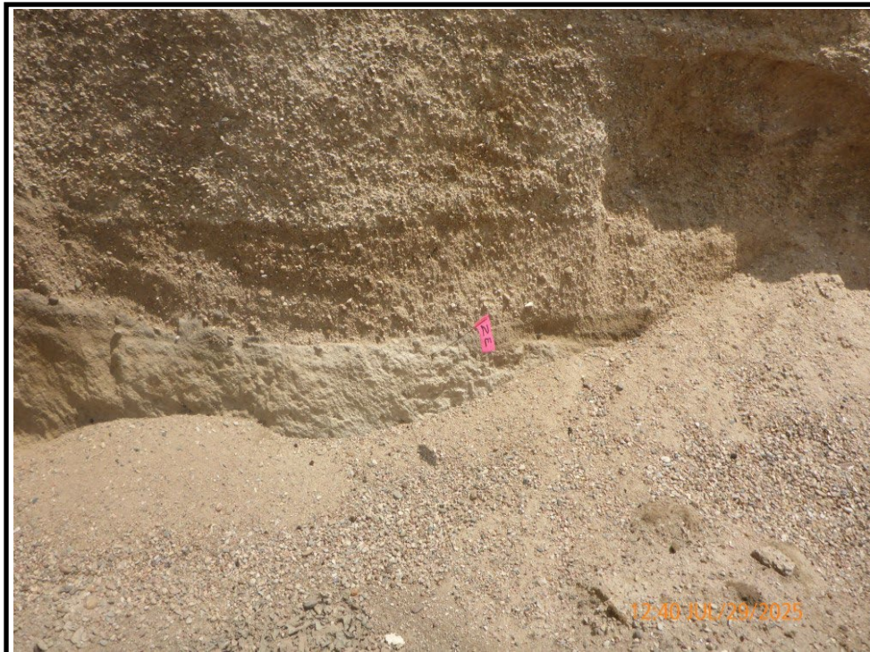
Rhoades Unit (RU) 5-4 – Sample 2E-b Location (07/29/2025)