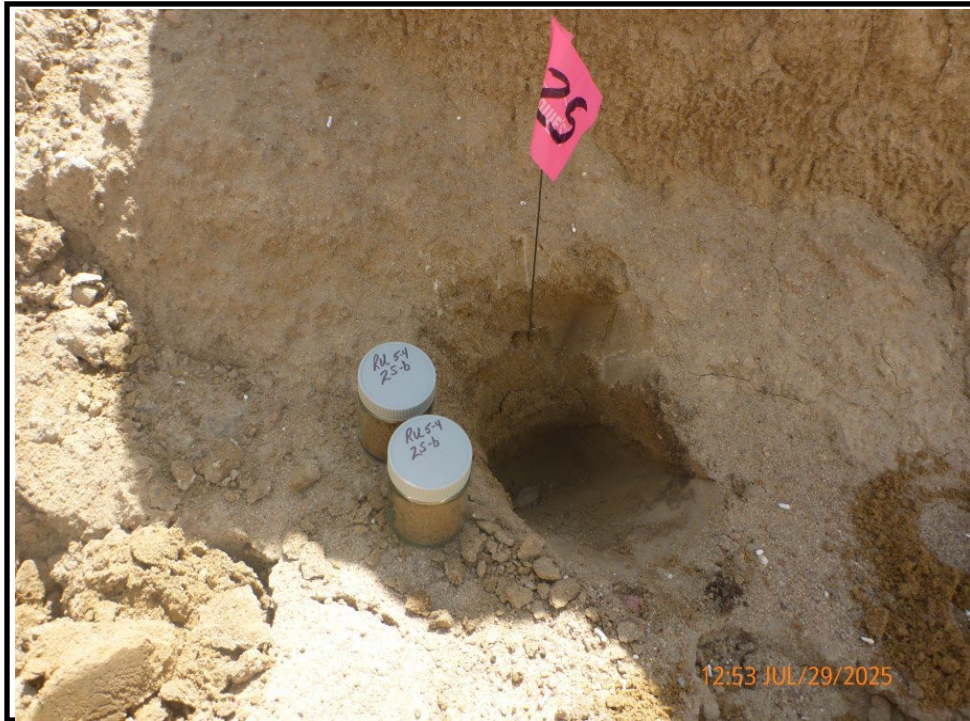
Rhoades Unit (RU) 5-4 – Sample 2S-b Location (Lateral Extent to the South)