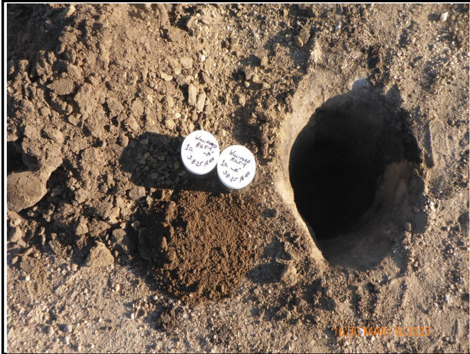
Rhoades Unit (RU) 5-4 - Sample RU54 1a (~30' West of well head)