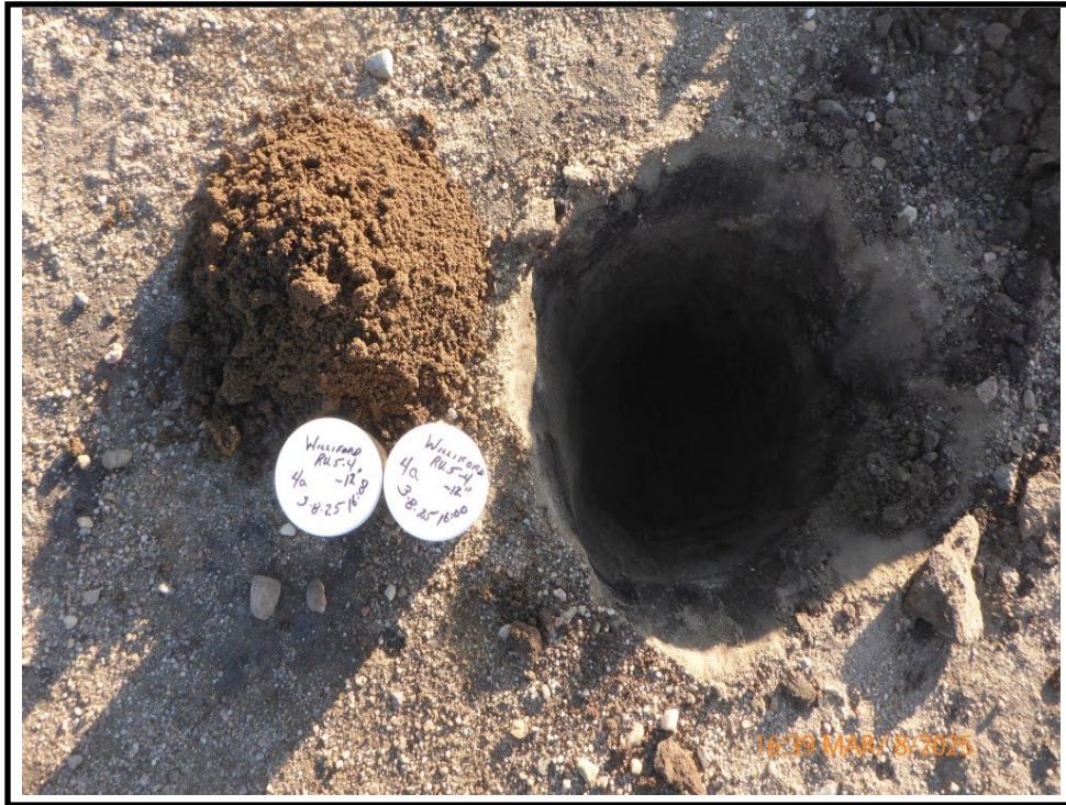
Rhoades Unit (RU) 5-4 - Sample RU54 4a (~30' North of well head)