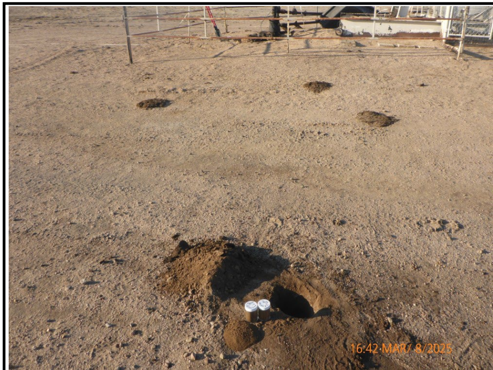
Rhoades Unit (RU) 5-4 - Sample RU54 3a (~30' South of well head) (38.878432°, -120.798363°)