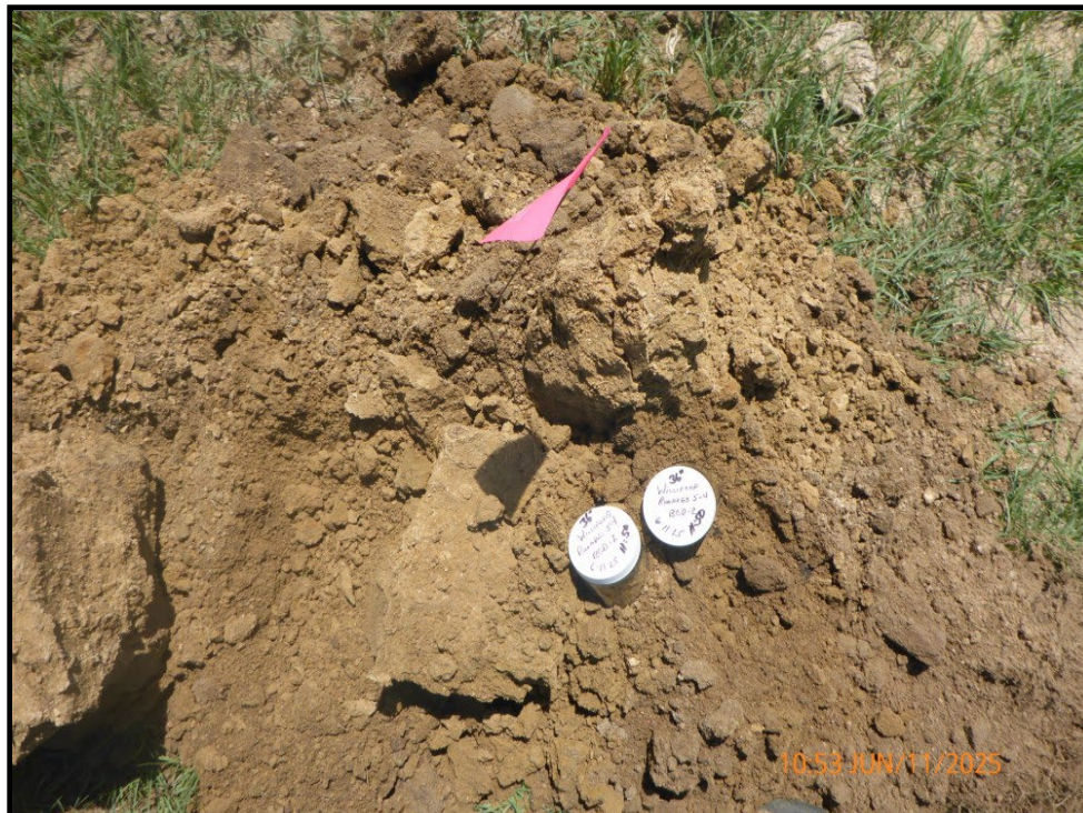
Rhoades Unit (RU) 5-4 – Sample BGD-2 (36" bgs) (38.878267°, -102.798393°)