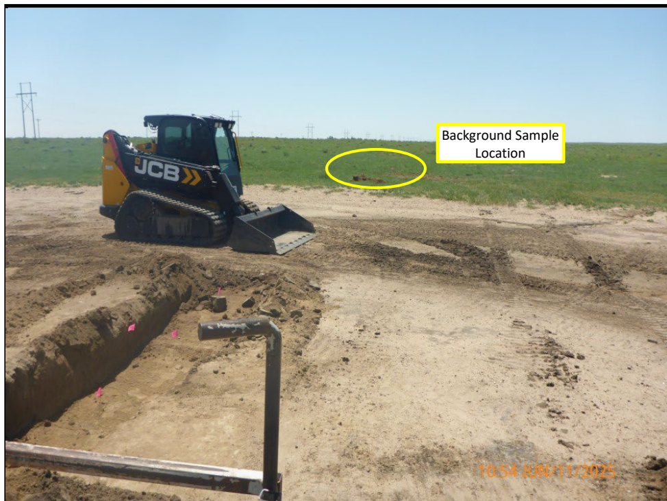
Rhoades Unit (RU) 5-4 – Background Sample Location 06/11/2025 (BGD-1, BGD-2)