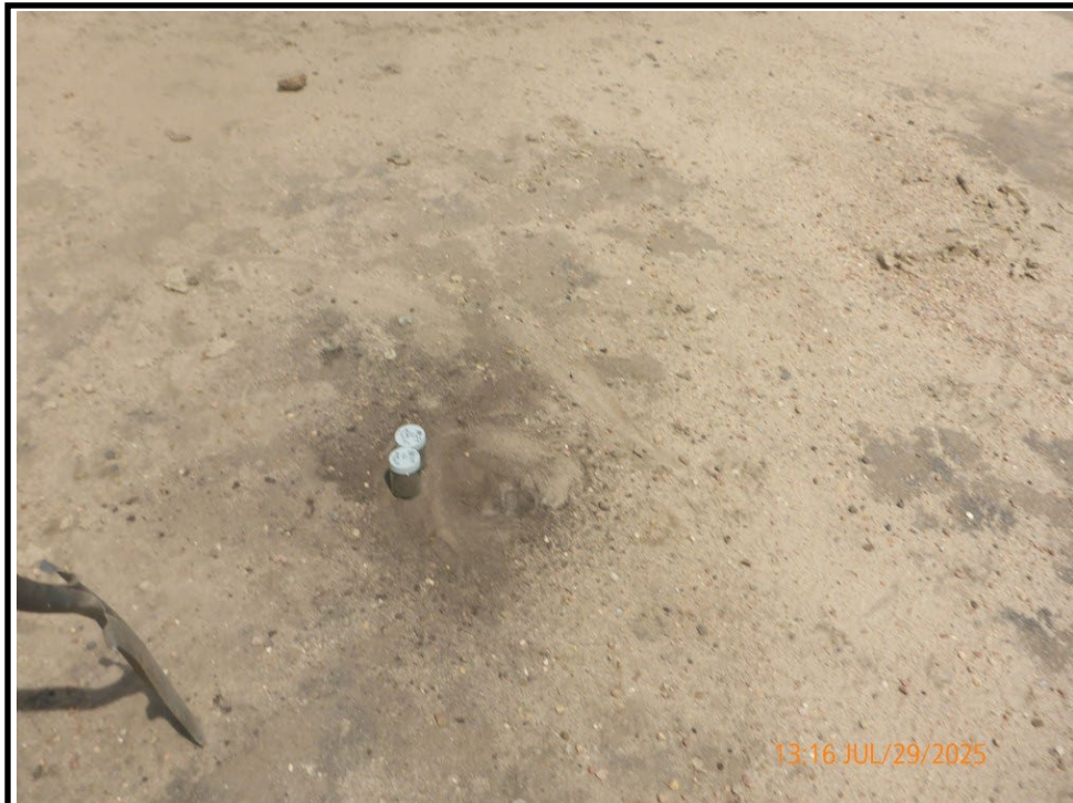
Rhoades Unit (RU) 5-4 – Sample L1 (hard and black appearing soil) 07/29/2025