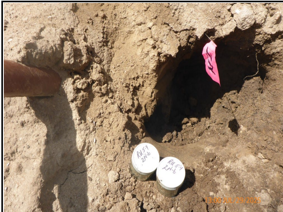
Rhoades Unit (RU) 5-4 – Sample 2N-b Location (Lateral Extent to the North)