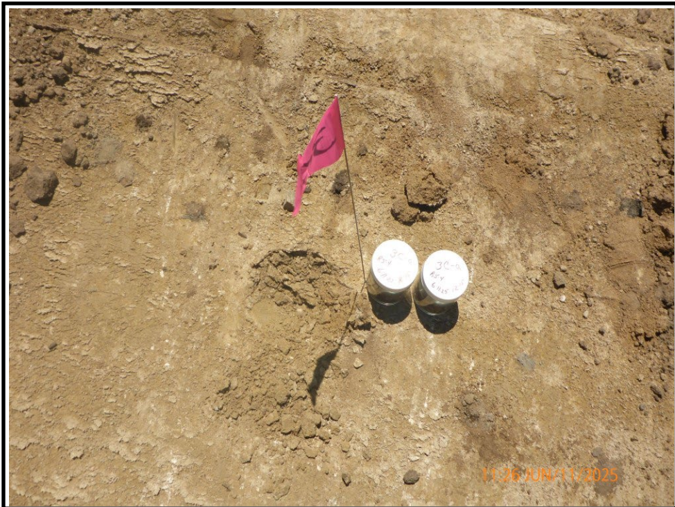
Rhoades Unit (RU) 5-4 - Sample 3a-C (38.878432°, -120.798363°)