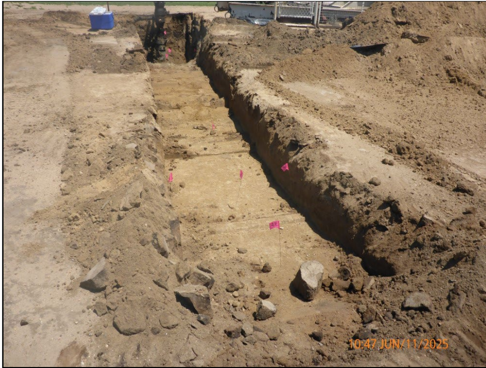
Rhoades Unit (RU) 5-4 – Sample 3a Locations 06/11/2025 (3C-a,3N-a,3S-a,3E-a,3W-a)