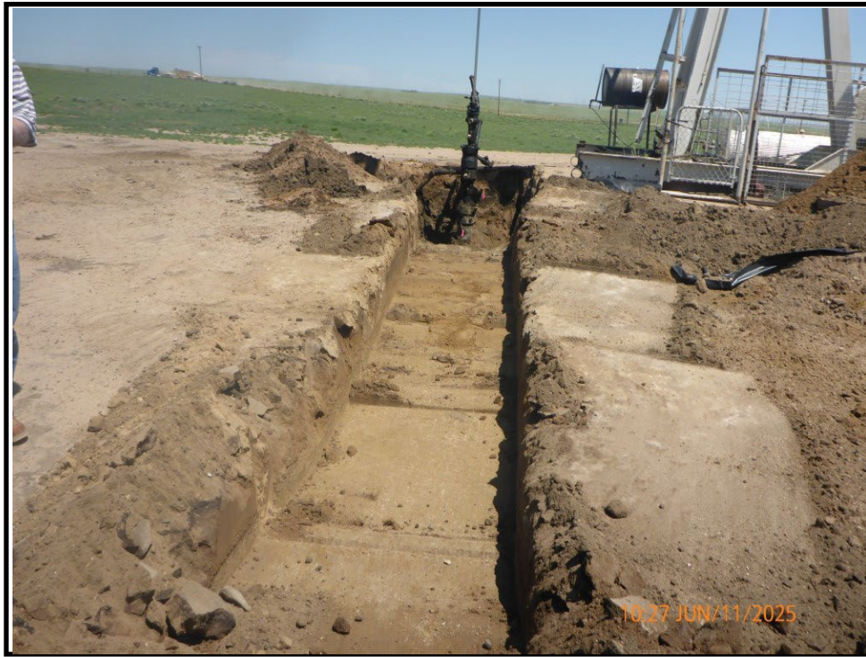
Rhoades Unit (RU) 5-4 – Looking North from Sample RU54 3a towards Sample RU54 2a