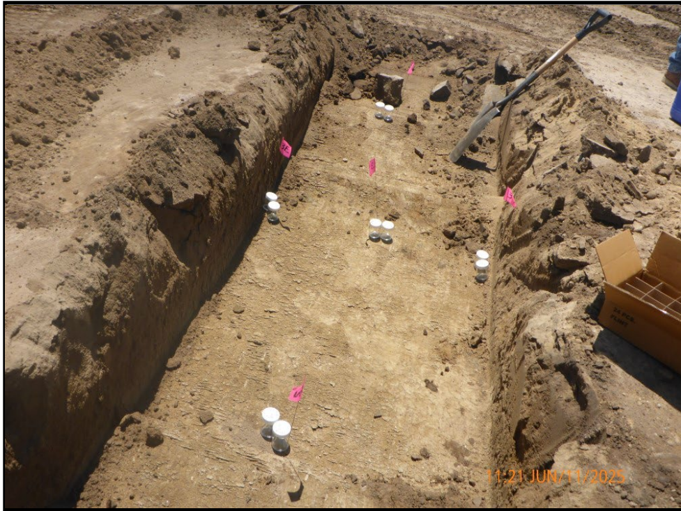
Rhoades Unit (RU) 5-4 – Sample 3a Locations, looking South (3C-a,3N-a,3S-a,3E-a,3W-a)