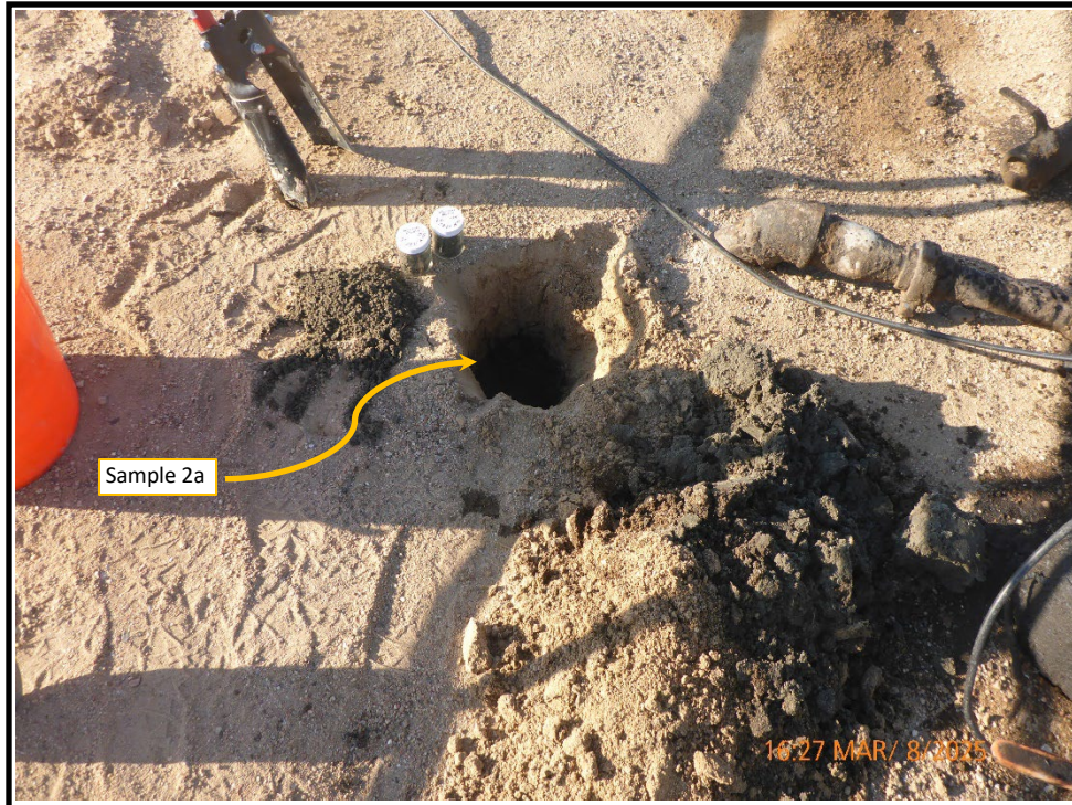
Rhoades Unit (RU) 5-4 - Sample RU54 2a (at Wellhead) (38.878520°, -102.798360°)