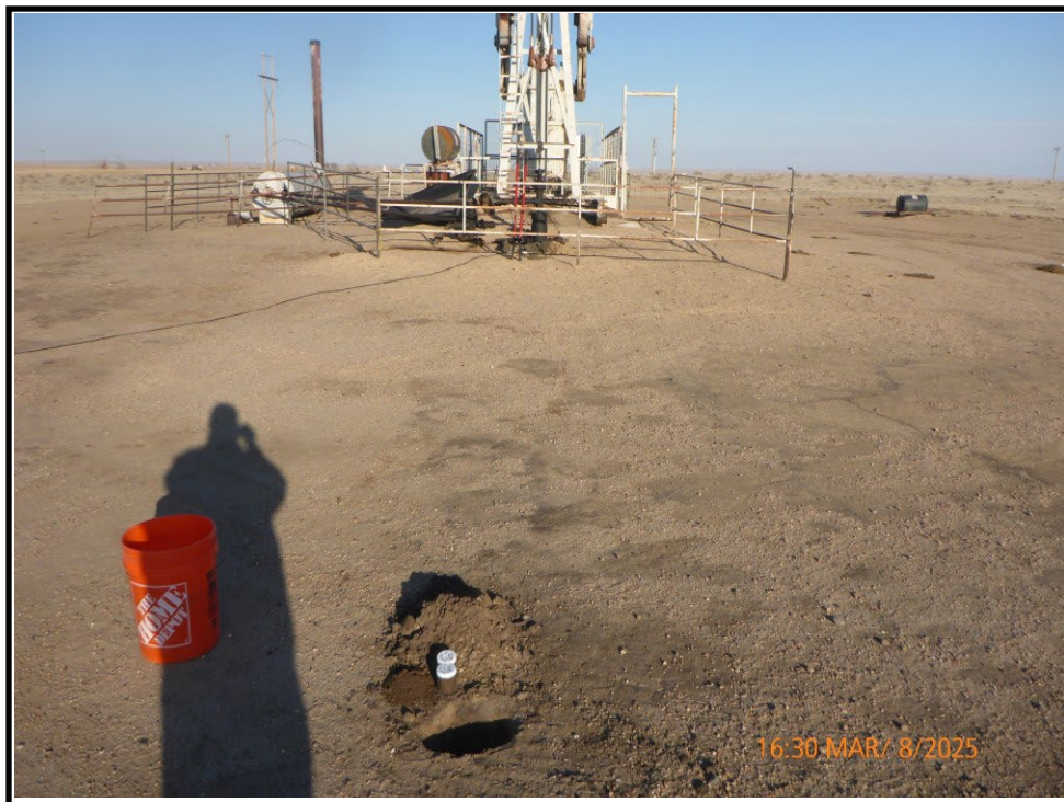
Rhoades Unit (RU) 5-4 - Sample RU54 1a (~30' West of well head) (38.87851°, -102.79846°)