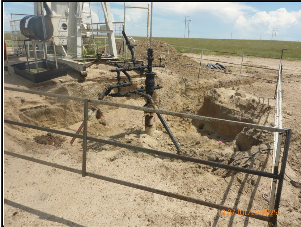
Rhoades Unit (RU) 5-4 – Sample 2b Locations 07/29/2025 (2C-b,2N-b,2S-b,2E-b,2W-b)