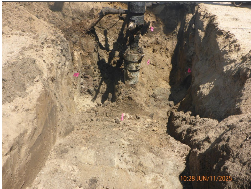
Rhoades Unit (RU) 5-4 – Sample 2a Locations 06/11/2025 (2C-a,2N-a,2S-a,2E-a,2W-a)