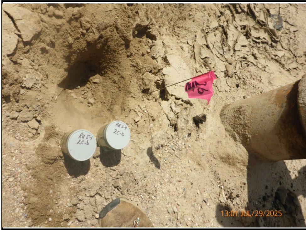
Rhoades Unit (RU) 5-4 – Sample 2C-b Location (Vertical Extent Center)