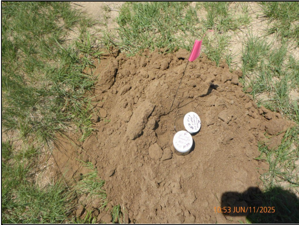
Rhoades Unit (RU) 5-4 – Sample BGD-1 (12" bgs) (38.878267°, -102.798393°)