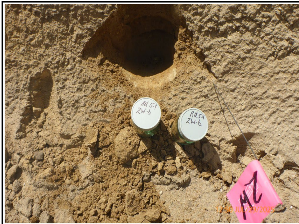
Rhoades Unit (RU) 5-4 – Sample 2W-b Location (Lateral Extent to the West)