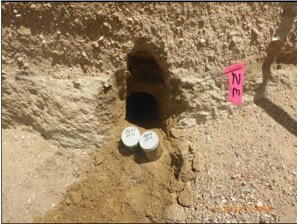
Rhoades Unit (RU) 5-4 – Sample 2E-b Location (Close to the lateral extent to the East)