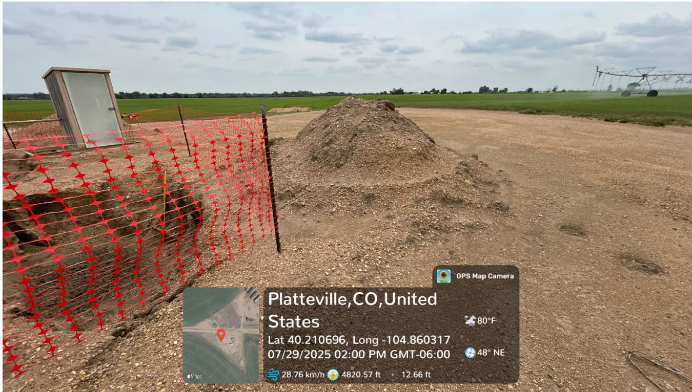
Photo 4 – Facing Southwest towards unlabeled stockpile with inadequate BMPs