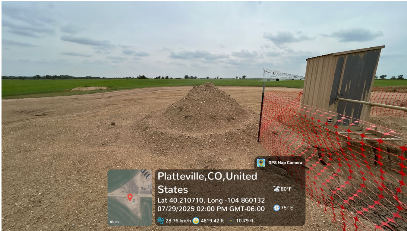
Photo 5 – Facing South towards second unlabeled stockpile with inadequate BMPs