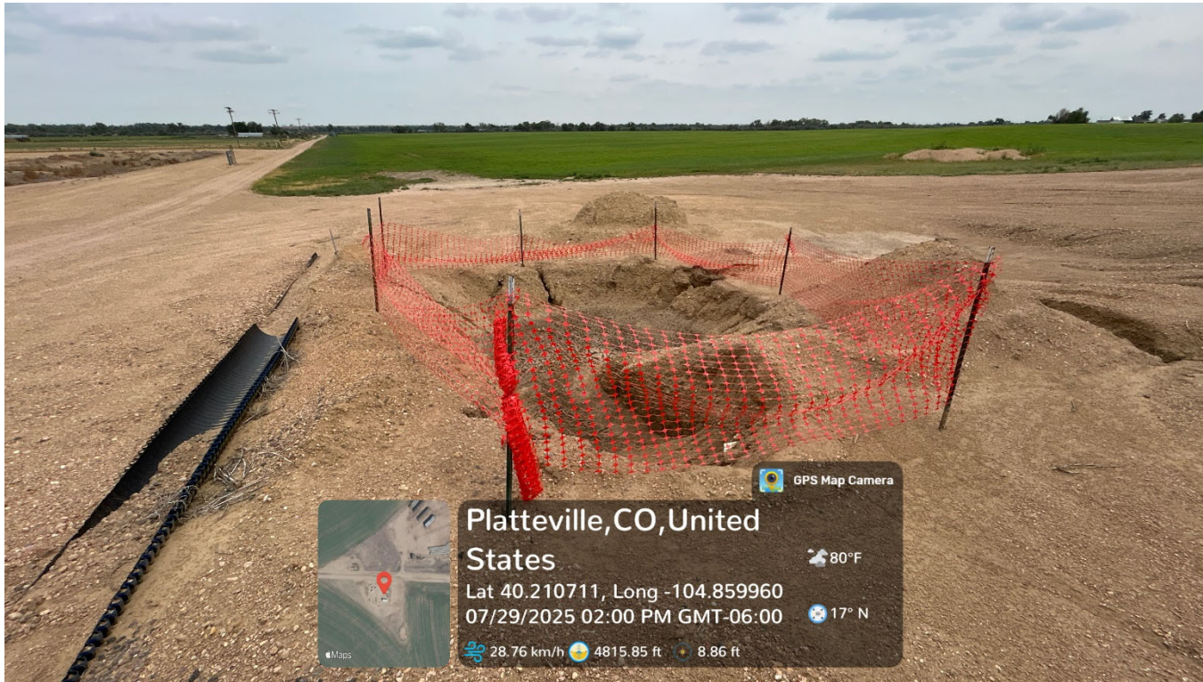
Photo 6— Facing East towards open excavation and third unlabeled stockpile with inadequate BMPs and fencing