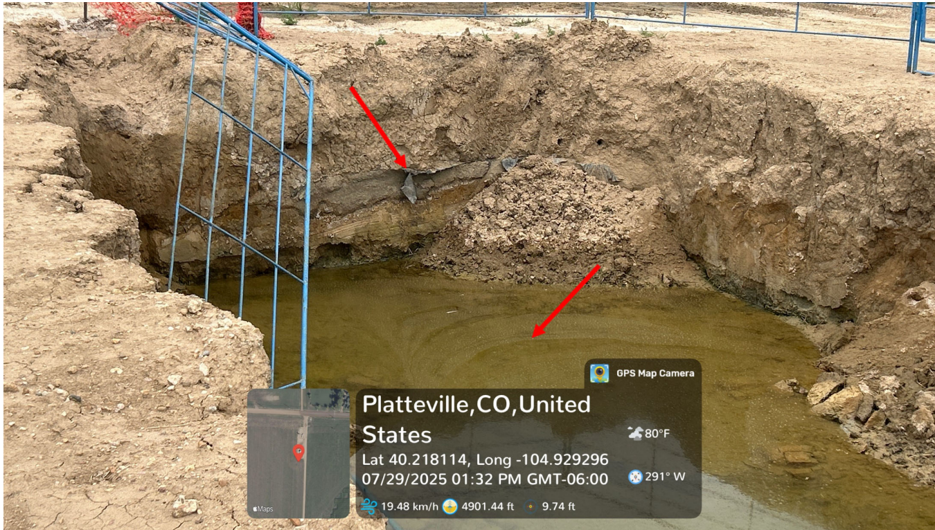
Photo 4 – Facing Northeast viewing gray staining on sidewall and standing water