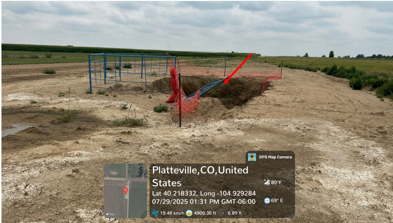
Photo 2 – Facing Southeast viewing inadequate fencing of excavation