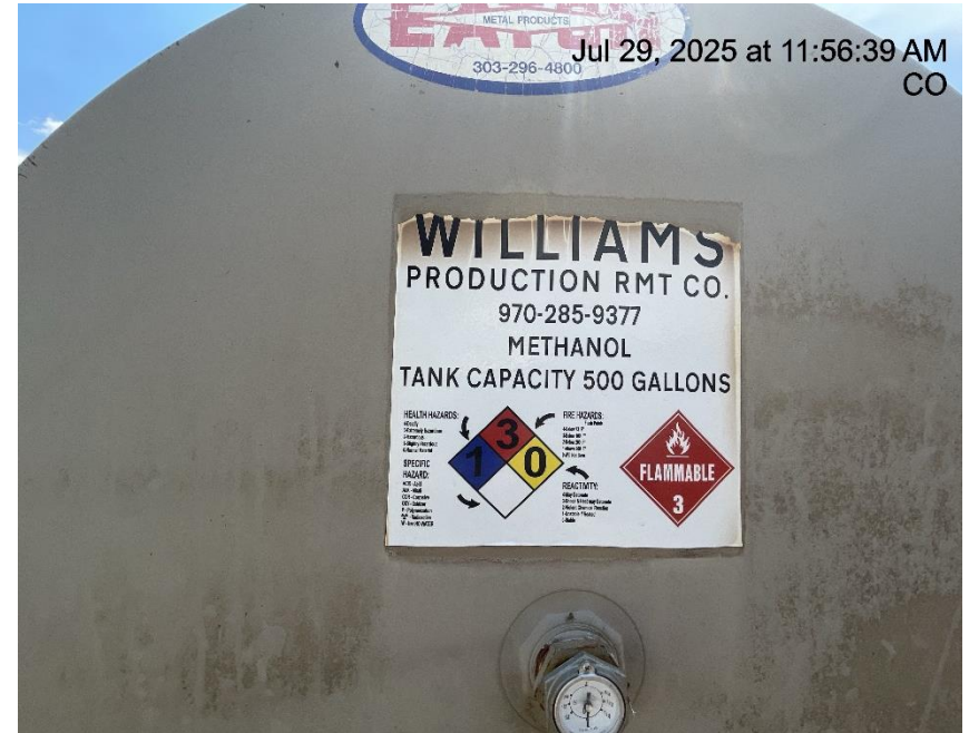
Photo # 5486 Methanol tank has label with previous operators name on it