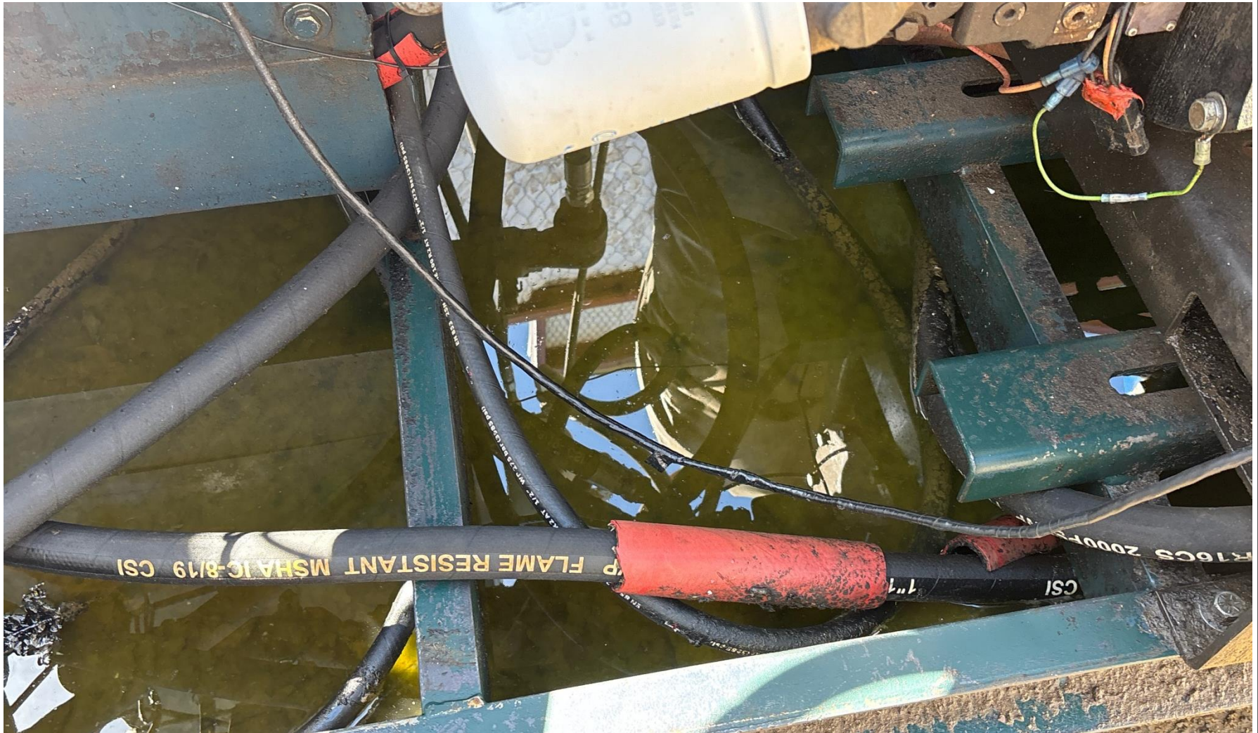
PHOTO 5: OILY WASTE AND APPEARS THERE MAY BE ANTIFREEZE IN PRIME MOVER SKID. DRAIN OILY WASTE REPAIR ALL LEAKS AND REMOVE IMPACTED SOIL PER RULE 1002..(2).D & 1002.f.(2)B, Comply with general provisions of the oil and gas act for wildlife protection AND SB-181.