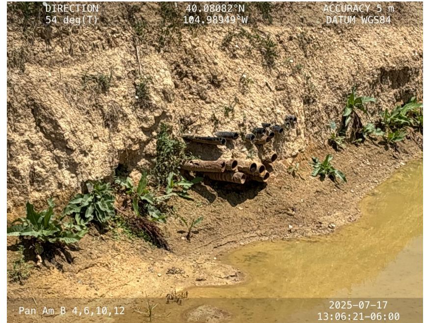
Uncapped, unidentified flowlines within the excavation