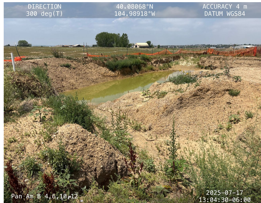
Fencing around excavation and weeds