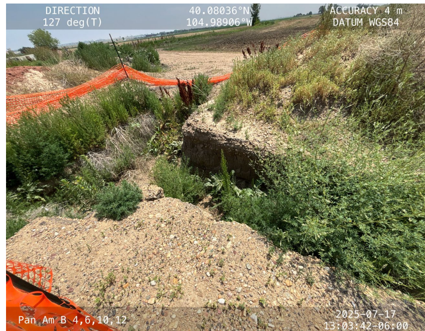
Excavation, fallen fencing, weeds