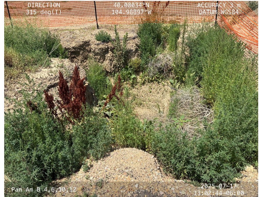
Fencing and weeds