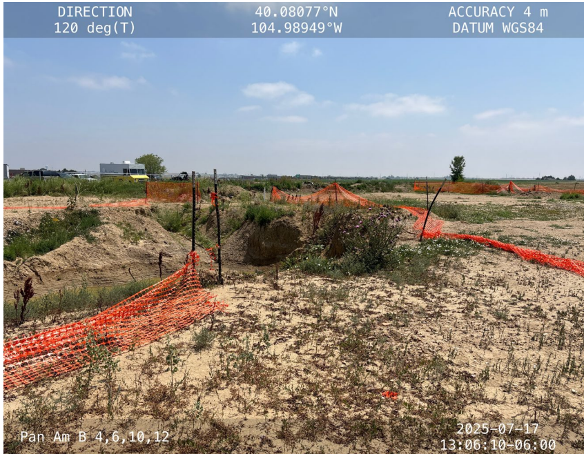
Fencing and weeds