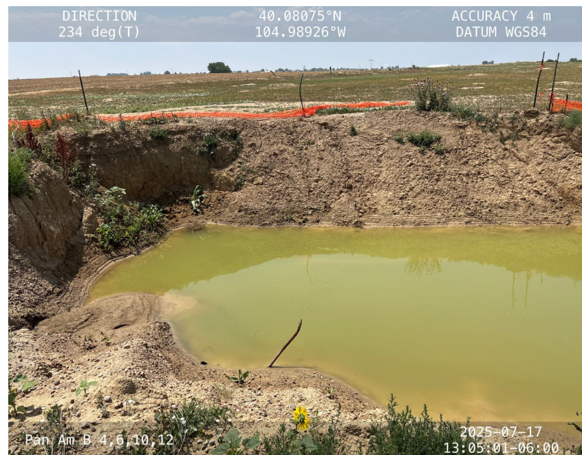
Groundwater within main excavation