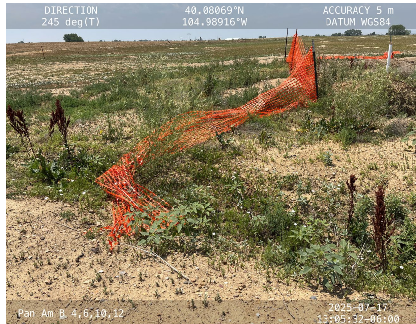
Groundwater within main excavation and inadequate fencing