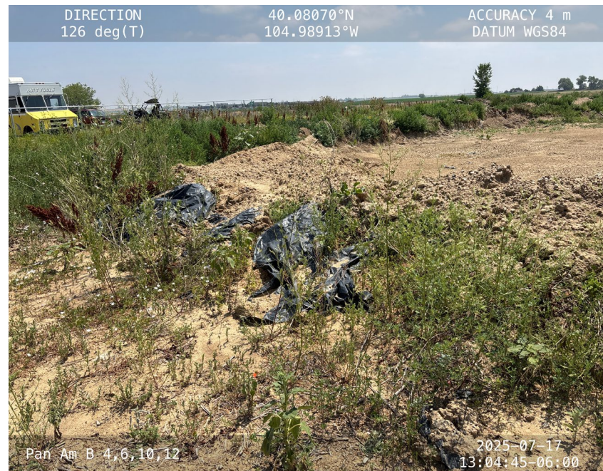
Fencing around main excavation