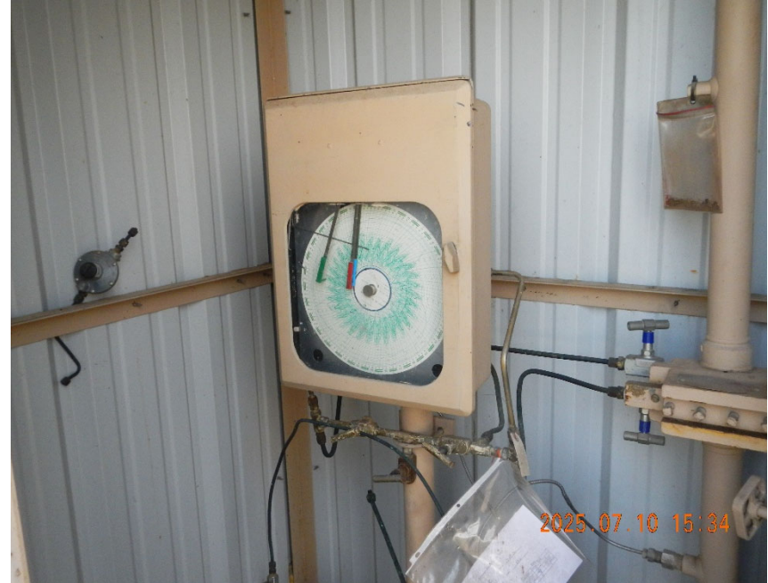
8. Gas Meter inside shed.