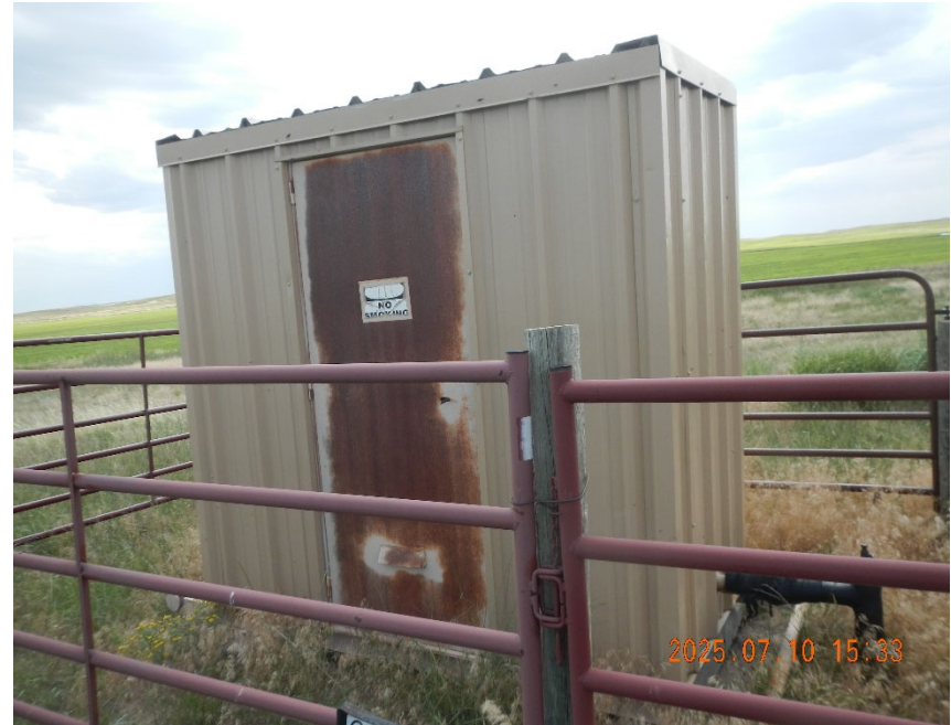
6. View of Separator/Meter Shed.