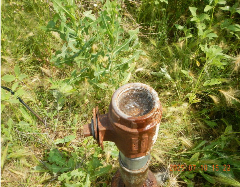
3. View of leaking valve at wellhead.