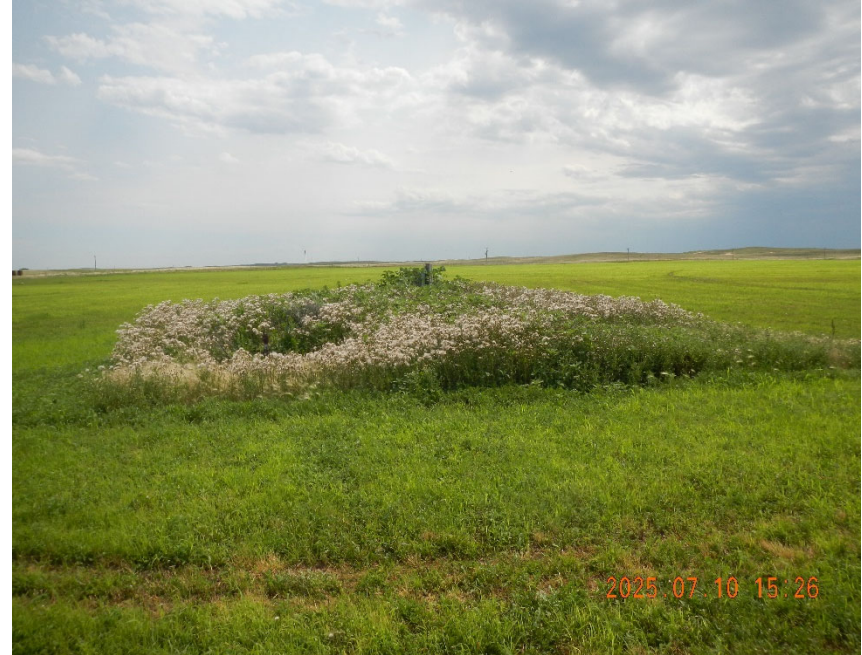
4. Well location overview.