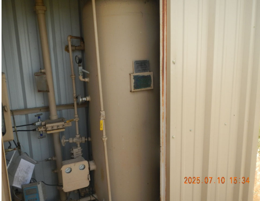
7. Vertical Separator inside shed.