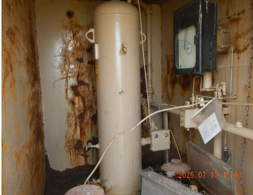
7. Vertical Separator inside shed.