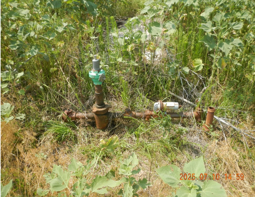
3. View of wellhead.