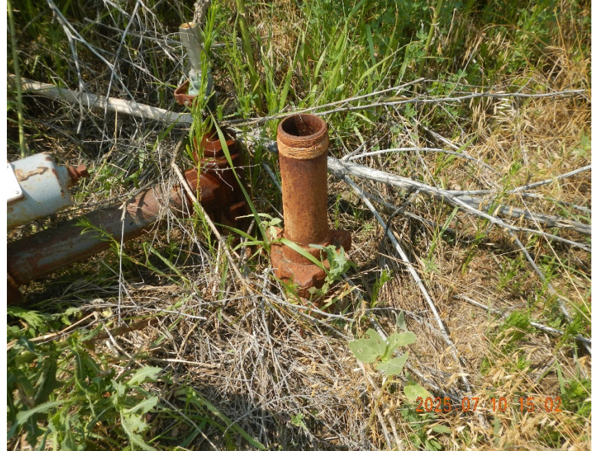
4. View of open ended Flowline Riser at wellhead.