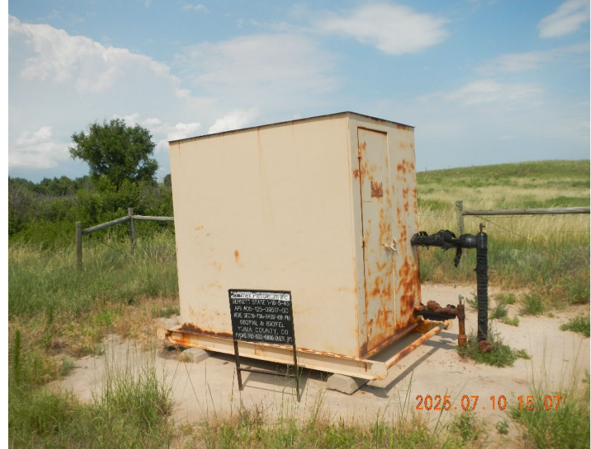
6. View of Separator/Meter Shed at gathering location.