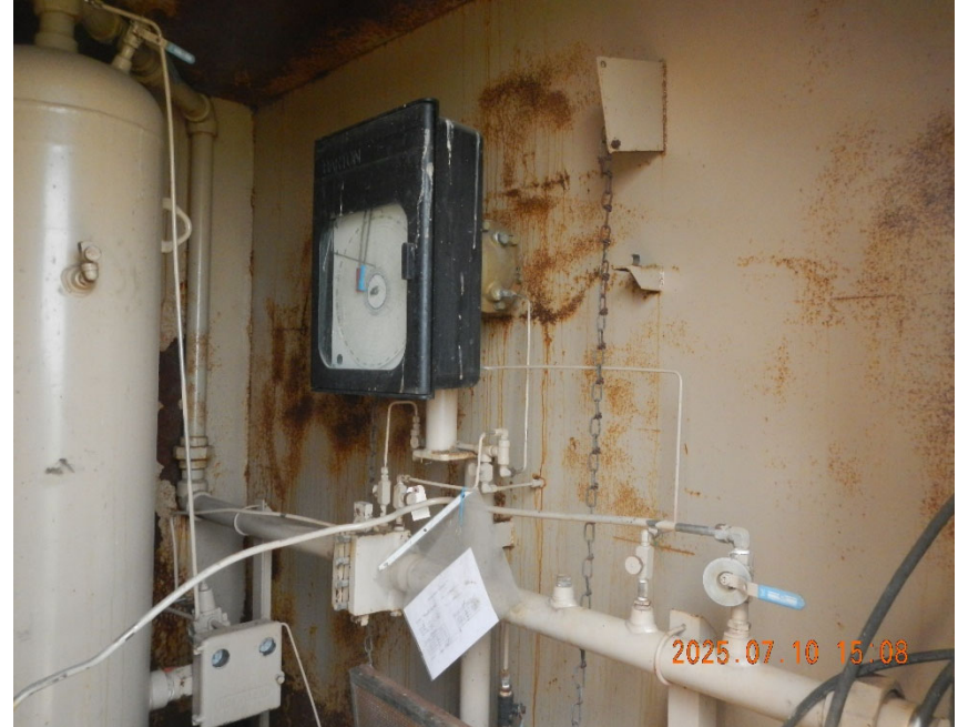
8. Gas Meter inside shed.