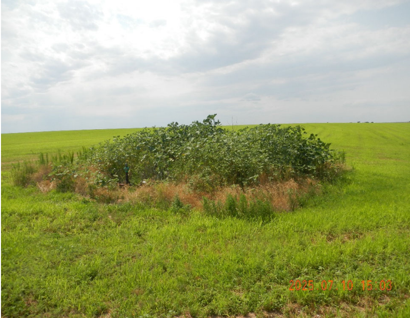
5. Well location overview.