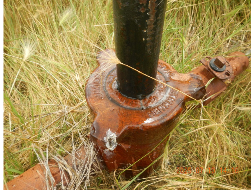
4. View of wellhead. Water was poured on tubing head as visual aid to create bubbles. No fluid coming from well.