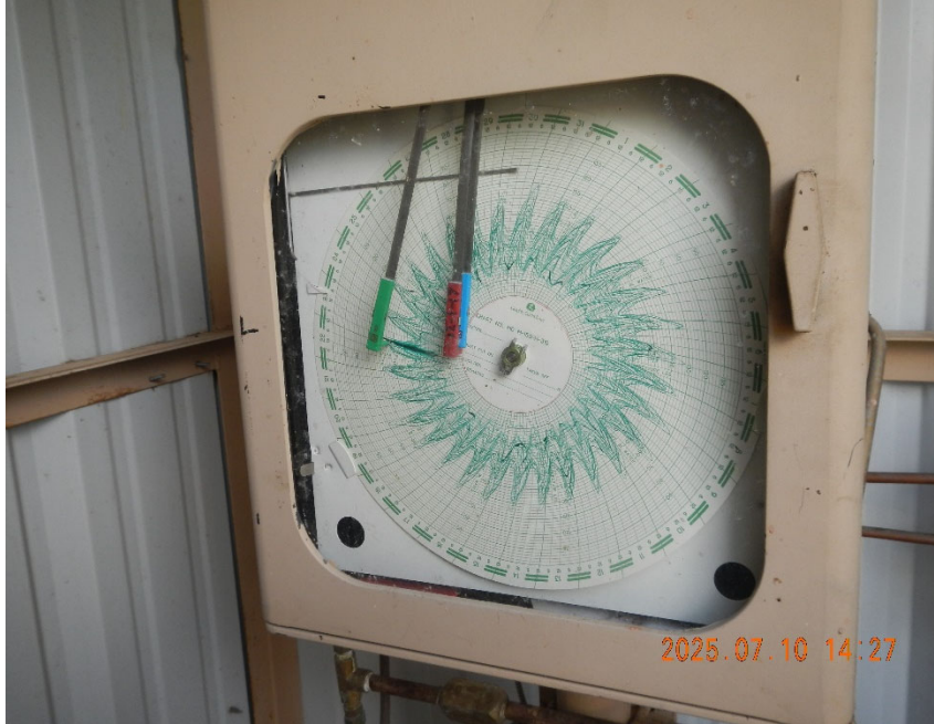
7. Gas meter inside shed.