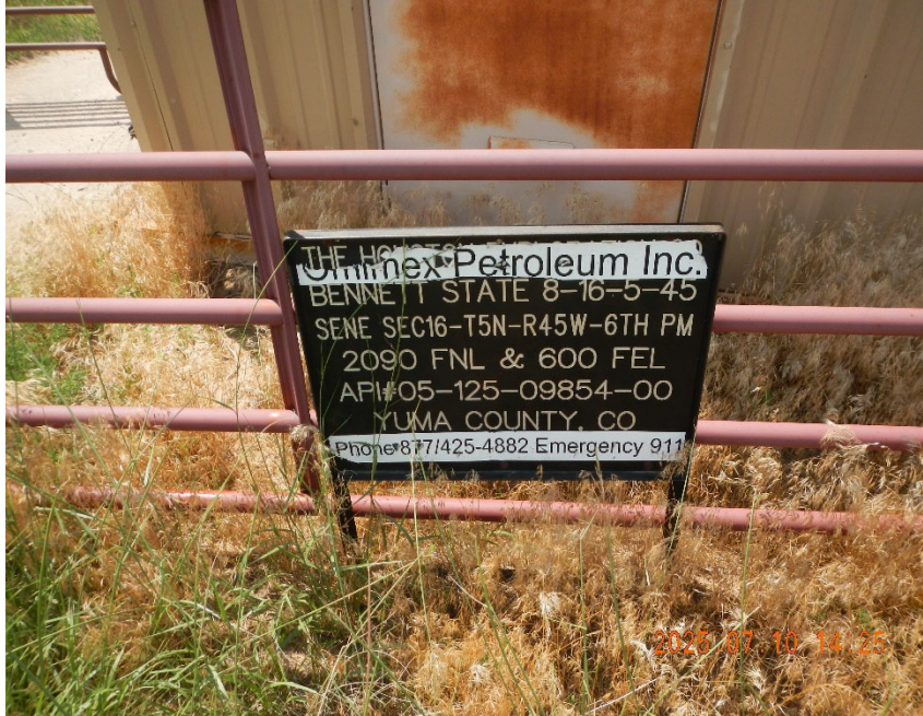
5. Lease sign at shared gathering location.