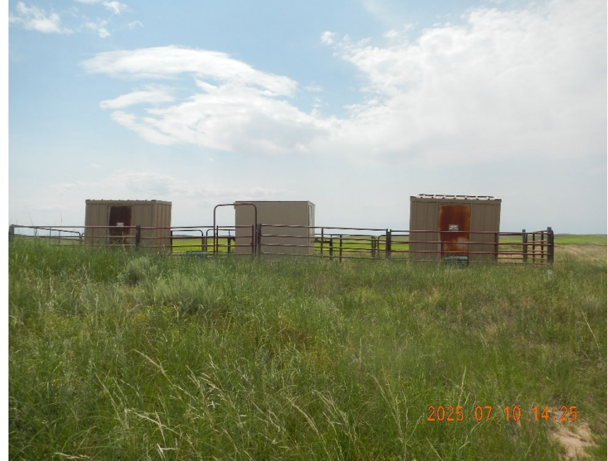
10. Shared gathering location overview.