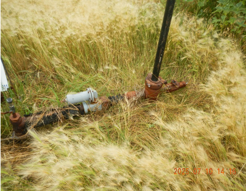
3. View of wellhead.