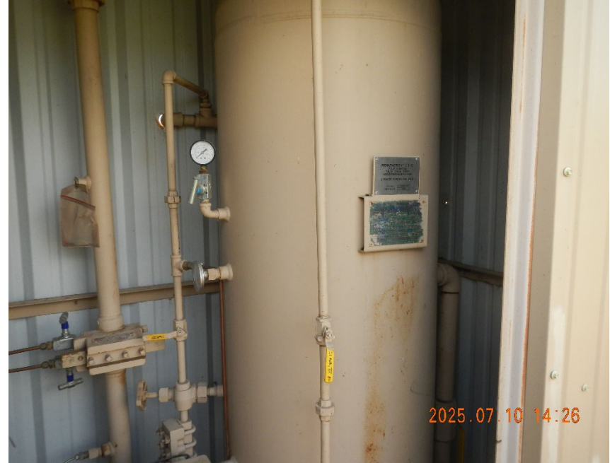
6. Vertical separator inside shed.