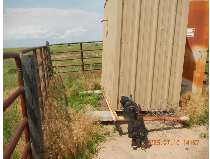
8. View of Shed off cribbing causing it to lean.