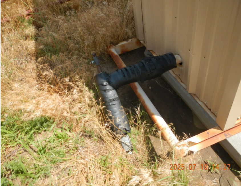
9. View of one of the flowlines bent over due to shed movement off cribbing.