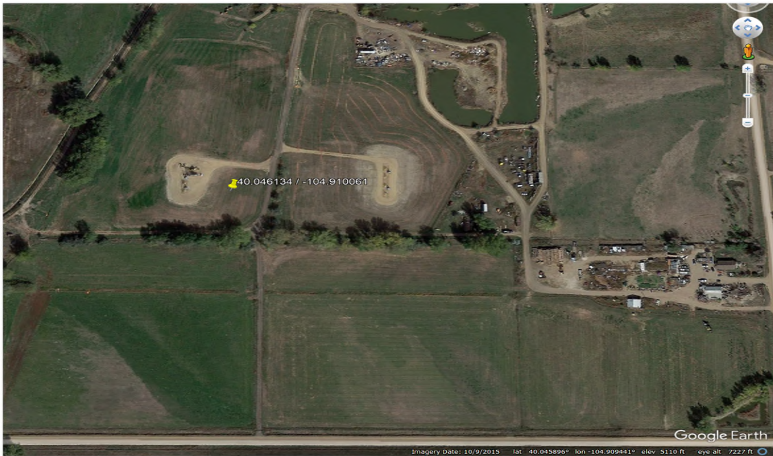
Imagery Date: October 9, 2015

Site Name: Underhill AL 27C-17HZ