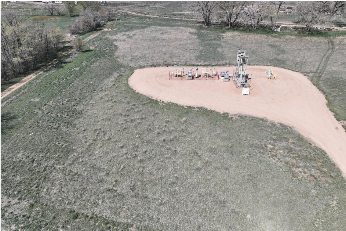
Photograph 4: View facing west as required in Energy and Carbon Management Commission (ECMC) Rule 1004. Photo Taken from GPS 40.046135, -104.909652