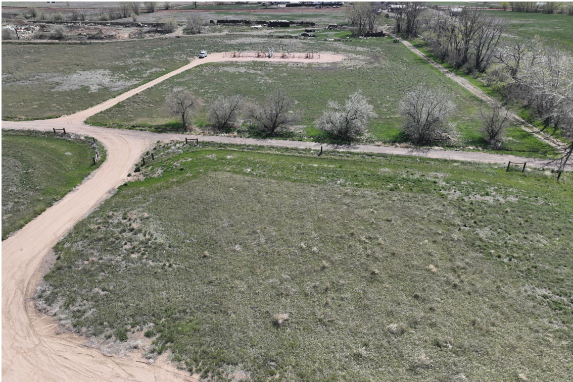
Photograph 2: View facing east as required in Energy and Carbon Management Commission (ECMC) Rule 1004. Photo Taken from GPS 40.046135, -104.910471