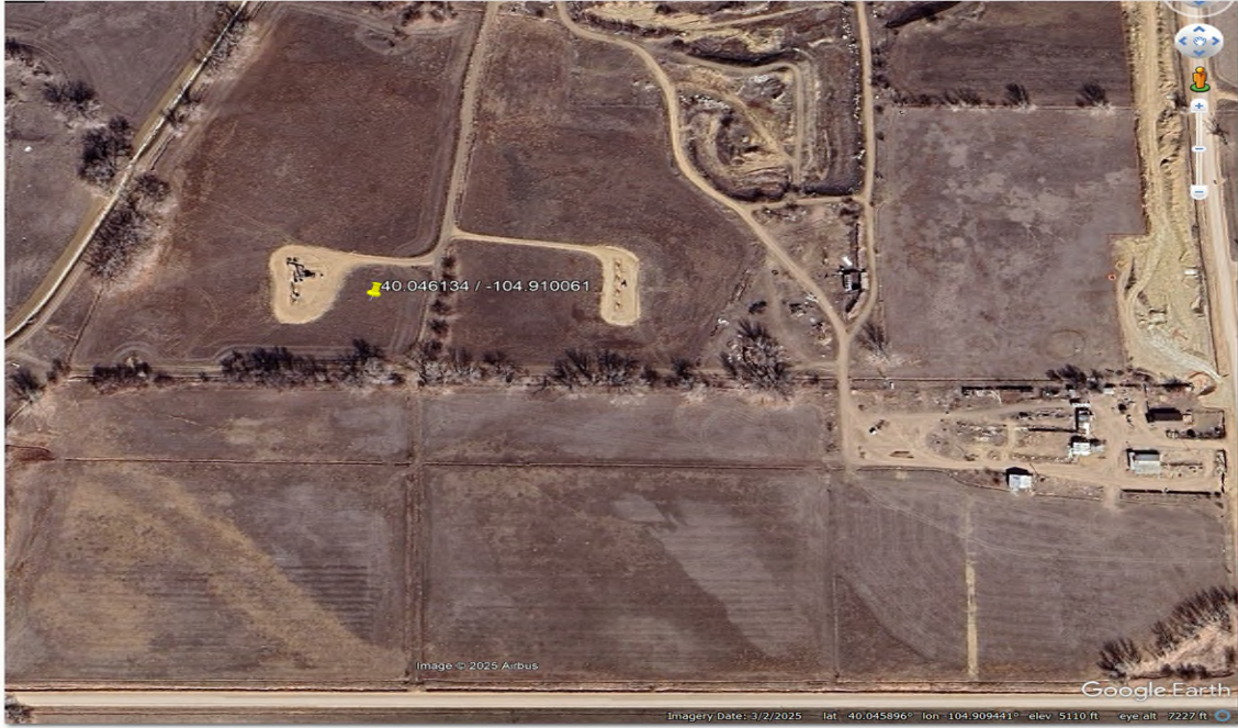
Imagery Date: March 2, 2025

Site Name: Underhill AL 27C-17HZ