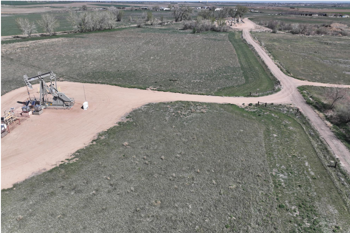
Photograph 1: View facing north as required in Energy and Carbon Management Commission (ECMC) Rule 1004. Photo Taken from GPS 40.045785, -104.910063