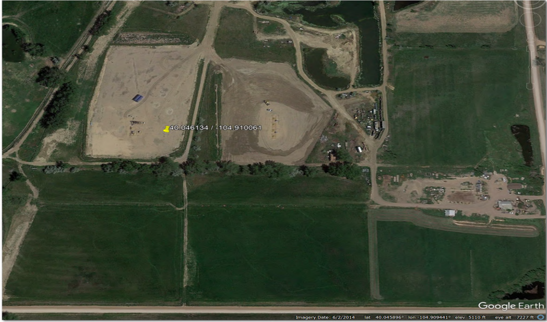
Imagery Date: June 2, 2014