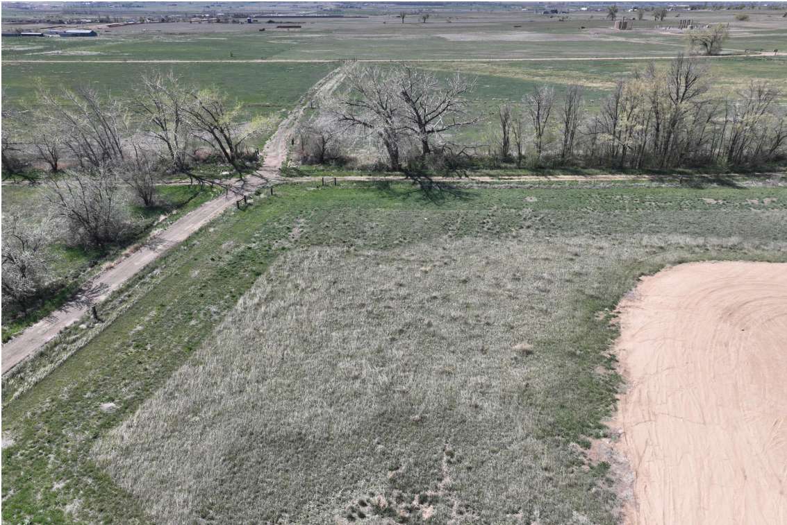
Photograph 3: View facing south as required in Energy and Carbon Management Commission (ECMC) Rule 1004. Photo Taken from GPS 40.046483, -104.910062