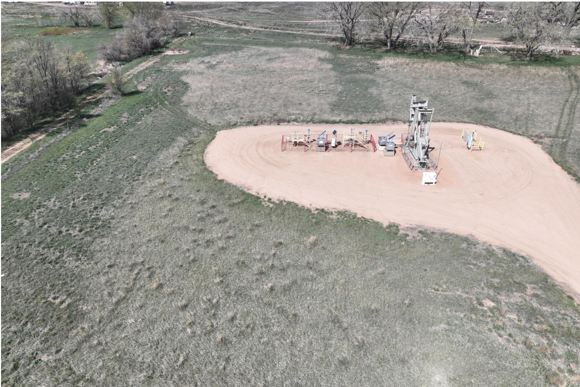
Photograph 4: View facing west as required in Energy and Carbon Management Commission (ECMC) Rule 1004. Photo Taken from GPS 40.046132, -104.909760