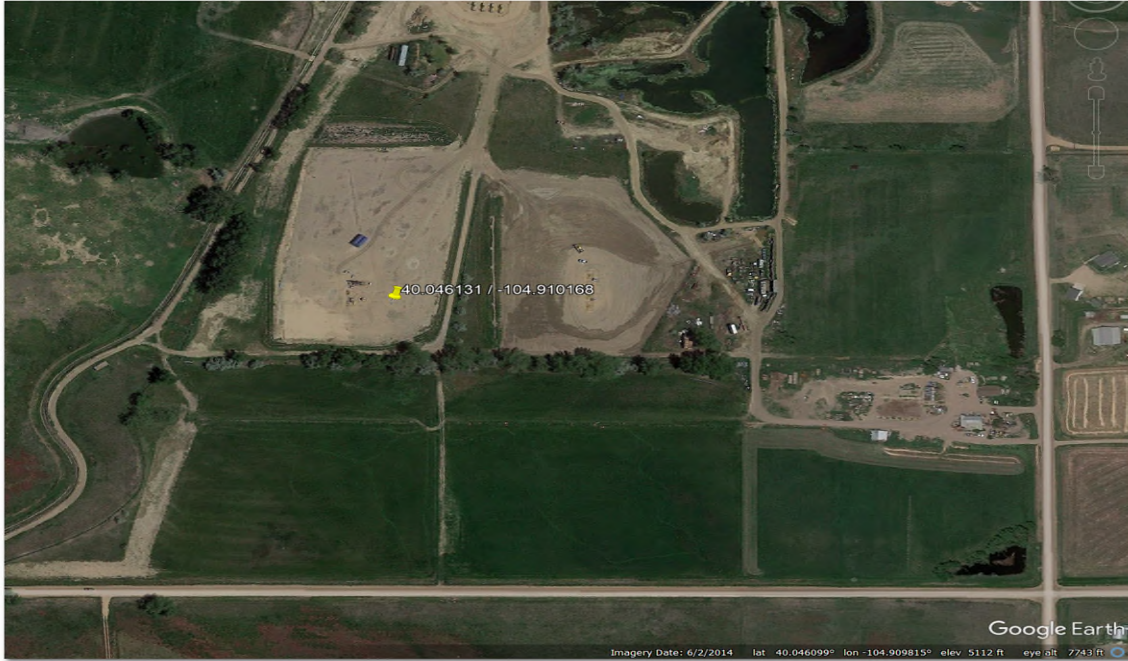
Imagery Date: June 2, 2014