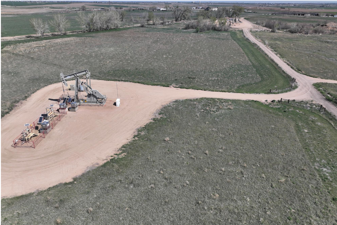
Photograph 1: View facing north as required in Energy and Carbon Management Commission (ECMC) Rule 1004. Photo Taken from GPS 40.045782, -104.910170