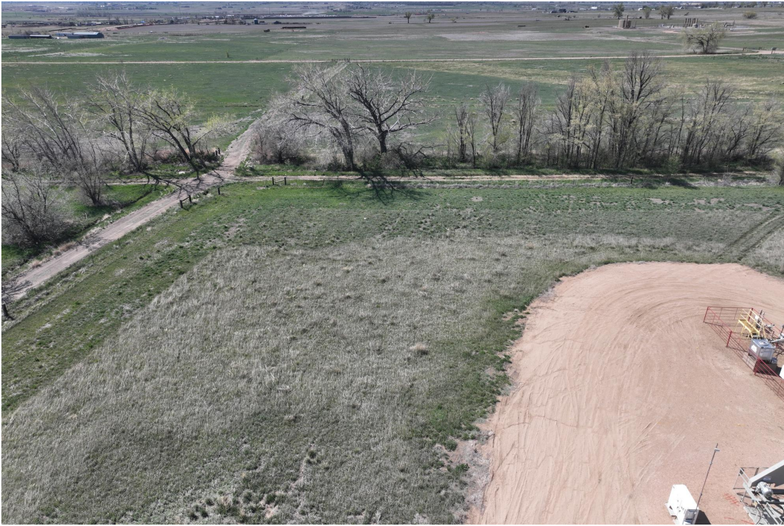
Photograph 3: View facing south as required in Energy and Carbon Management Commission (ECMC) Rule 1004. Photo Taken from GPS 40.046480, -104.910169