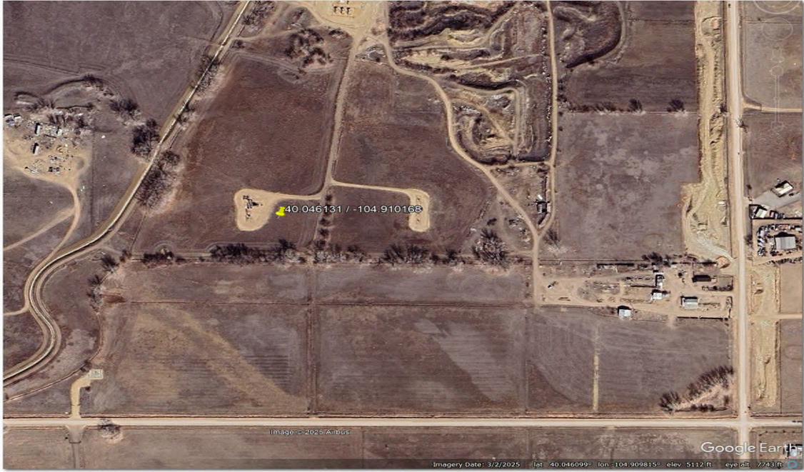
Imagery Date: March 2, 2025

Site Name: Underhill AL 2N-17HZ