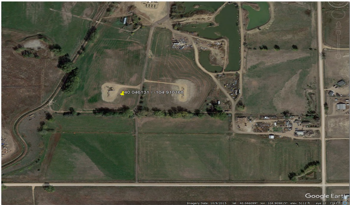
Imagery Date: October 9, 2015

Site Name: Underhill AL 2N-17HZ