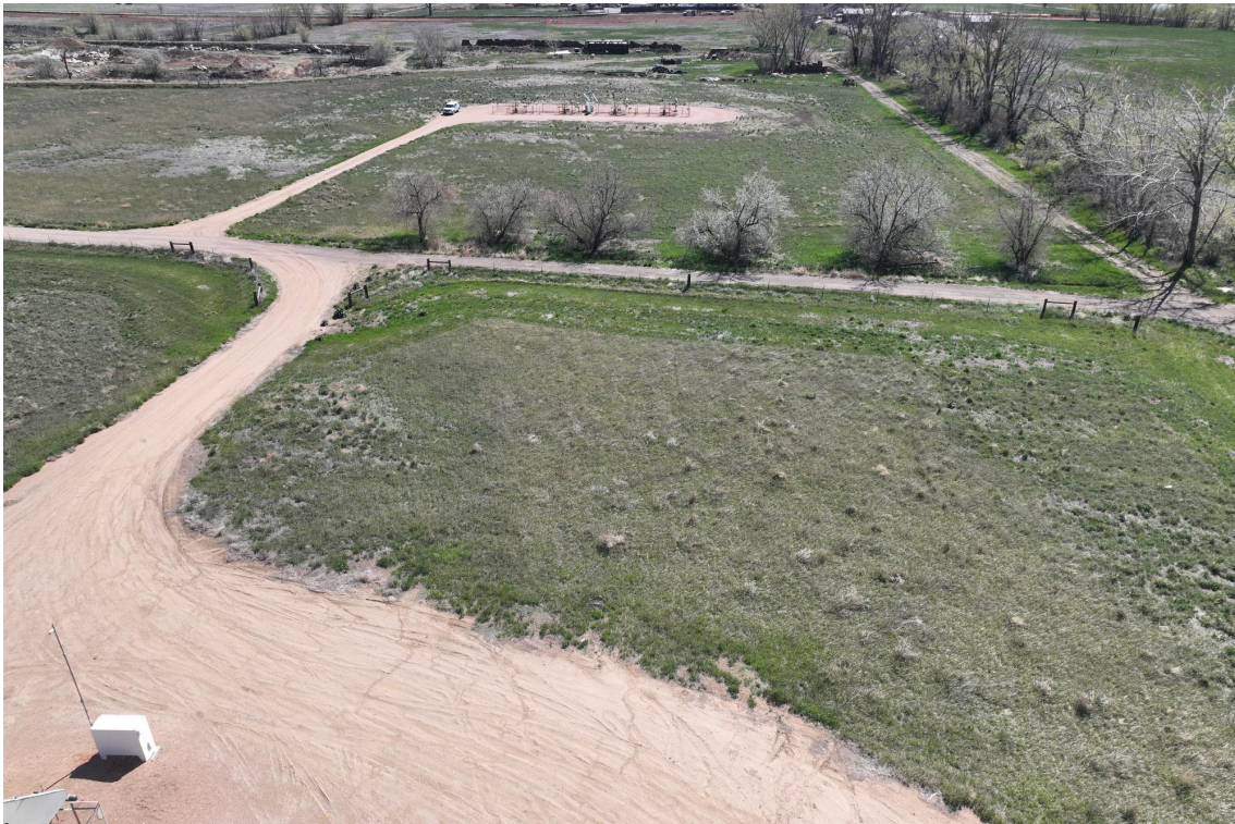
Photograph 2: View facing east as required in Energy and Carbon Management Commission (ECMC) Rule 1004. Photo Taken from GPS 40.046132, -104.910579