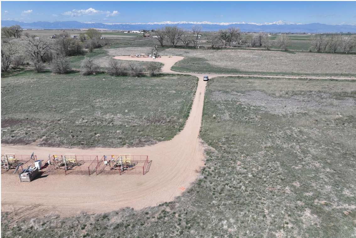
Photograph 4: View facing west as required in Energy and Carbon Management Commission (ECMC) Rule 1004. Photo Taken from GPS 40.046443, -104.908193