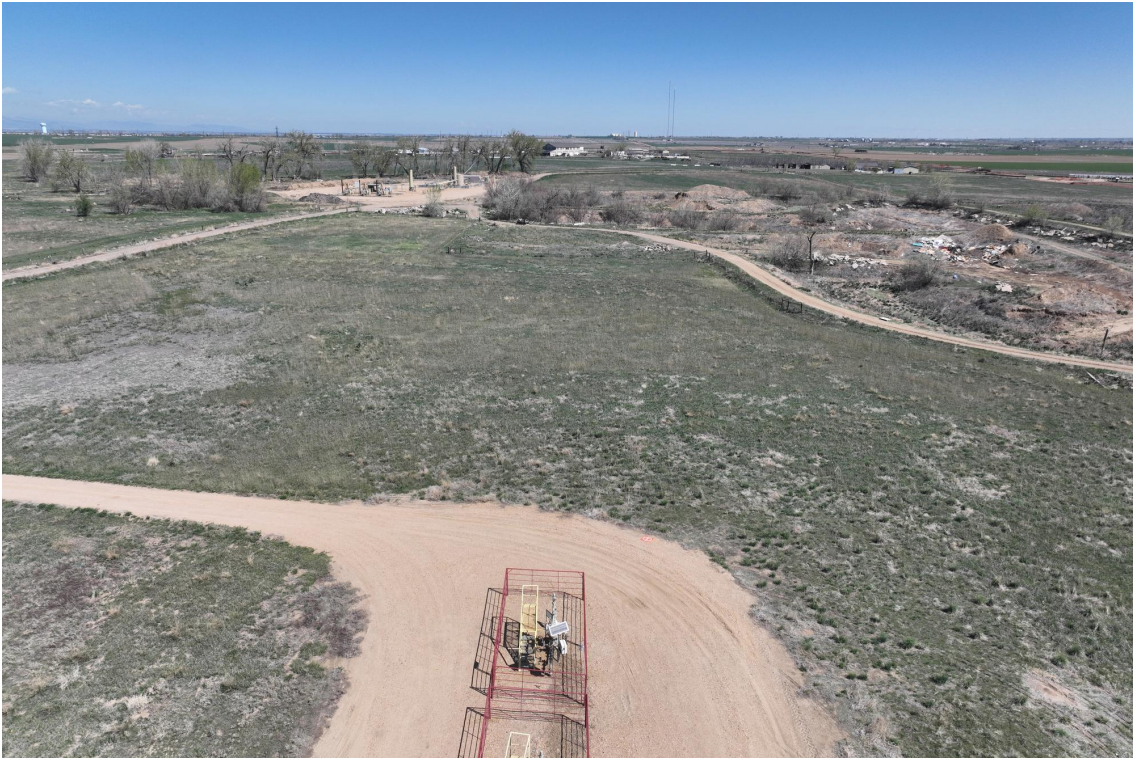
Photograph 1: View facing north as required in Energy and Carbon Management Commission (ECMC) Rule 1004. Photo Taken from GPS 40.046094, -104.908603