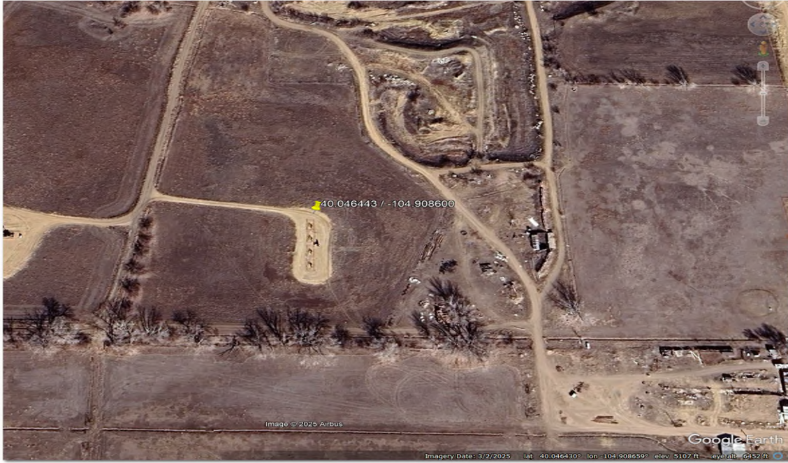
Imagery Date: March 2, 2025

Site Name: Underhill 16S-8HZ AL