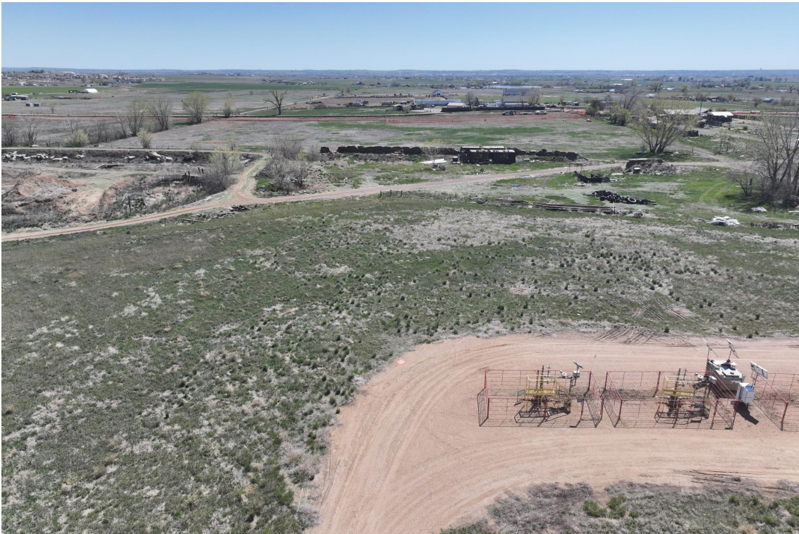
Photograph 2: View facing east as required in Energy and Carbon Management Commission (ECMC) Rule 1004. Photo Taken from GPS 40.046443, -104.909011