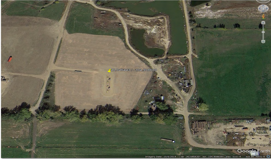
Imagery Date: October 6, 2014