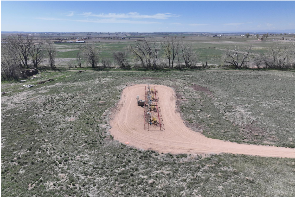
Photograph 3: View facing south as required in Energy and Carbon Management Commission (ECMC) Rule 1004. Photo Taken from GPS 40.046791, -104.908600