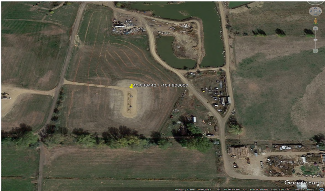
Imagery Date: October 9, 2015

Site Name: Underhill 16S-8HZ AL Imagery Source: Google Earth