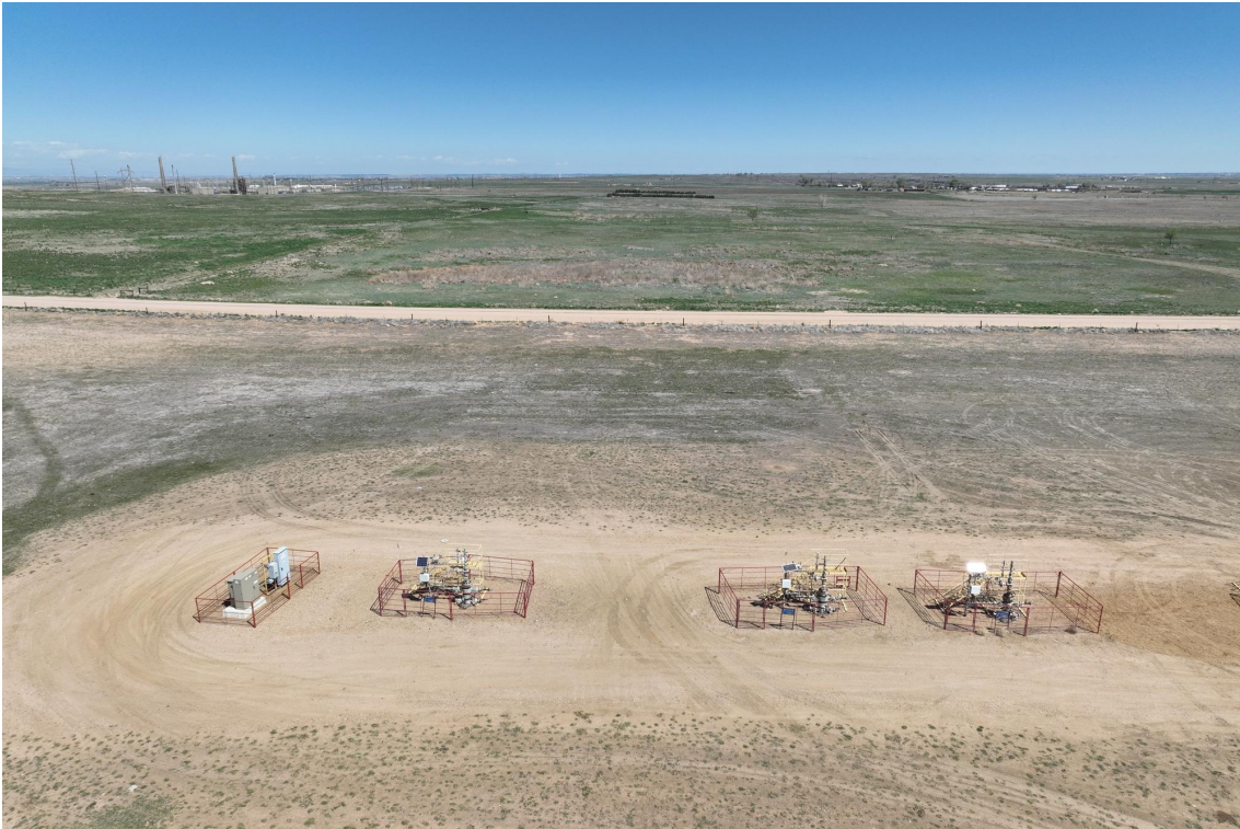
Photograph 1: View facing north as required in Energy and Carbon Management Commission (ECMC) Rule 1004. Photo Taken from GPS 40.129839, -104.738528