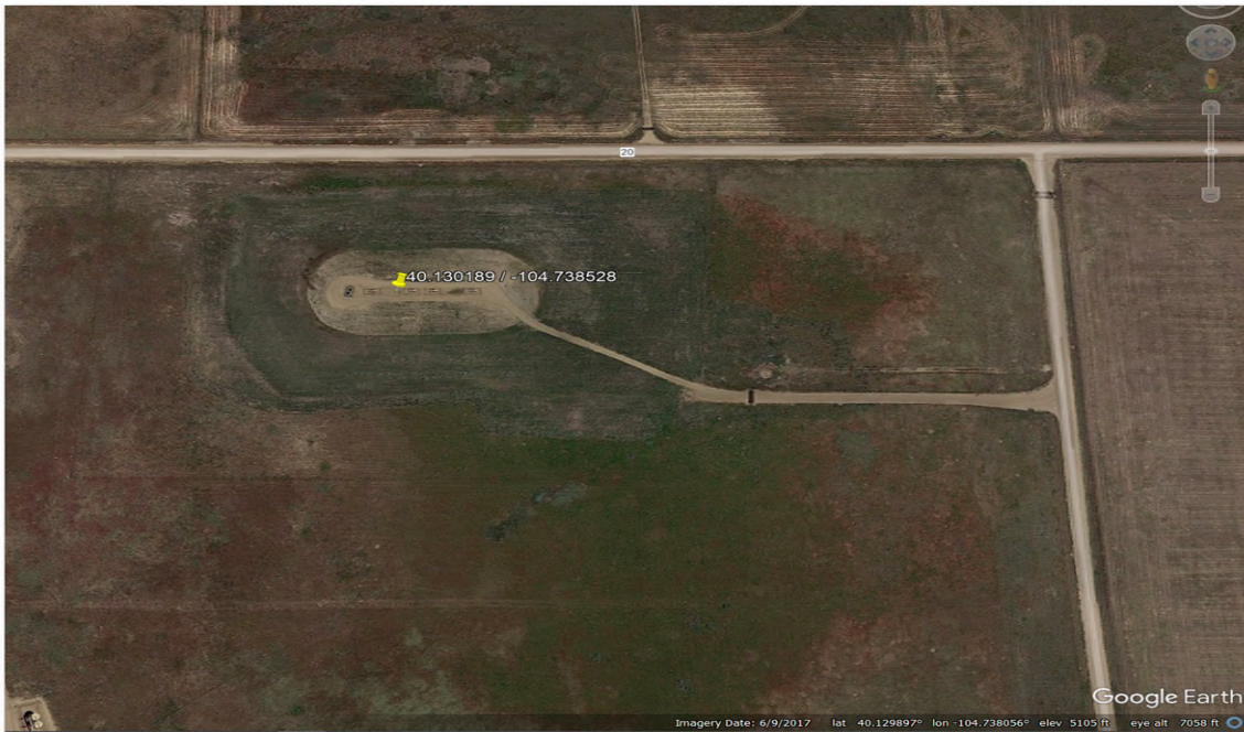
Imagery Date: June 9, 2017

Site Name: Turkey Springs 28C-14HZ AL