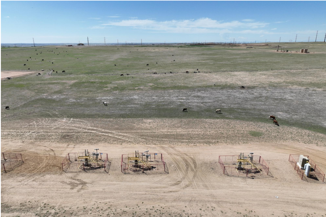
Photograph 3: View facing south as required in Energy and Carbon Management Commission (ECMC) Rule 1004. Photo Taken from GPS 40.130538, -104.738529