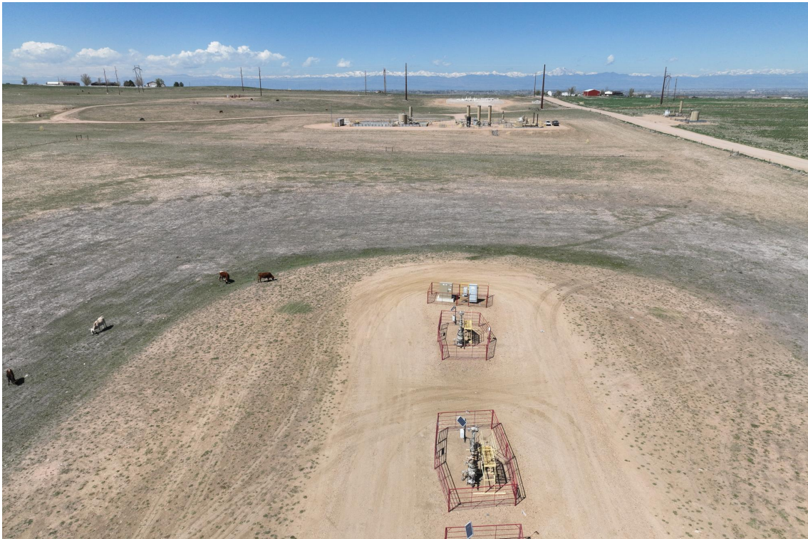
Photograph 4: View facing west as required in Energy and Carbon Management Commission (ECMC) Rule 1004. Photo Taken from GPS 40.130189, -104.738118