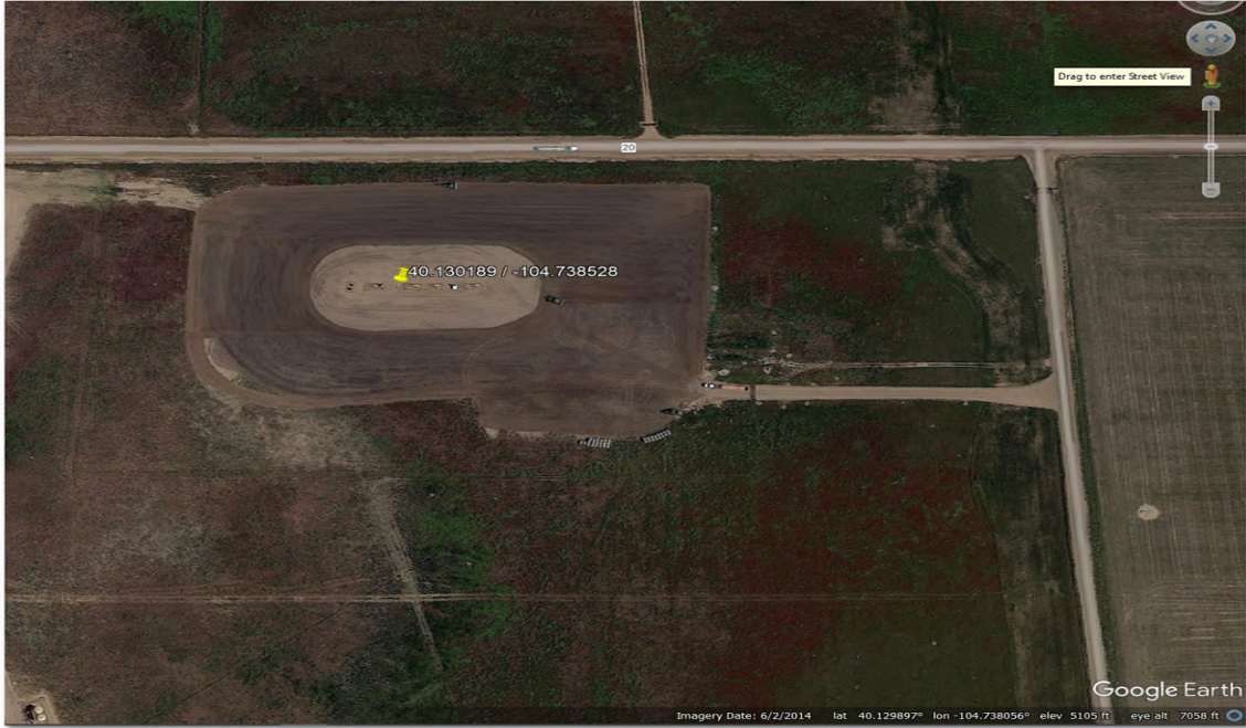
Imagery Date: June 2, 2014