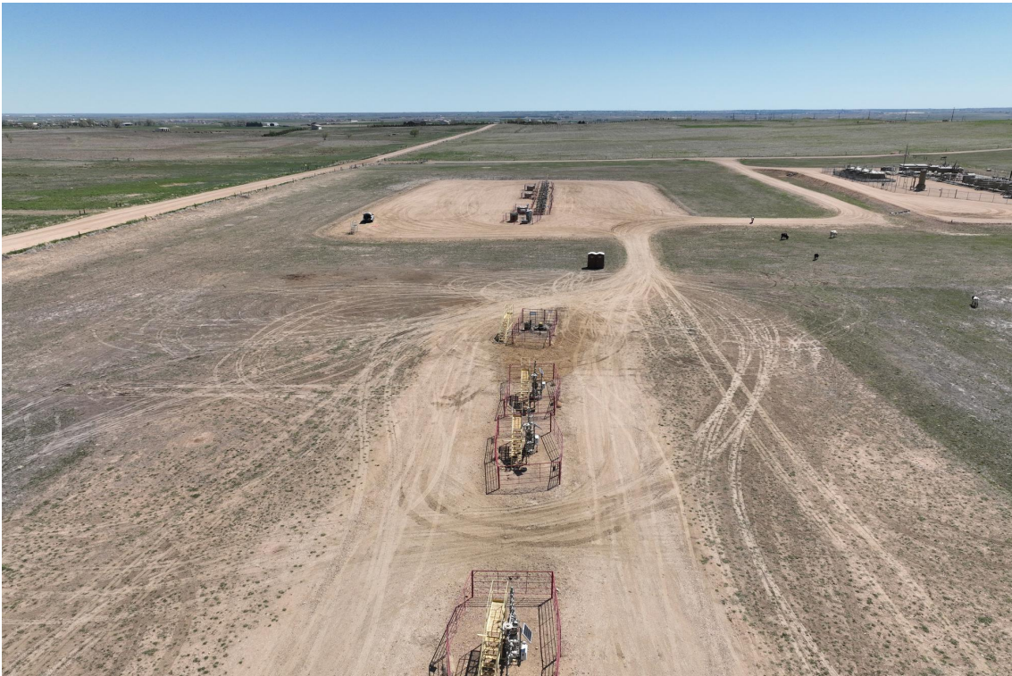
Photograph 2: View facing east as required in Energy and Carbon Management Commission (ECMC) Rule 1004. Photo Taken from GPS 40.130188, -104.738939