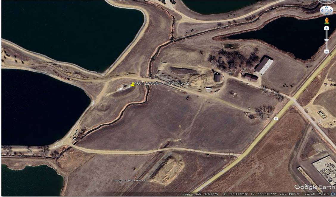
Imagery Date: March 2, 2025

Site Name: Stromquist 12-21 AL