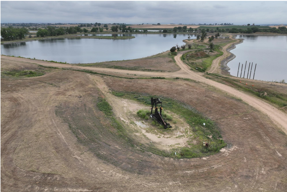
Photograph 4: View facing west as required in Energy and Carbon Management Commission (ECMC) Rule 1004. Photo Taken from GPS 40.122336, -105.015319