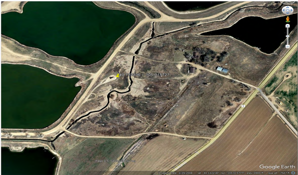
Imagery Date: February 29, 2008

Site Name: Stromquist 12-21 AL