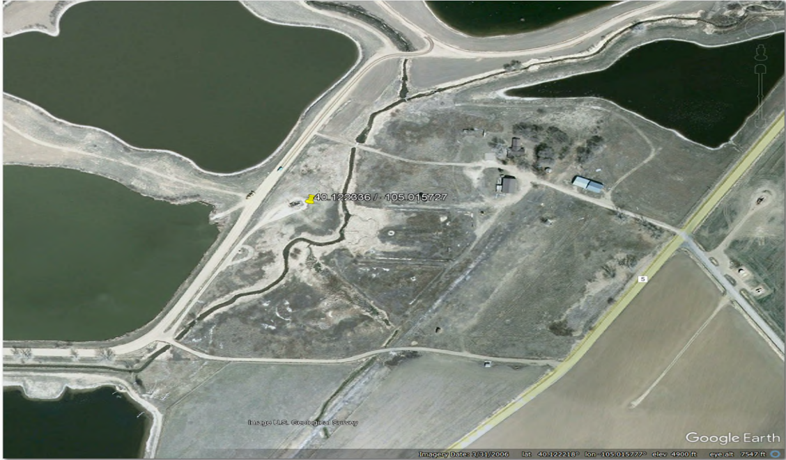
Imagery Date: March 31, 2006