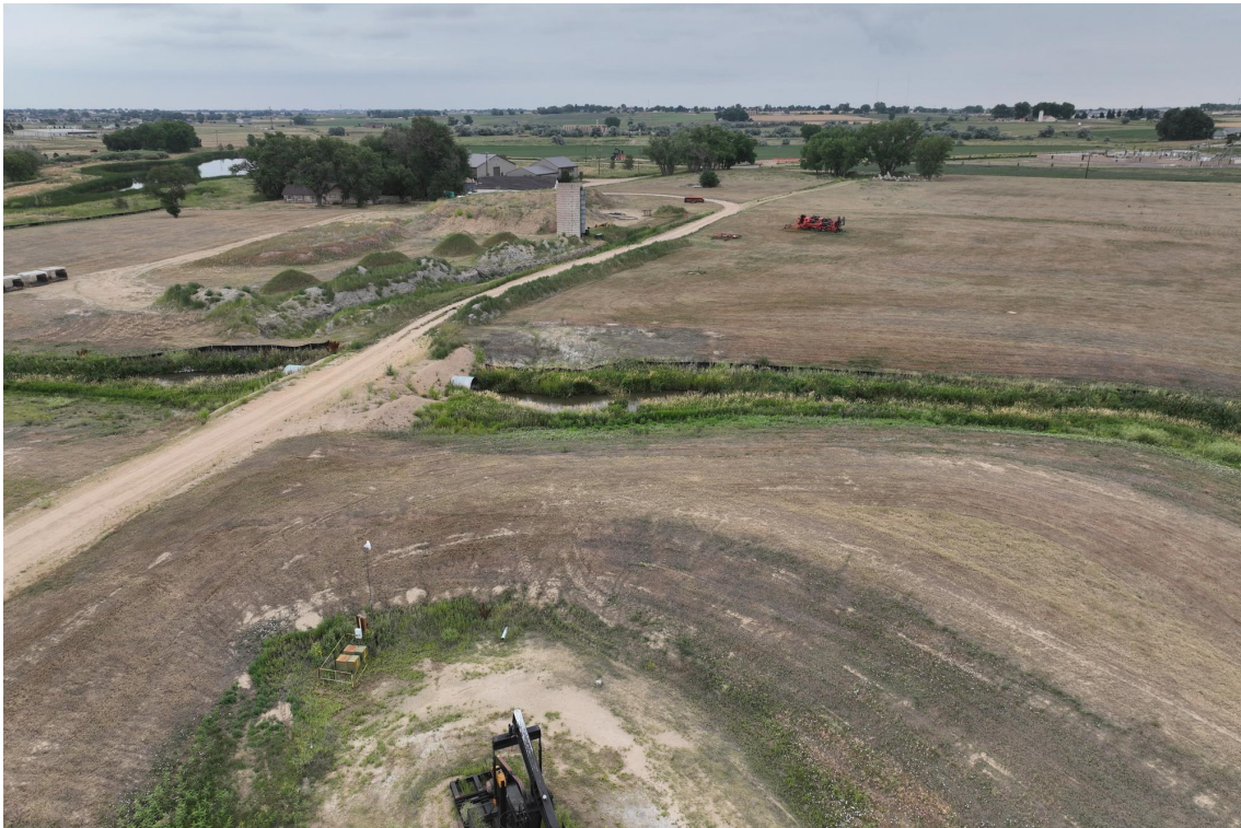
Photograph 2: View facing east as required in Energy and Carbon Management Commission (ECMC) Rule 1004. Photo Taken from GPS 40.122336, -105.016137