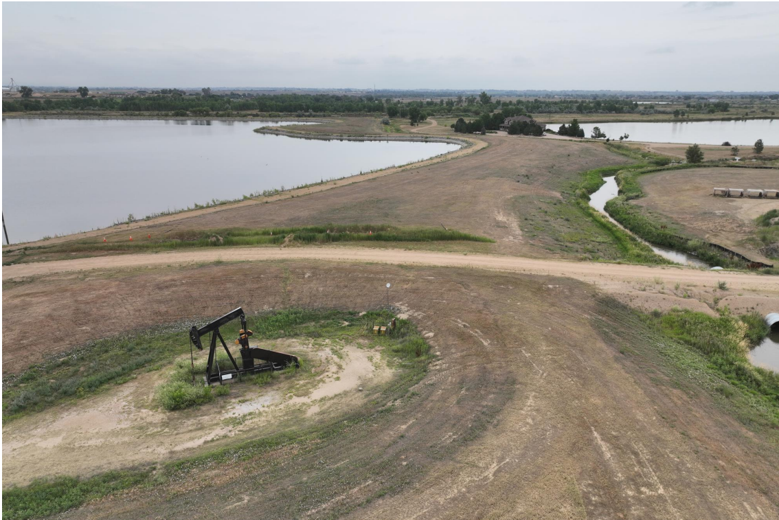
Photograph 1: View facing north as required in Energy and Carbon Management Commission (ECMC) Rule 1004. Photo Taken from GPS 40.121987, -105.015728