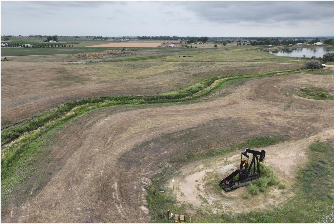
Photograph 3: View facing south as required in Energy and Carbon Management Commission (ECMC) Rule 1004. Photo Taken from GPS 40.122685, -105.015728