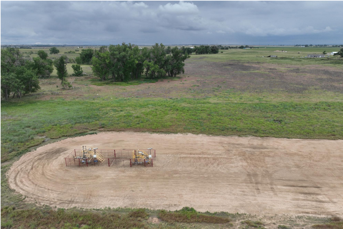
Photograph 3: View facing south as required in Energy and Carbon Management Commission (ECMC) Rule 1004. Photo Taken from GPS 40.158933, -104.637522