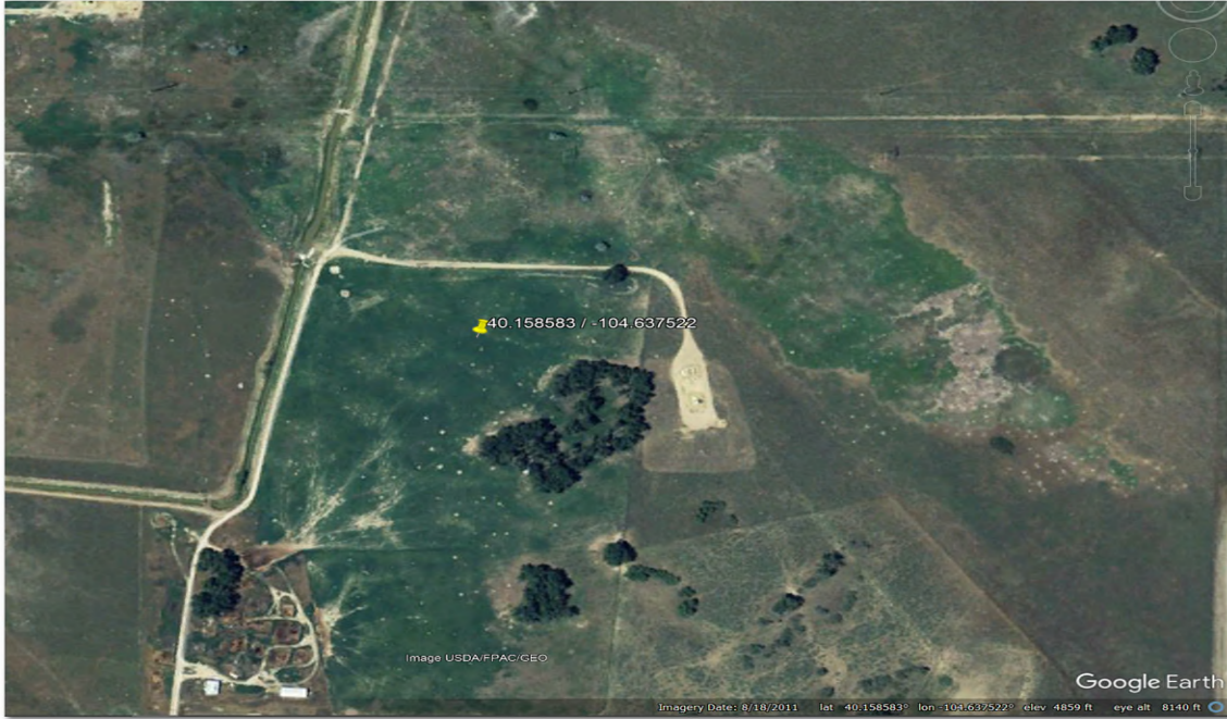
Imagery Date: August 18, 2011