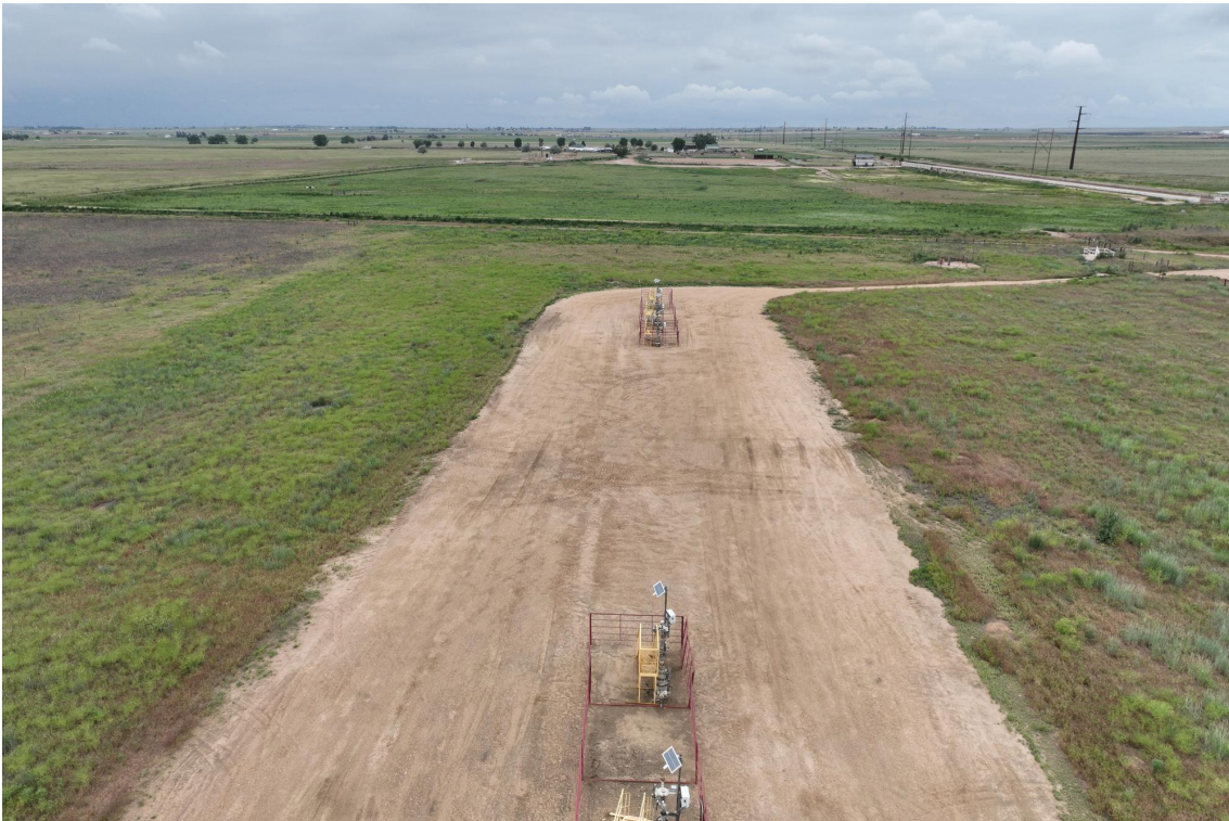
Photograph 4: View facing west as required in Energy and Carbon Management Commission (ECMC) Rule 1004. Photo Taken from GPS 40.158582, -104.637111