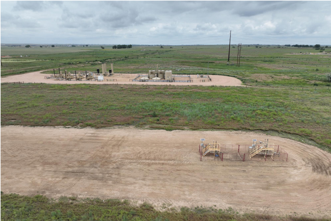
Photograph 1: View facing north as required in Energy and Carbon Management Commission (ECMC) Rule 1004. Photo Taken from GPS 40.158233, -104.637521