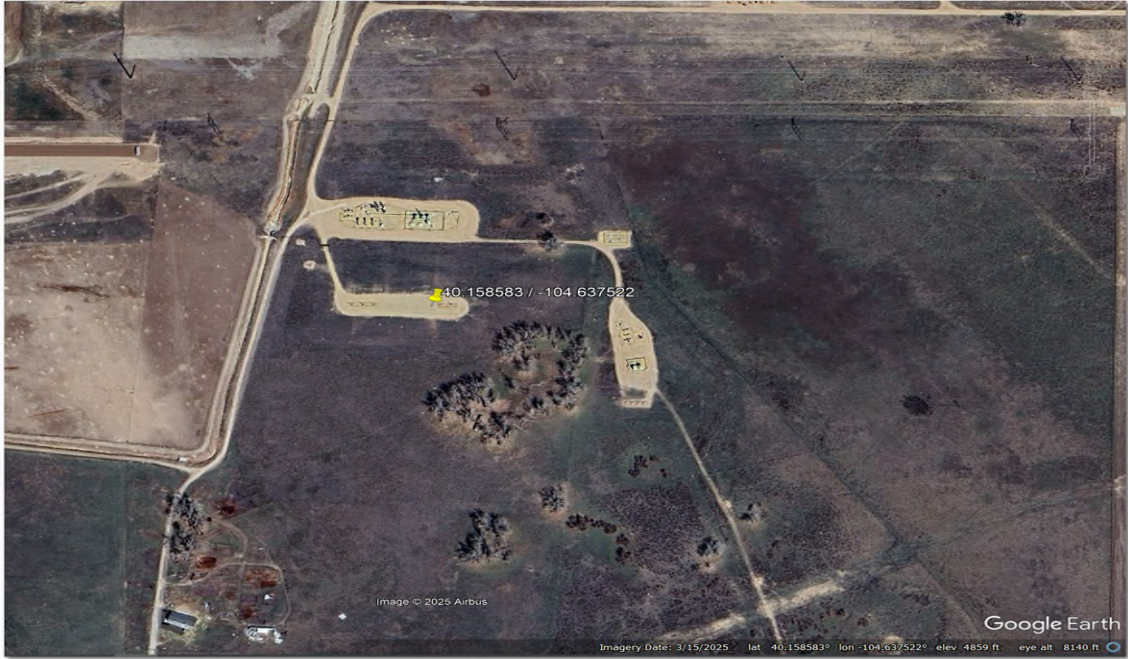
Imagery Date: March 15, 2025