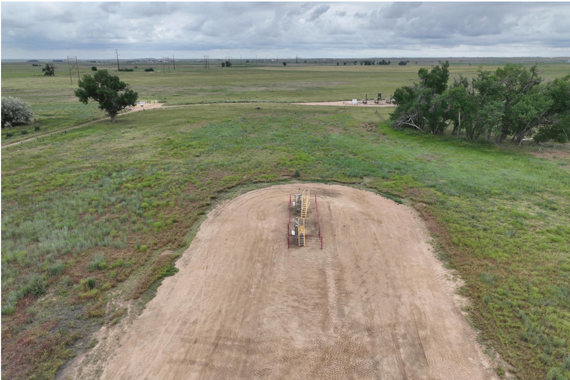
Photograph 2: View facing east as required in Energy and Carbon Management Commission (ECMC) Rule 1004. Photo Taken from GPS 40.158583, -104.637931