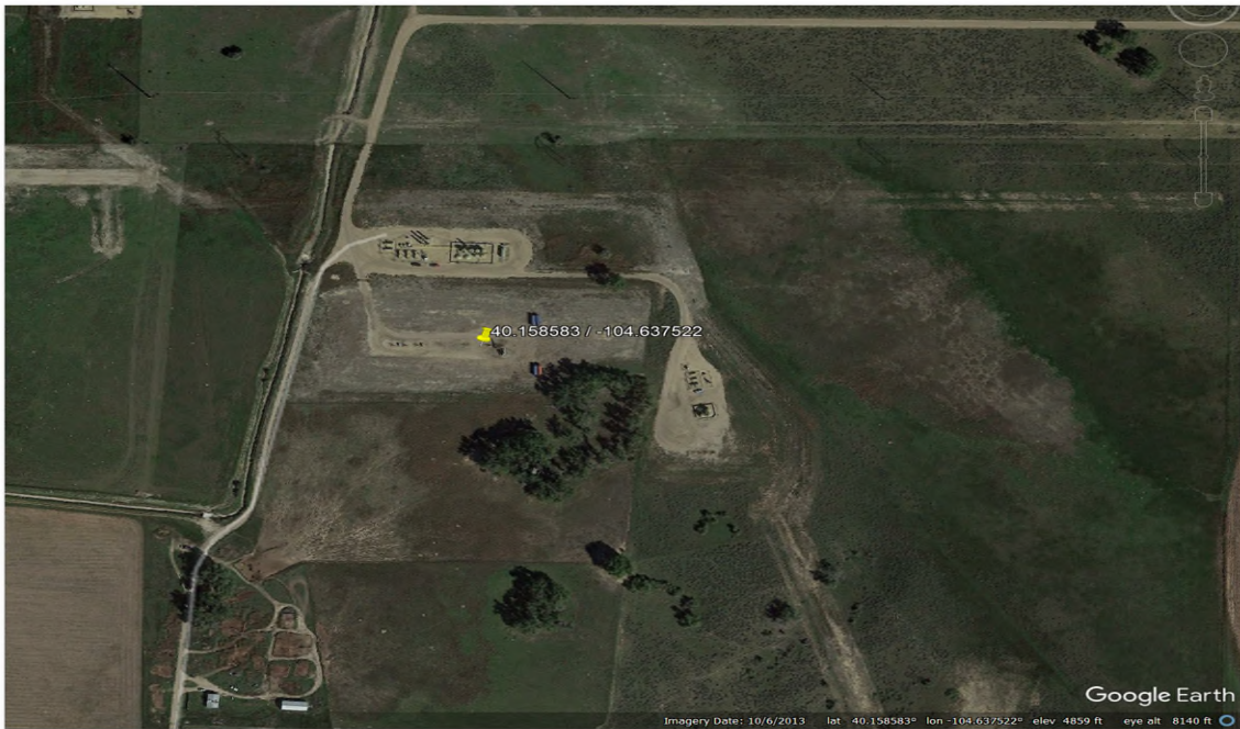
Imagery Date: October 6, 2013

Site Name: PALYO 35S-11HZ AL