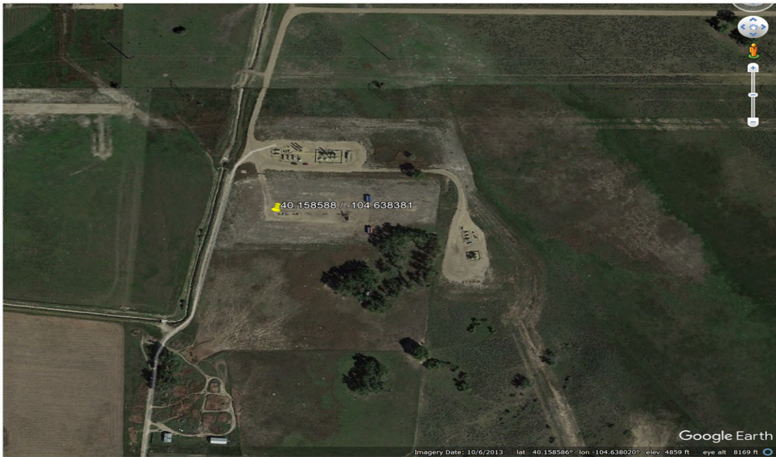
Imagery Date: October 6, 2013

Site Name: PALYO 26N-11HZ AL