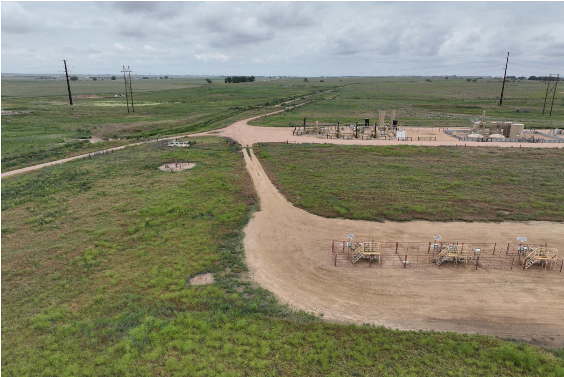
Photograph 1: View facing north as required in Energy and Carbon Management Commission (ECMC) Rule 1004. Photo Taken from GPS 40.158237, -104.638379