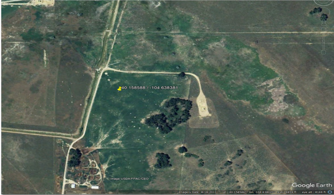
Imagery Date: August 18, 2011