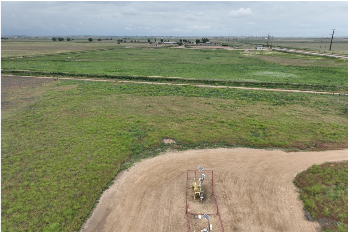
Photograph 4: View facing west as required in Energy and Carbon Management Commission (ECMC) Rule 1004. Photo Taken from GPS 40.158588, -104.637970