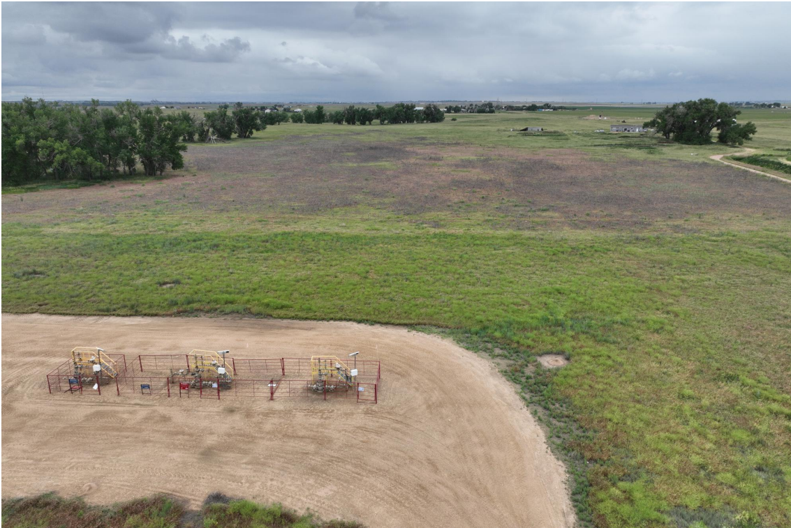
Photograph 3: View facing south as required in Energy and Carbon Management Commission (ECMC) Rule 1004. Photo Taken from GPS 40.158937, -104.638381