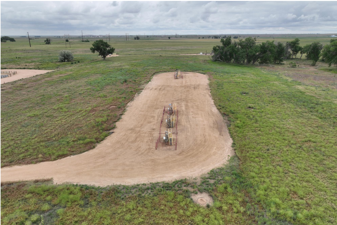
Photograph 2: View facing east as required in Energy and Carbon Management Commission (ECMC) Rule 1004. Photo Taken from GPS 40.158587, -104.638790