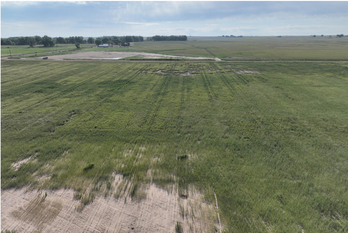
Photograph 2: View facing east as required in Energy and Carbon Management Commission (ECMC) Rule 1004. Photo Taken from GPS 40.230330, -104.757029