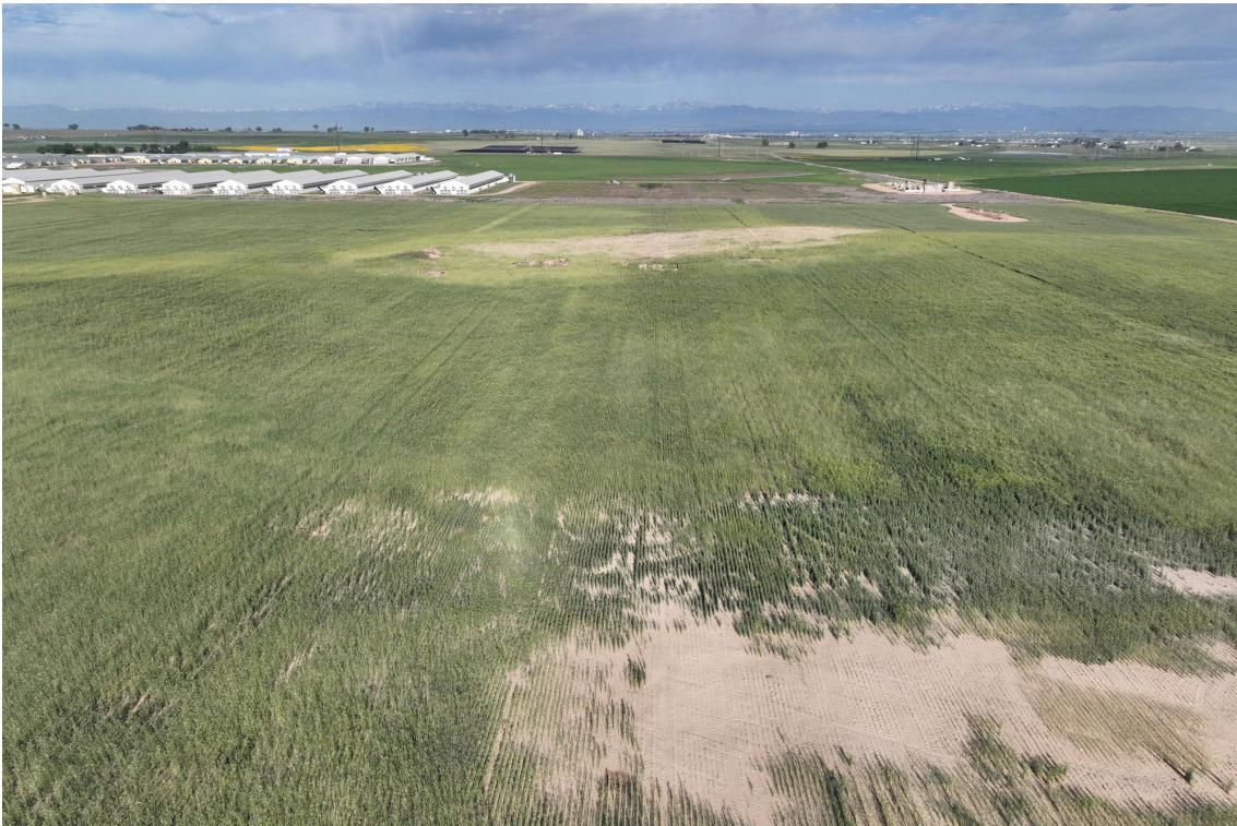
Photograph 4: View facing west as required in Energy and Carbon Management Commission (ECMC) Rule 1004. Photo Taken from GPS 40.230332, -104.756210