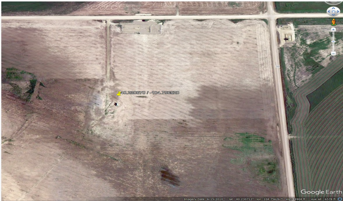
Imagery Date: June 15, 2010

Site Name: Morning 41-15 AL