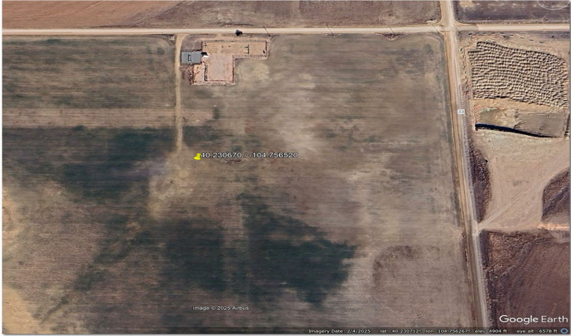
Imagery Date: February 4, 2025