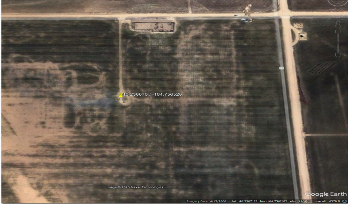
Imagery Date: April 12, 2006