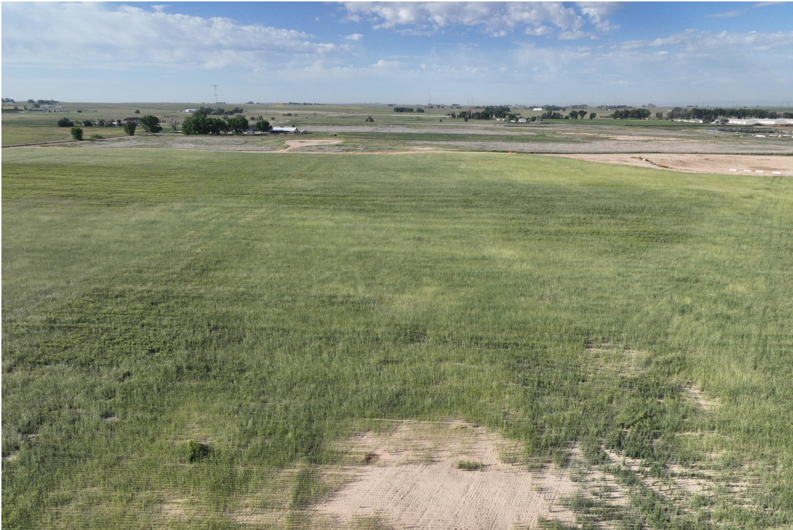
Photograph 3: View facing south as required in Energy and Carbon Management Commission (ECMC) Rule 1004. Photo Taken from GPS 40.230680, -104.756621