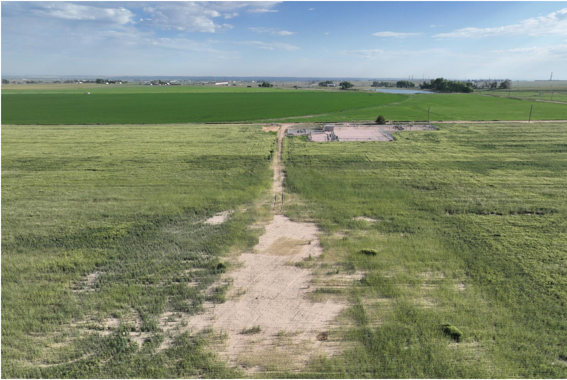
Photograph 1: View facing north as required in Energy and Carbon Management Commission (ECMC) Rule 1004. Photo Taken from GPS 40.229981, -104.756619