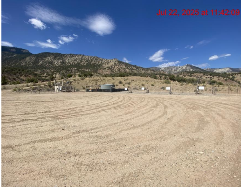
Location Overview – Photo #09851