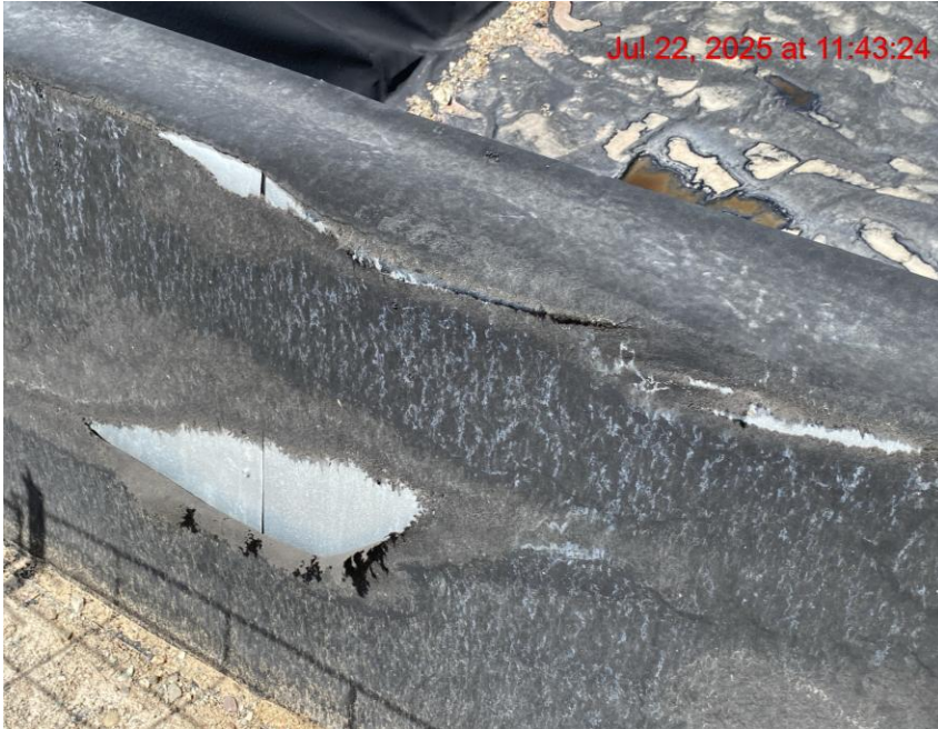
Unserviceable Containment Liner – Photo #09855