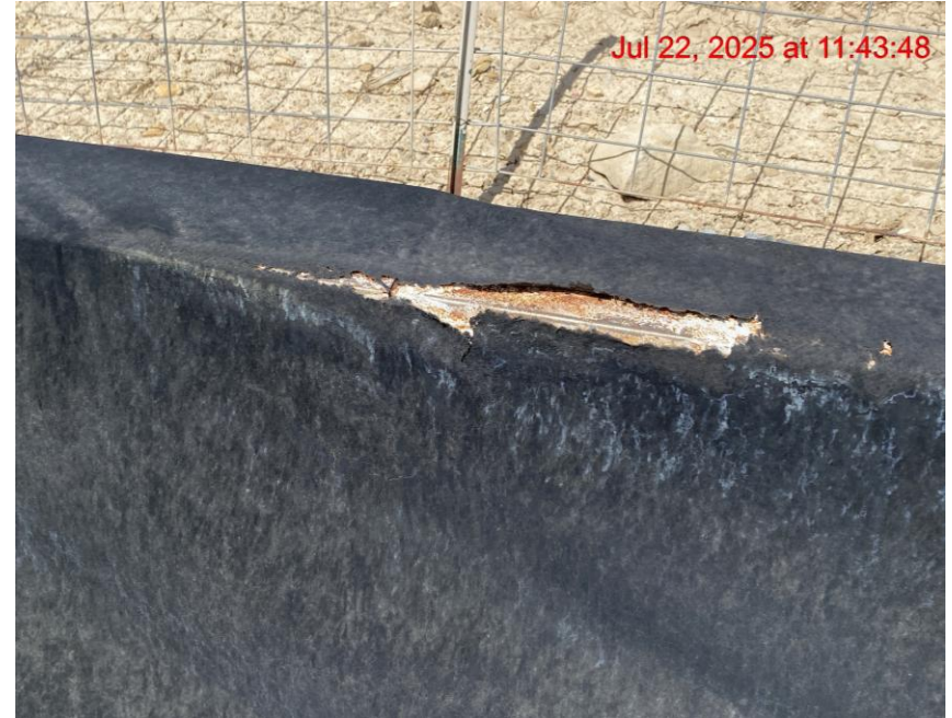
Unserviceable Containment Liner – Photo #09856