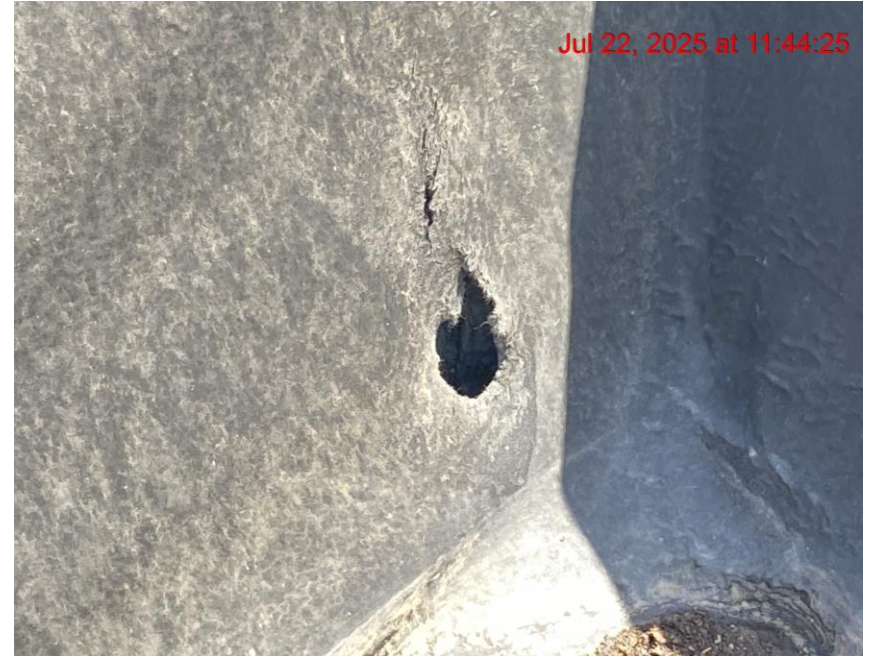
Unserviceable Containment Liner – Photo #09860