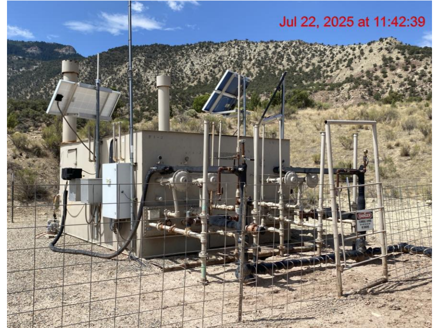
Location – Photo #09852