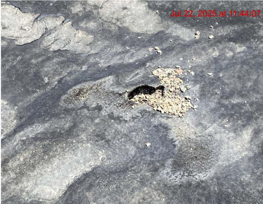
Unserviceable Containment Liner – Photo #09859