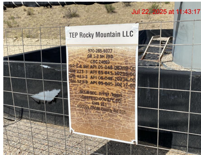
Location – Photo #09853