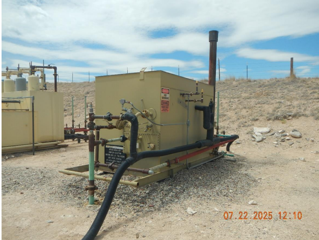
2" dumpline is disconnected behind the separator for GMR 28-1A. No OOSLAT is on the line.