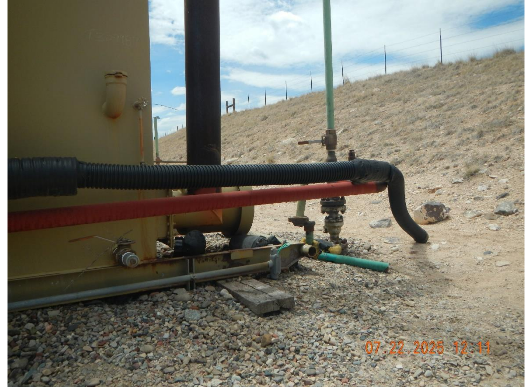
2" dumpline is disconnected behind the separator for GMR 28-1A. No OOSLAT is on the line.