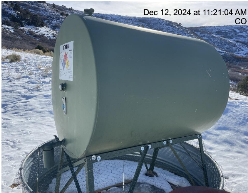
Photo # 3391 From inspection 708905234 conducted on 12/12/2024 Methanol tank improperly labeled/missing some required information