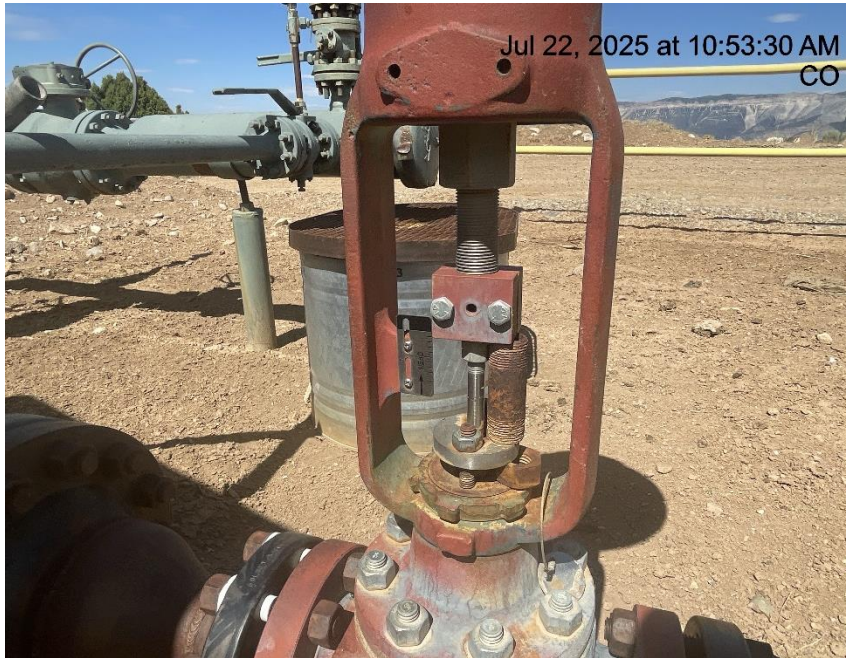
Photo # 3546 Pneumatic control valve on Summit Midstream pipeline has been modified/valve no longer has the ability to close