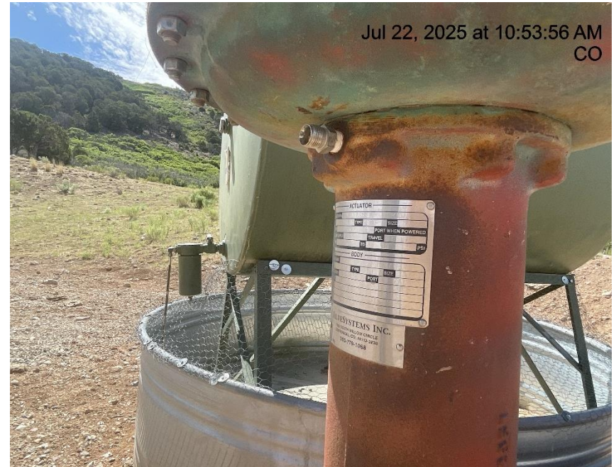
Photo # 3547 Supply gas line for Summit Midstream control valve disconnected/valve no longer operable