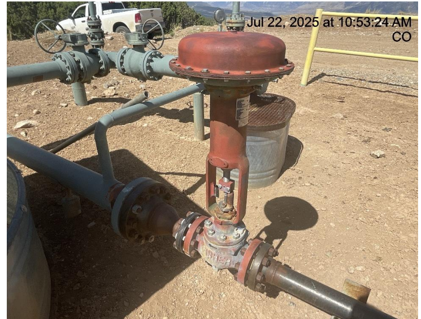
Photo # 3544 Pneumatic control valve on Summit Midstream pipeline has been modified/valve no longer has the ability to close