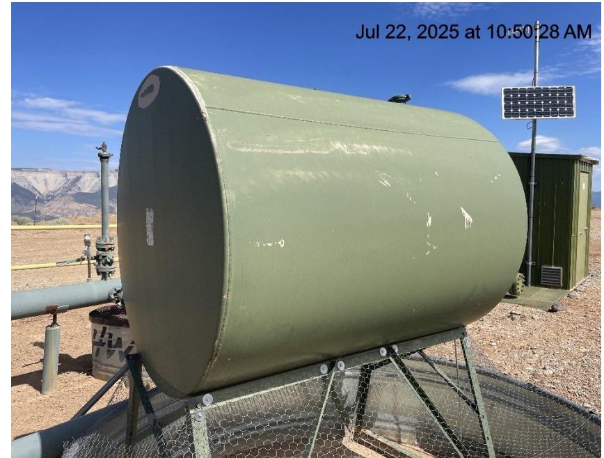
Photo # 3538 Methanol tank improperly labeled/missing some required information