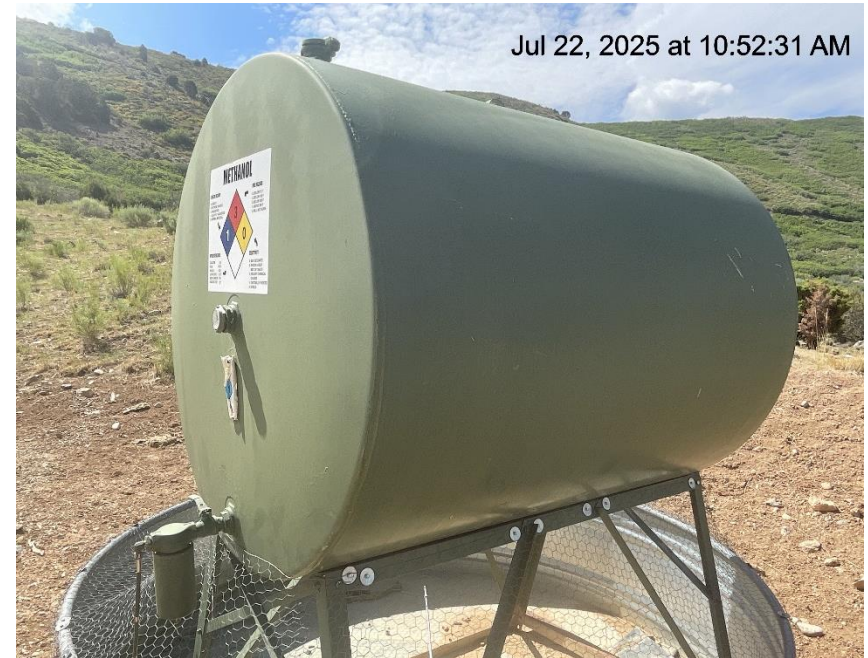
Photo # 3537 Methanol tank improperly labeled/missing some required information