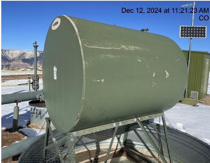
Photo # 3392 From inspection 708905234 conducted on 12/12/2024 Methanol tank improperly labeled/missing some required information