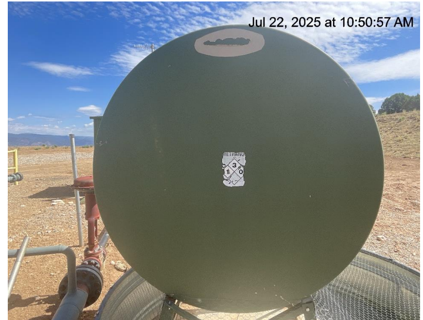
Photo # 3539 Methanol tank improperly labeled/missing some required information