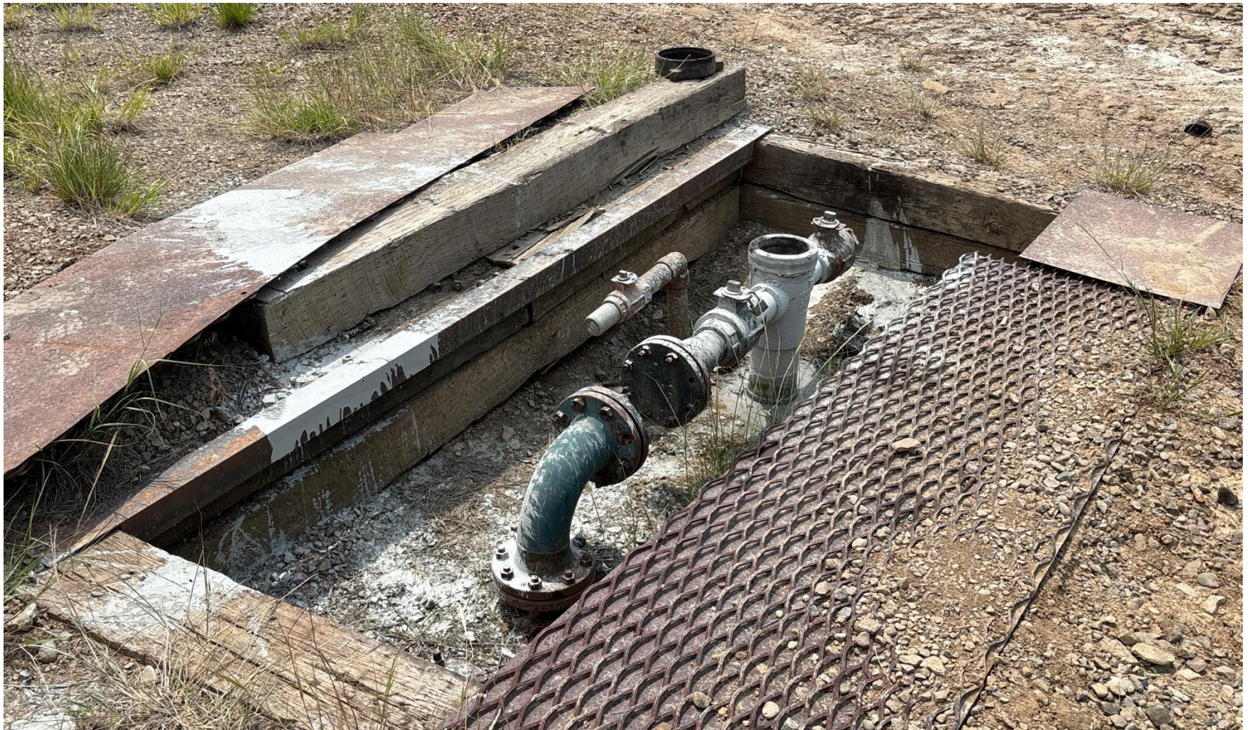
PHOTO 4: NE 36-11 CH WELLHEAD AND EQUIPMENT. (WELL IS PA WAITING ON CUT AND CAP).