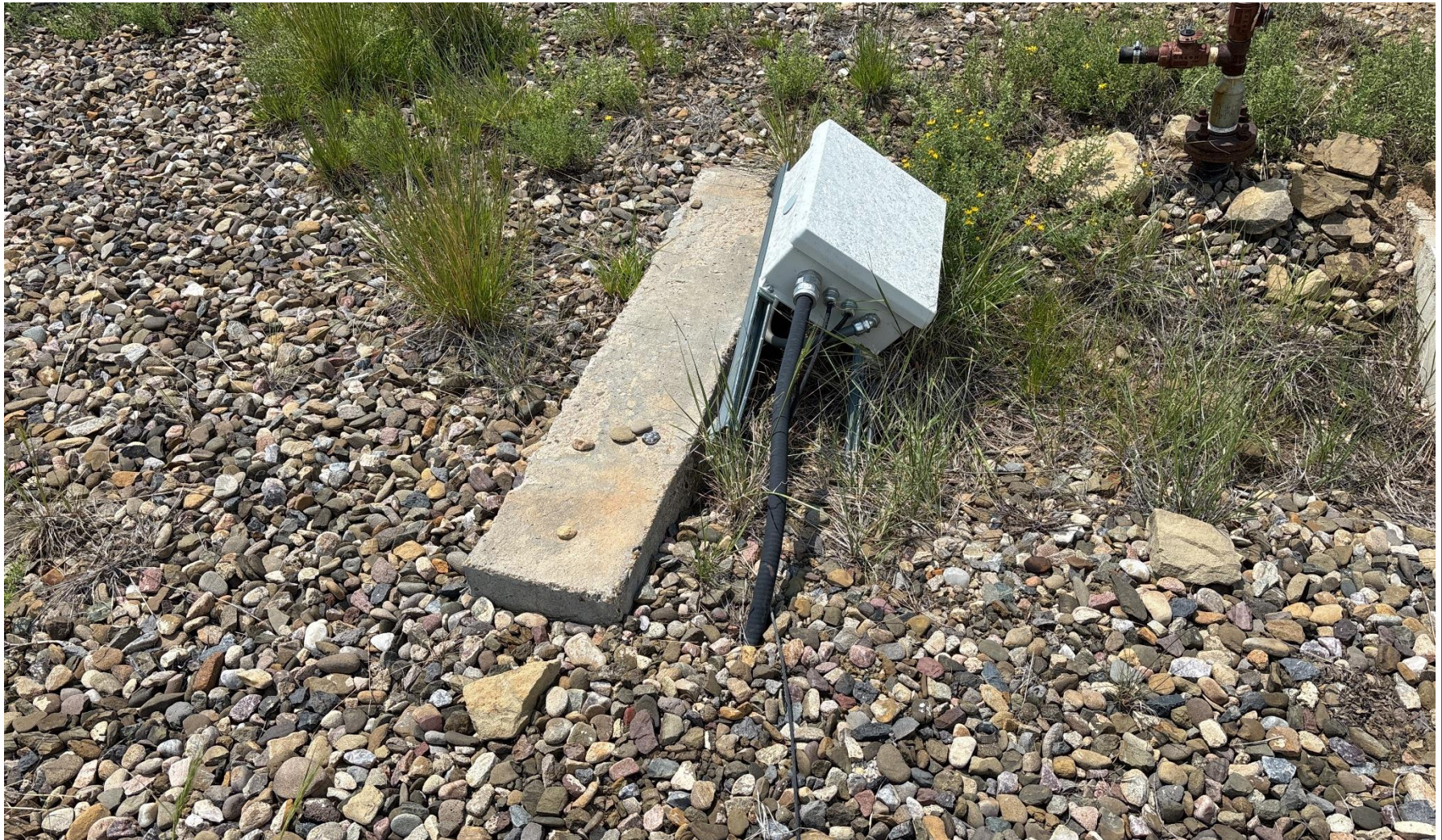
PHOTO 5: UNUSED TELEMETRY EQUIPMENT LYING ON GROUND NEAR WELLHEAD. IF EQUIPMENT IS UNUSED OR USEFUL REMOVE IT PER RULE 606.