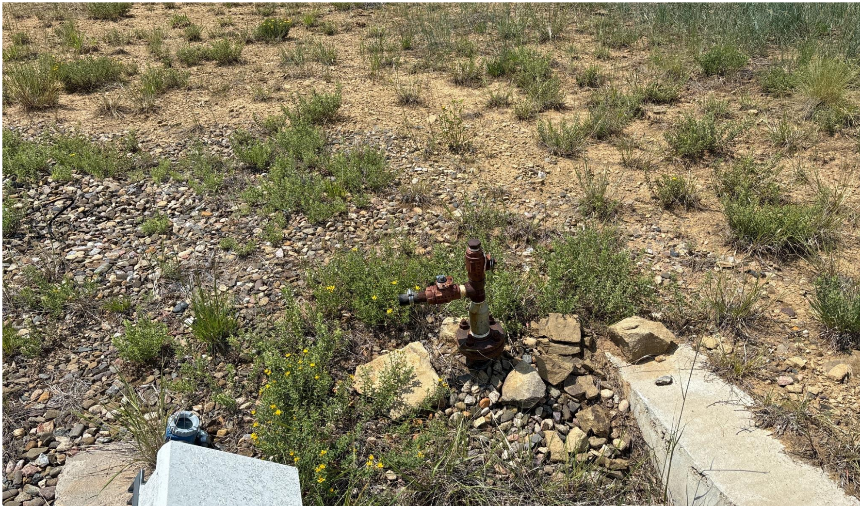
PHOTO 4: UNUSED RISER NOT MARKED. MARK OR REMOVE UNUSED RISER PER RULE 606.