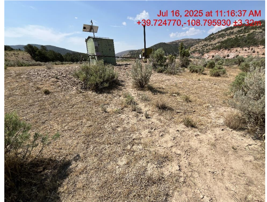
Photo # 0080 Failure to minimize erosion & transport of sediment off location/insufficient BMP's