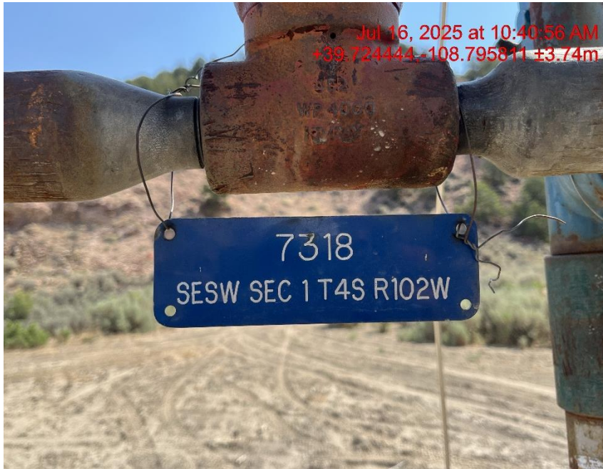
Photo # 0045 Wellhead sign lacks required information/not in compliance with CECMC rules