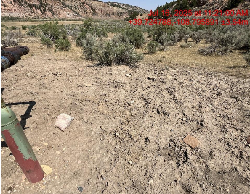
Photo # 0084 Failure to minimize erosion & transport of sediment off location/insufficient BMP's