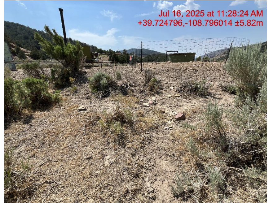
Photo # 0093 Failure to minimize erosion & transport of sediment off location/insufficient BMP's