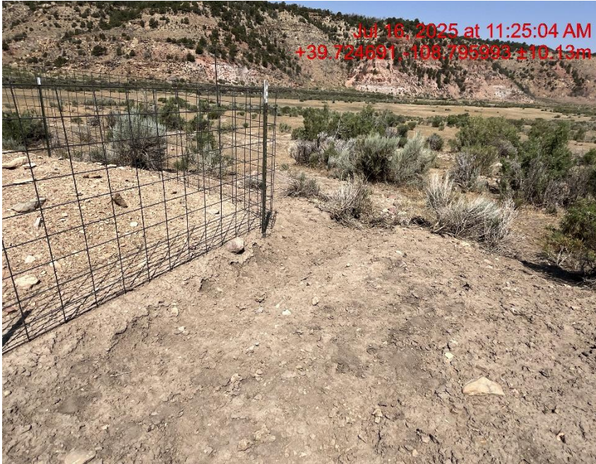
Photo # 0089 Failure to minimize erosion & transport of sediment off location/insufficient BMP's