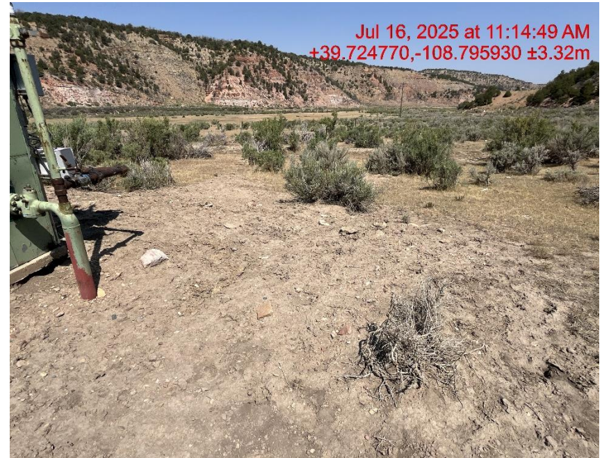
Photo # 0059 Open ended piping/wildlife hazard/available for entry by wildlife