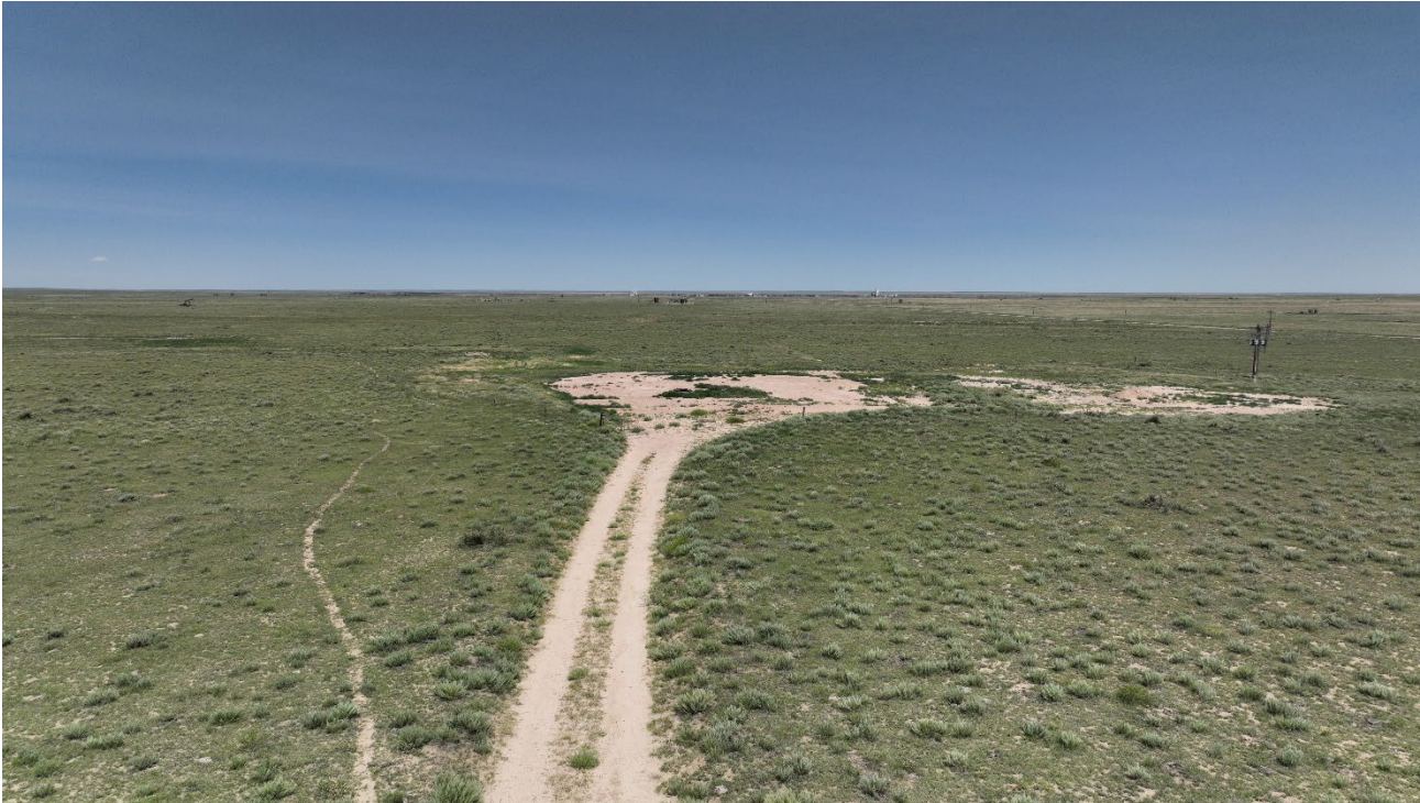
Photo 6. Drone aerial photo facing north toward the access road and location.