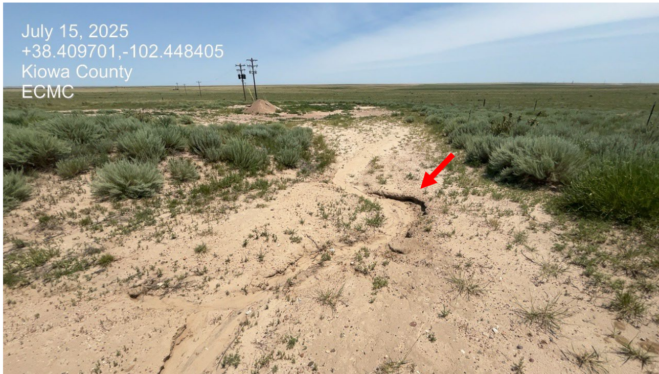
Photo 4. Facing northeast toward the wellsite location. There is erosion in this area beginning to occur.