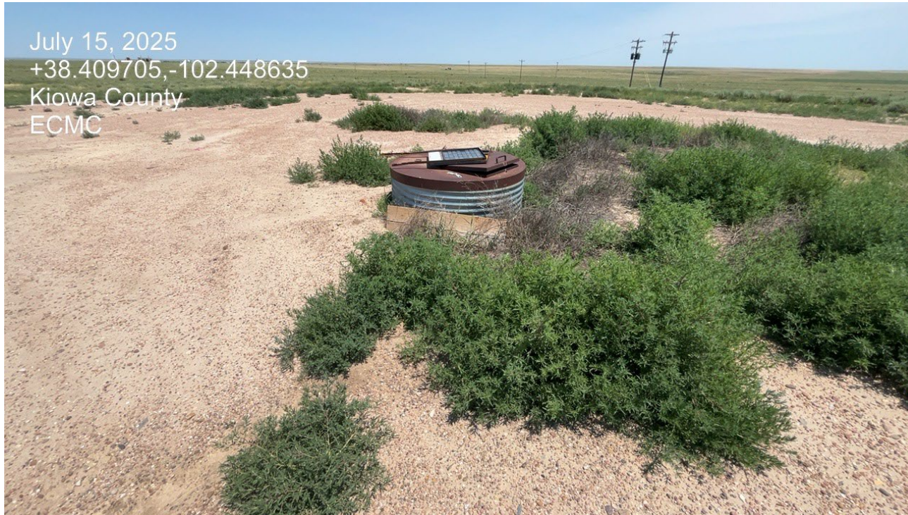
Photo 3. There is a metal flowline culvert that needs to be removed. Flowlines must be abandoned per 1100 rules.