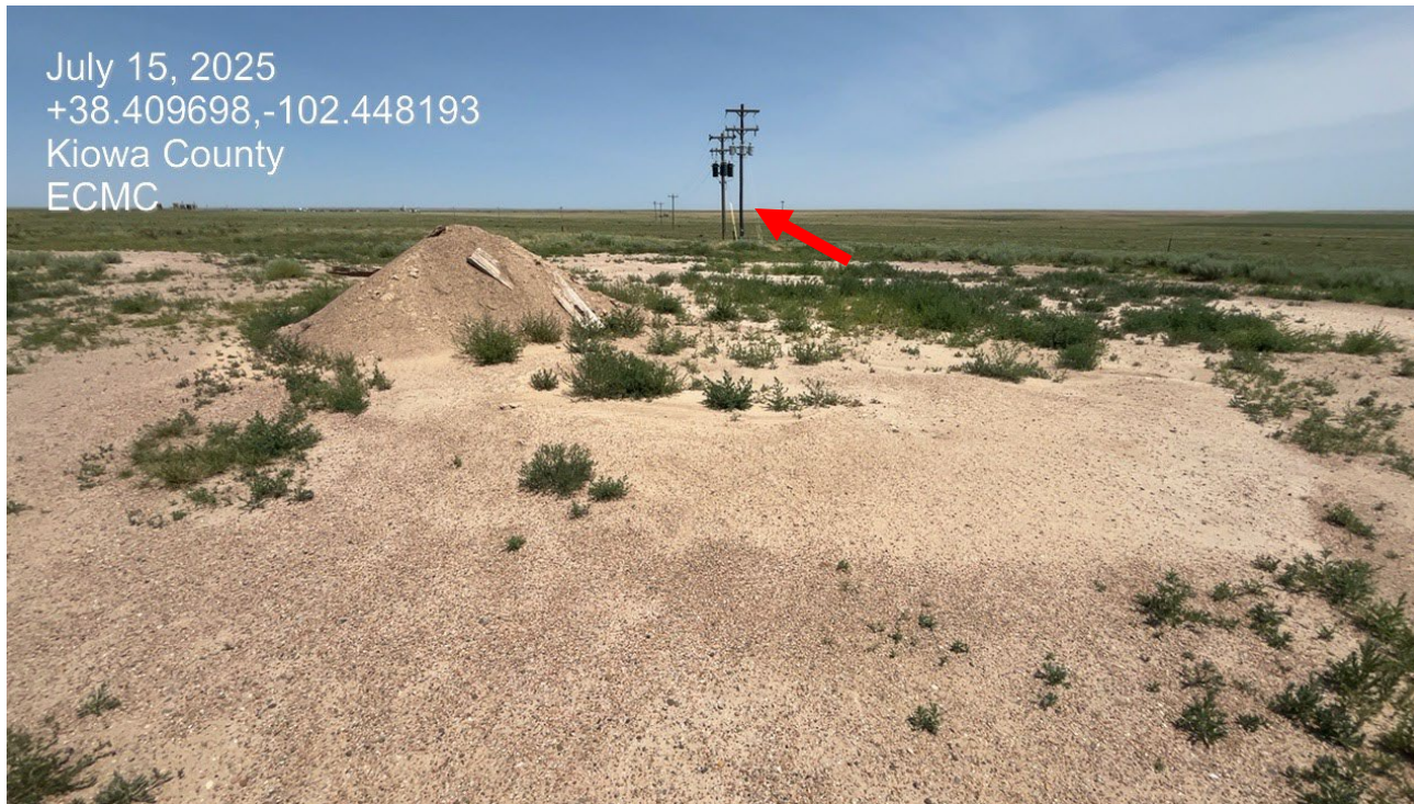
Photo 5. Facing northeast at the abandon wellsite. The pumpjack has been removed. The electric power line still remains at the location.