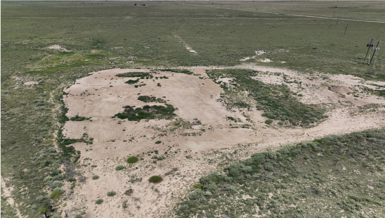
Photo 7. Drone aerial photo overlooking the location disturbance.