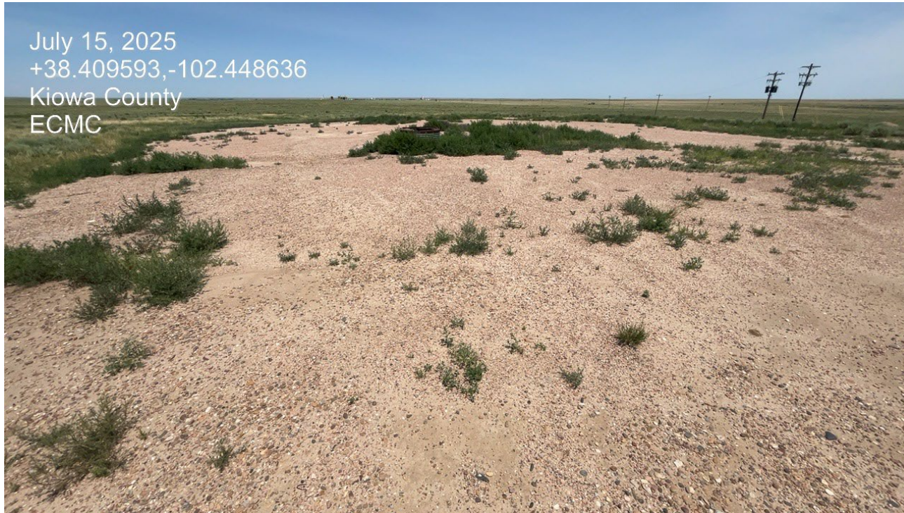
Photo 2. Facing north toward the former tank battery location. Reclamation has not been performed.