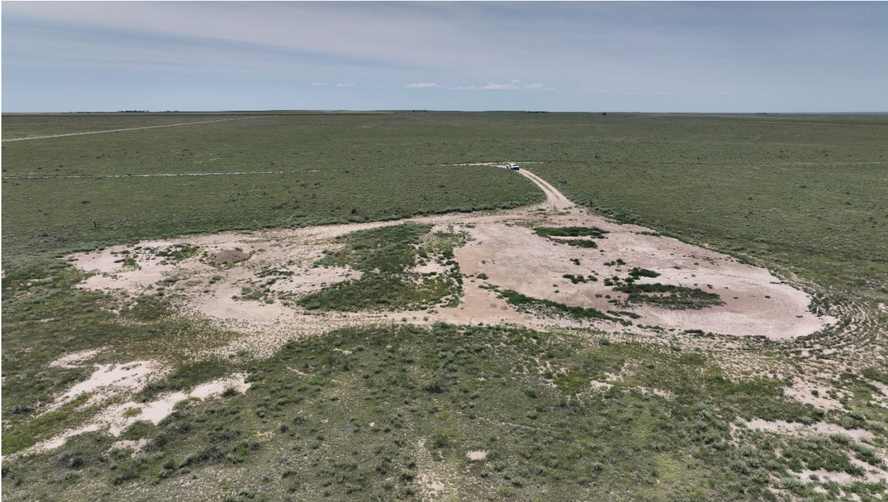
Photo 9. Drone aerial photo facing south.