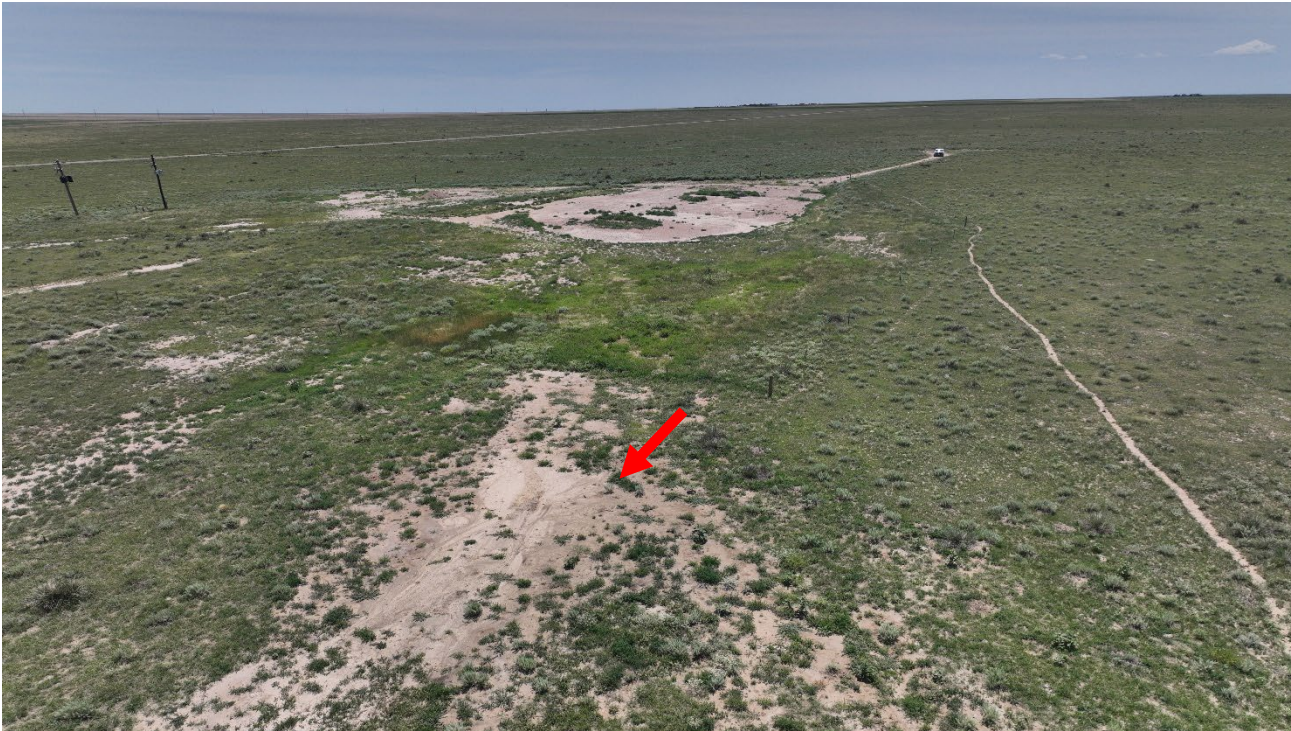
Photo 10. Drone aerial photo facing southeast. There is impacted soils shown at red arrow from historical spill.