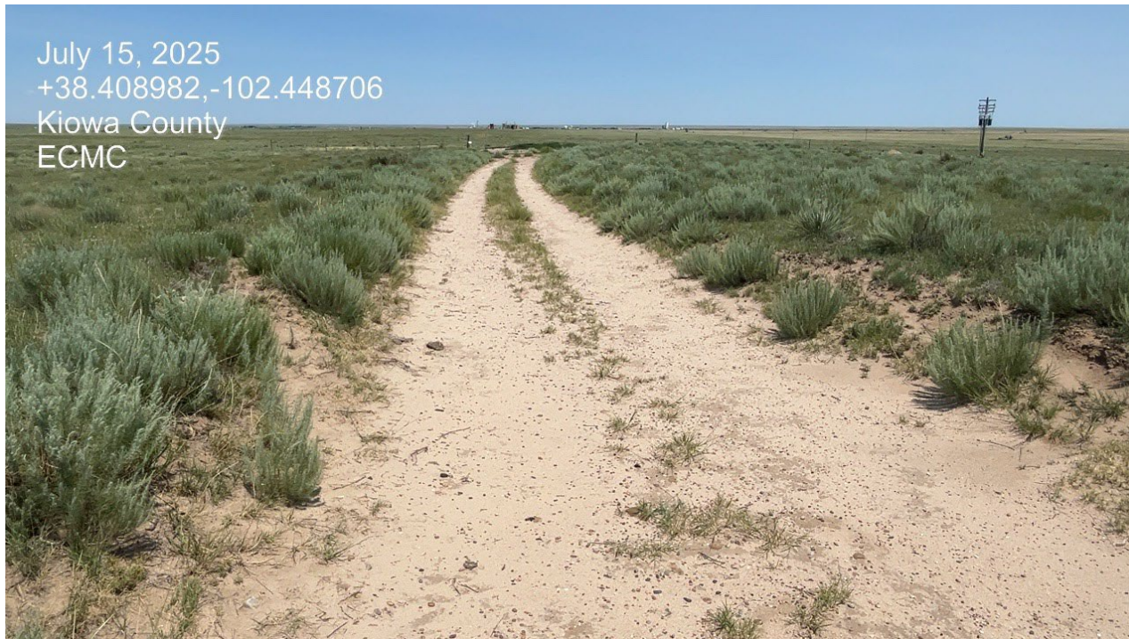
Photo 1. Facing north toward the access road which will need to be recontoured and reclaimed.