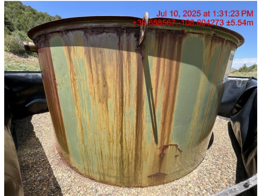
Photo # 9549 Suspected leaks on production tank/tank appears to lack integrity