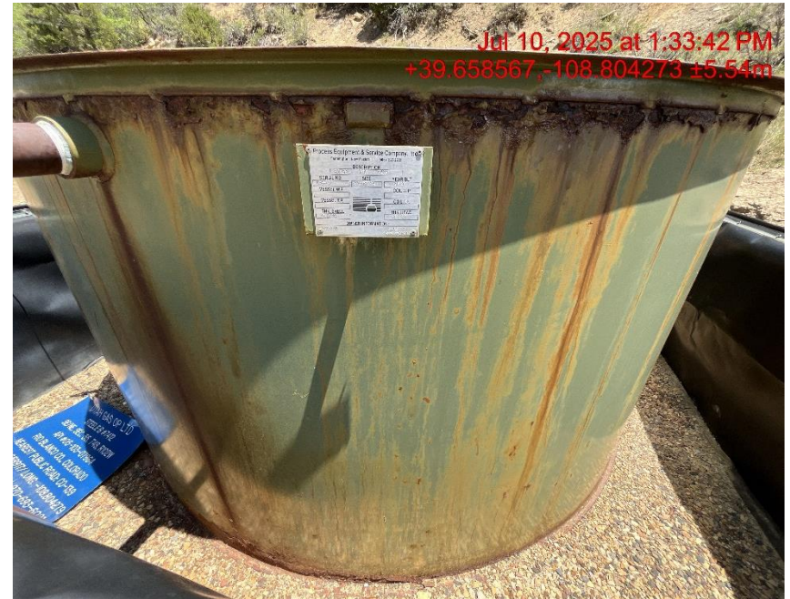
Photo # 9552 Suspected leaks on production tank/tank appears to lack integrity