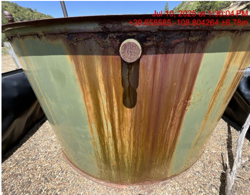
Photo # 9547 Suspected leaks on production tank/tank appears to lack integrity