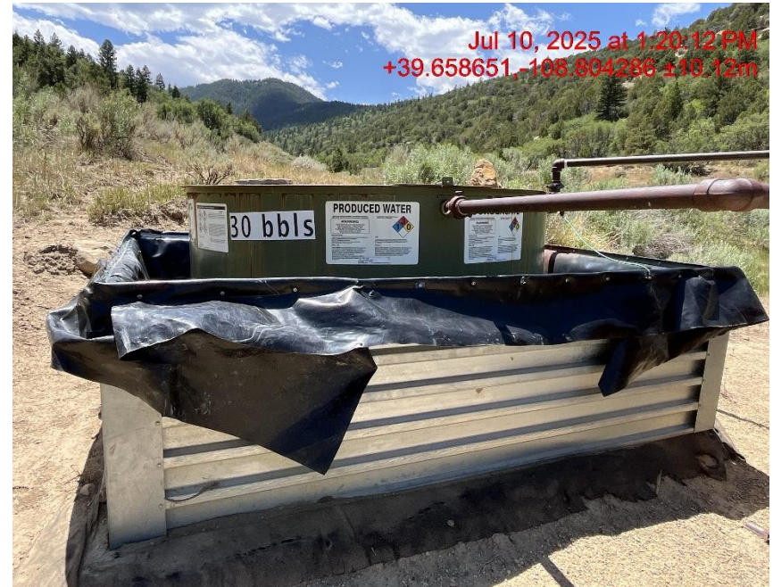
Photo # 9539 No battery signage/not in compliance with CECMC rules