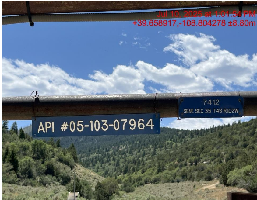
Photo # 9519 Wellhead sign lacks required information/not in compliance with CECMC rules