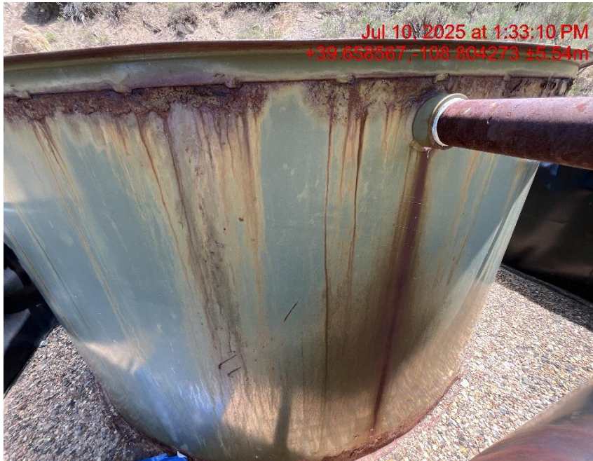
Photo # 9551 Suspected leaks on production tank/tank appears to lack integrity