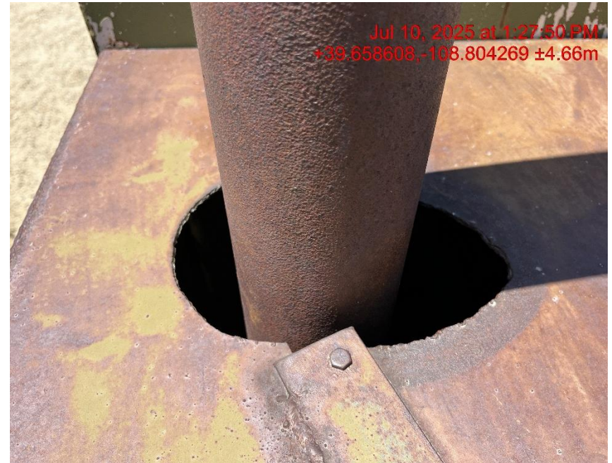
Photo # 9545 Hole in separator building open to wildlife/available for entry by wildlife