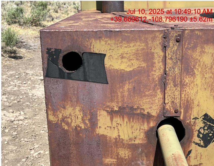
Photo # 9458 Multiple holes in separator building open to wildlife/available for entry by wildlife