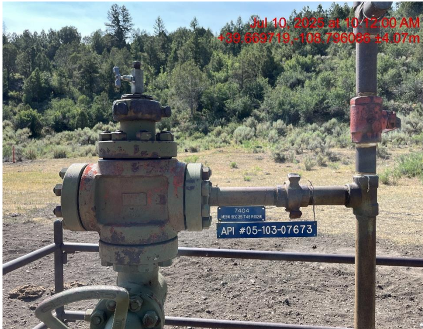
Photo # 9422 Wellhead sign lacks required information/not in compliance with CECMC rules