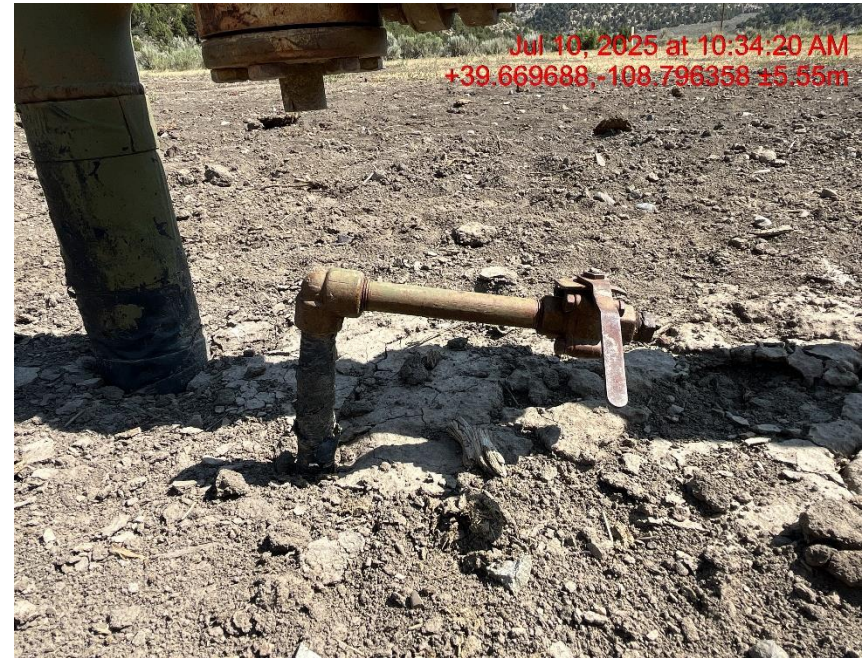
Photo # 9445 Unused flowline does not comply with CECMC 600 & 1100 series rules