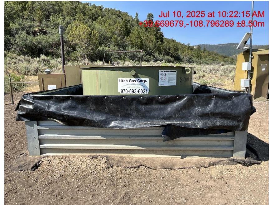
Photo # 9432 No battery signage/not in compliance with CECMC rules