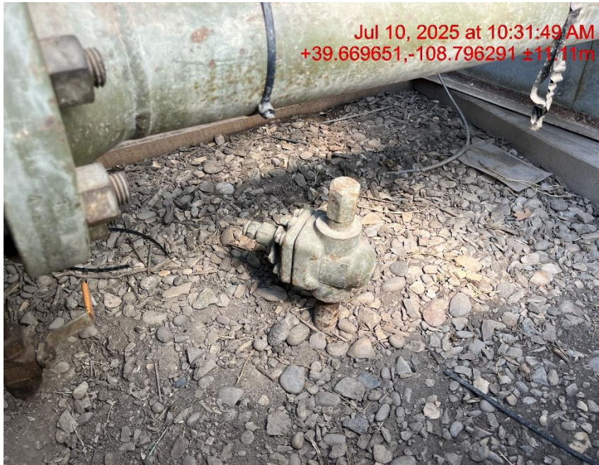
Photo # 9443 Unused flowline does not comply with CECMC 600 & 1100 series rules