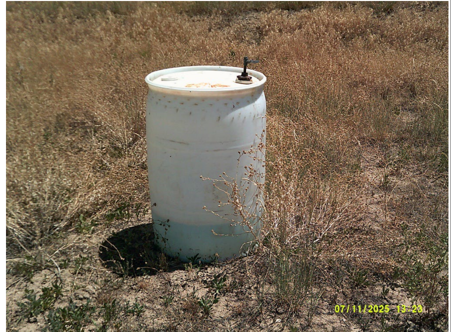
Chemical drum with no labels or secondary containment