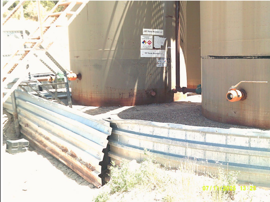
Damaged tank berm

Inspection Date: 7/11/2025 Inspection Doc#: 693808857