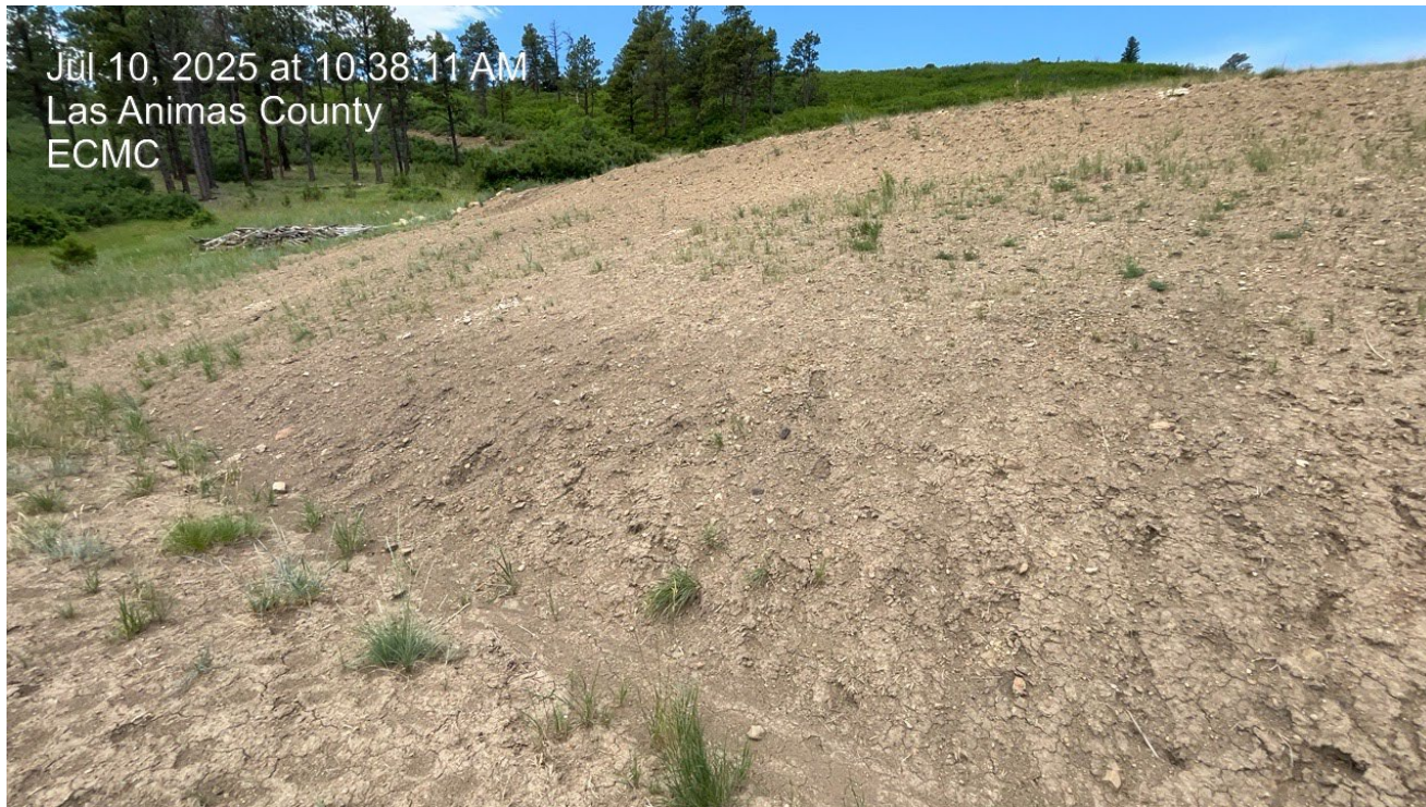
Photo 5. Facing west along the fill slope. This area appears to have been reseeded but has not established vegetation.