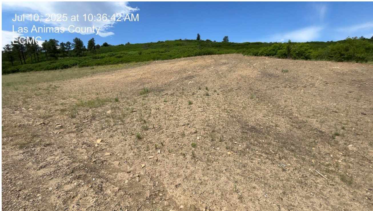
Photo 3. Facing west at the north side of the location. This area appears to have been reseeded but has not established perennial vegetation.