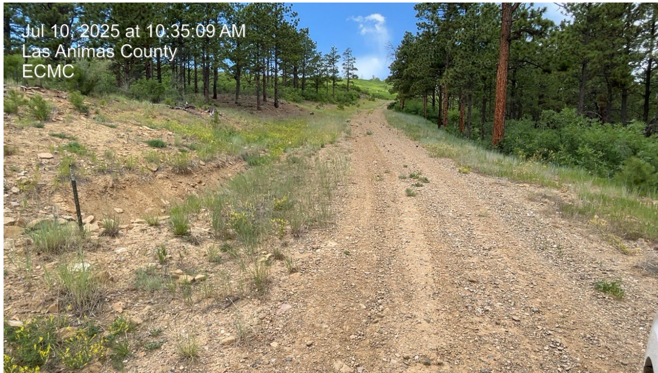
Photo 1. Facing northwest the along the main access road.