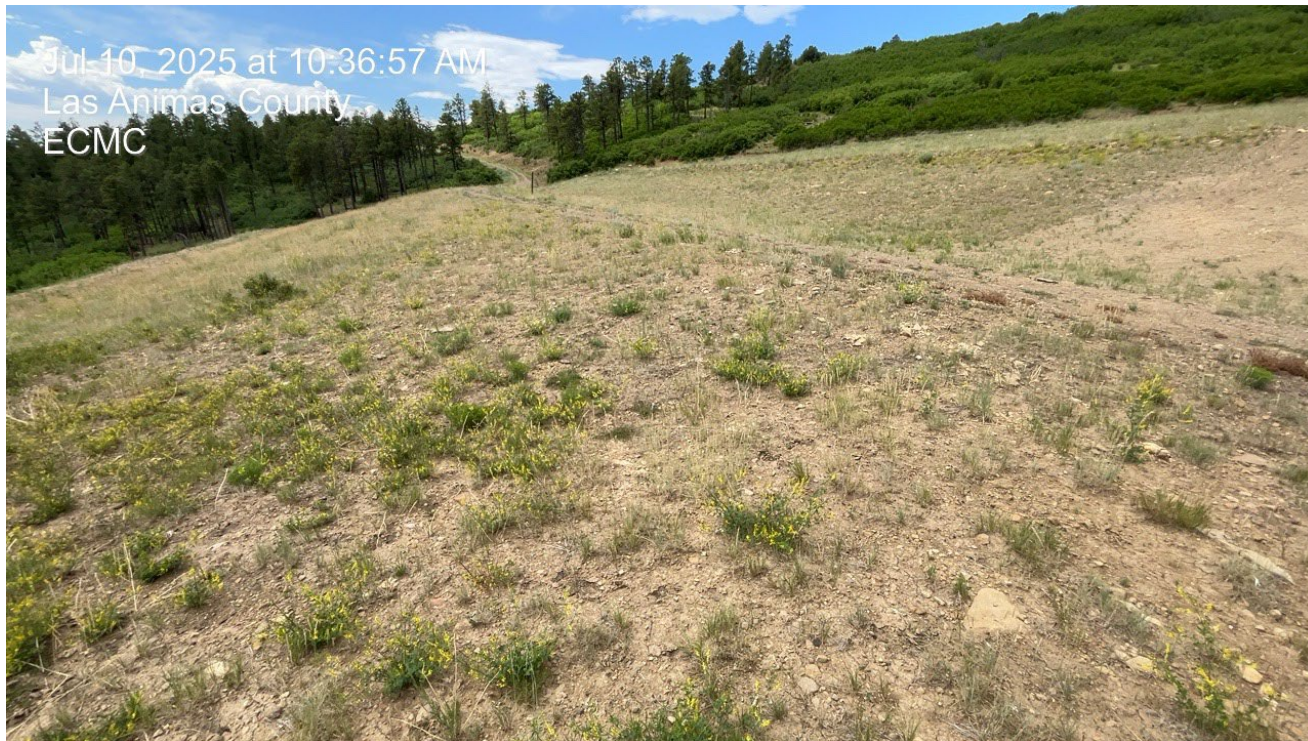
Photo 2. Facing southwest toward the wellsite location.