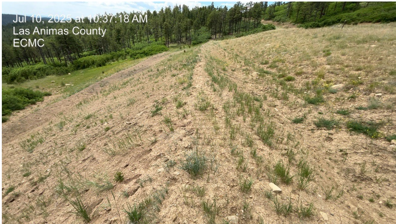
Photo 4. Facing south toward the fill slope. Areas of the fill slope have not adequately established perennial vegetation.