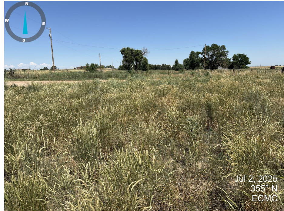
Photo 2. Looking north from the center of the tank battery location. The tank battery location is fenced out of the surrounding area. No oil and gas equipment remains on location. Desirable vegetation has established on the location.