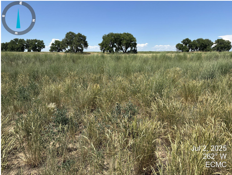
Photo 3. Looking west from the center of the location. See photo 2 comments.