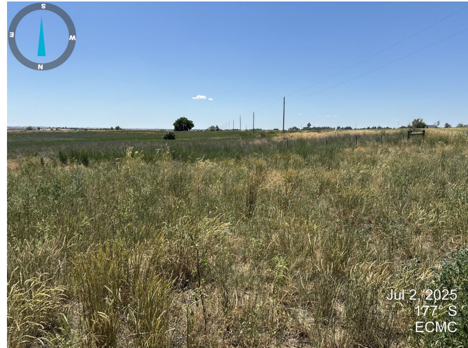
Photo 4. Looking south from the center of the location. See photo 2 comments.