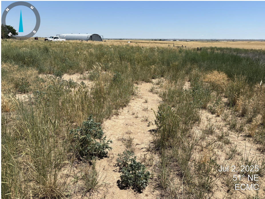
Photo 1. Picture taken near the southern entrance to the former tank battery looking northeast. A patch of bare soil is present with less vegetation than the surrounding area.