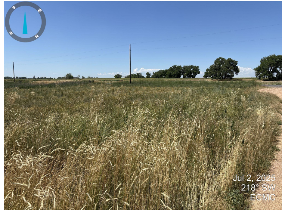
Photo 6. Looking southwest across the location. See photo 2 comments.