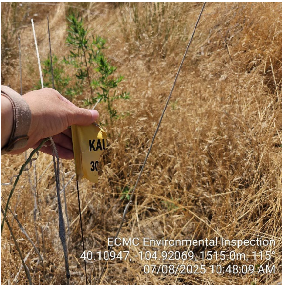
Point Photo 20