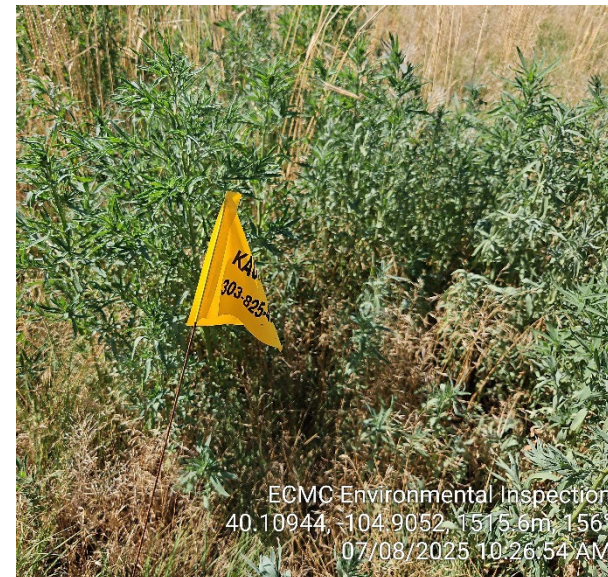
Point Photo 7