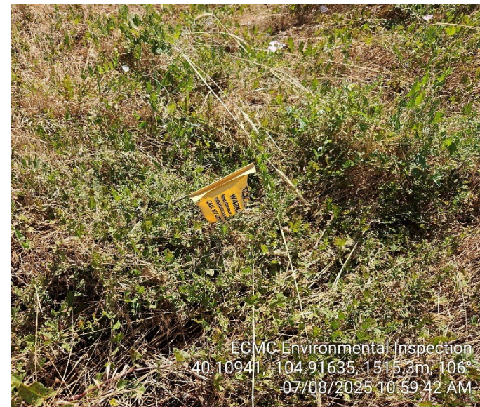
Point Photo 42