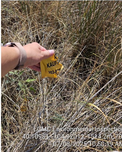
Point Photo 26