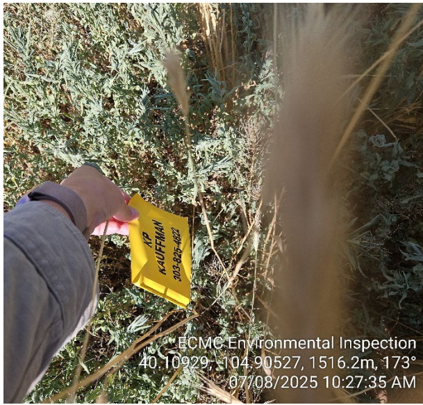
Point Photo 9