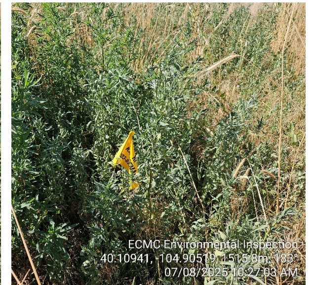
Point Photo 8