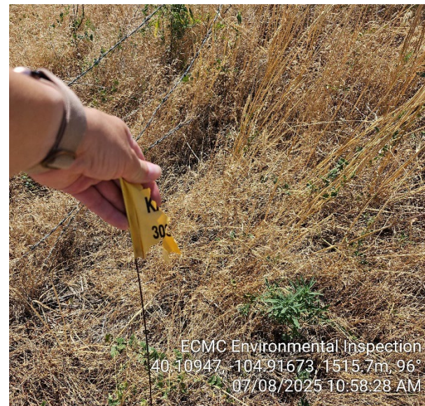
Point Photo 38