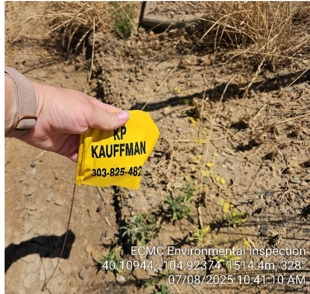
Point Photo 14