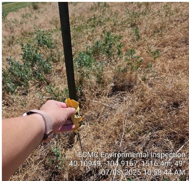
Point Photo 40