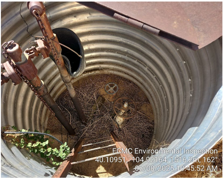
Point Photo 18