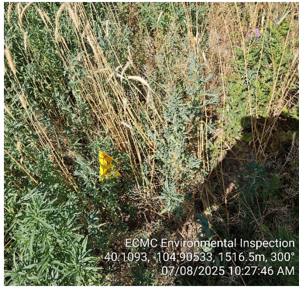
Point Photo 10