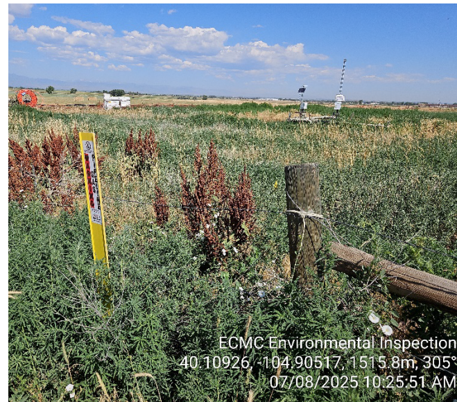
Point Photo 3