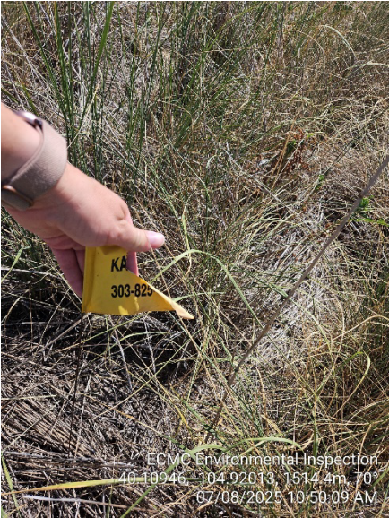
Point Photo 25