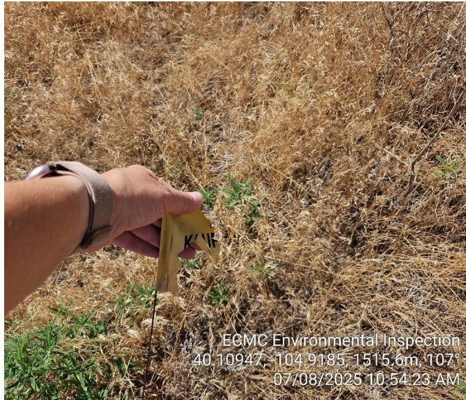
Point Photo 34