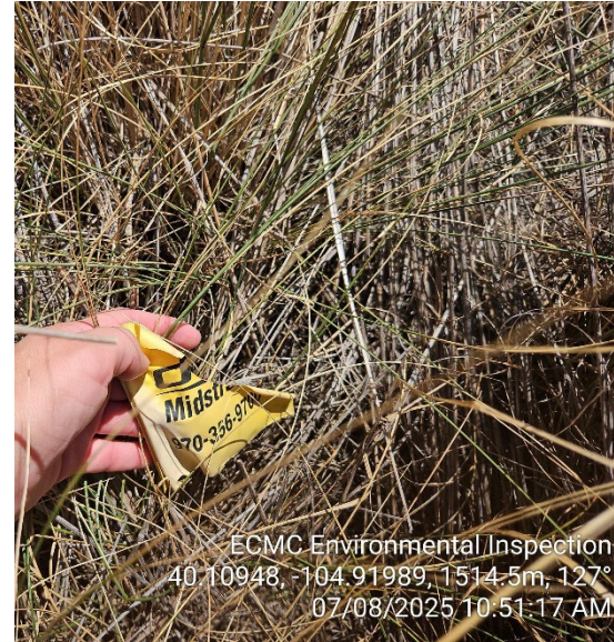
Point Photo 28