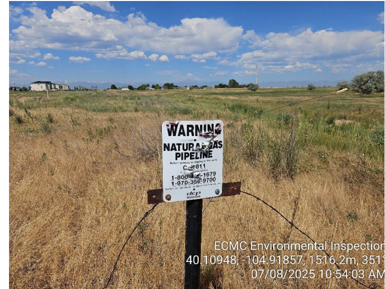
Point Photo 32 & 33