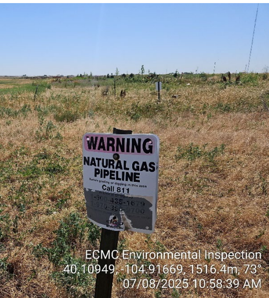
Point Photo 39