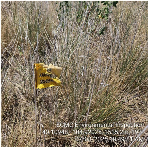
Point Photo 24