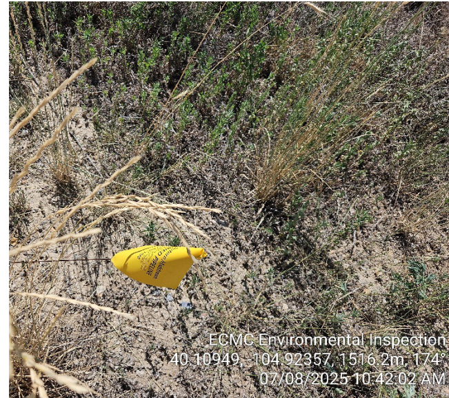
Point Photo 15