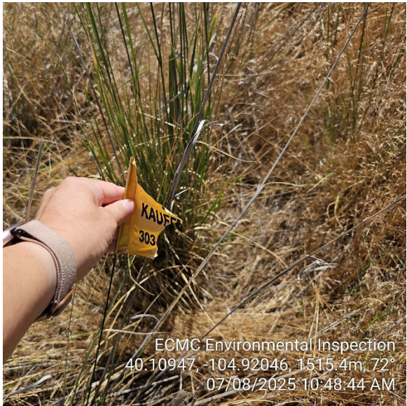
Point Photo 21