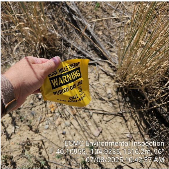
Point Photo 17