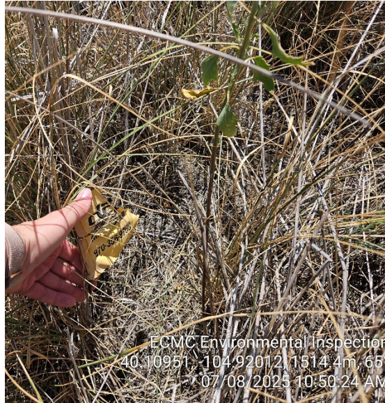
Point Photo 27