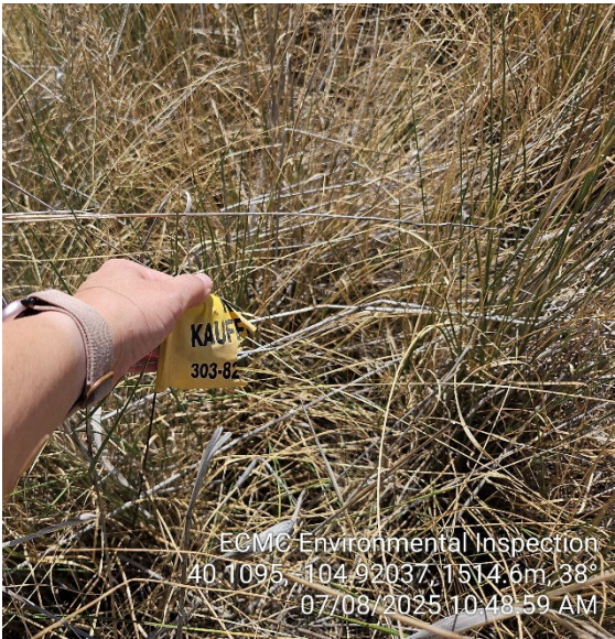
Point Photo 22