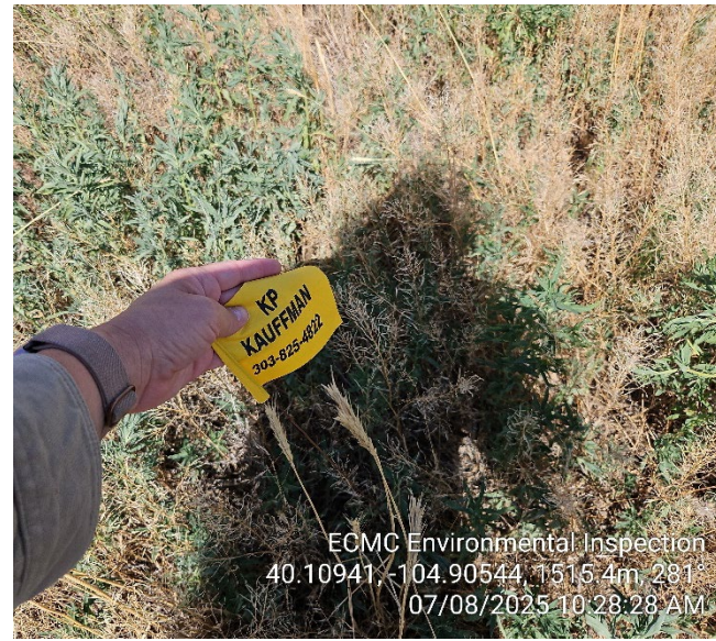
Point Photo 11