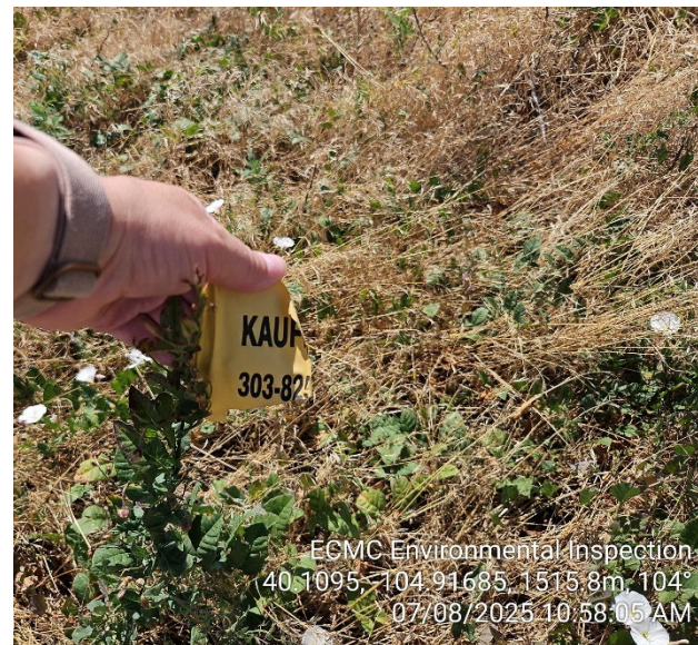
Point Photo 37