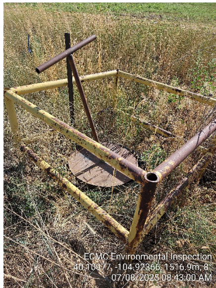
Point Photo 1