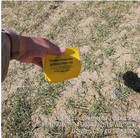
Point Photo 13