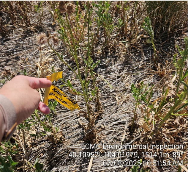
Point Photo 30