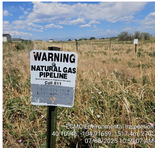
Point Photo 41