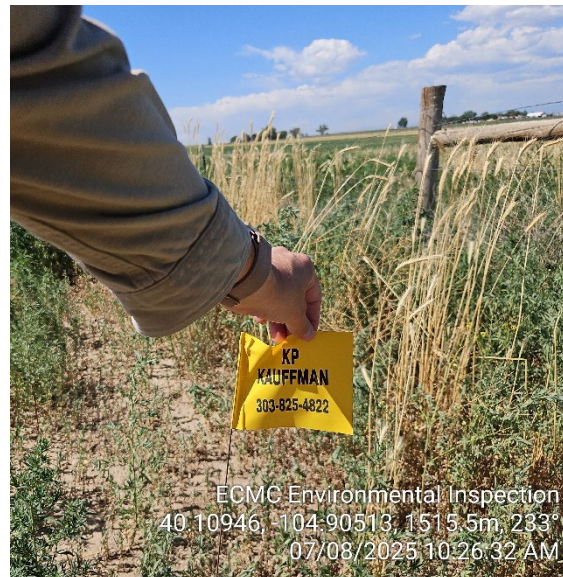
Point Photo 6