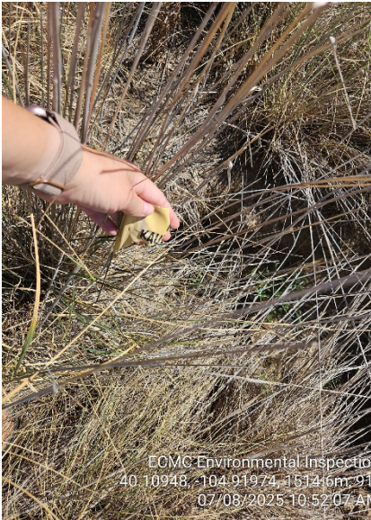
Point Photo 31