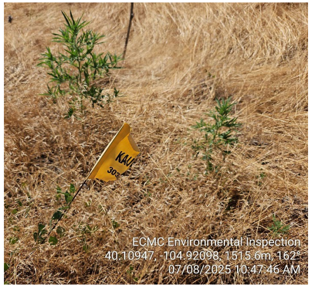
Point Photo 19