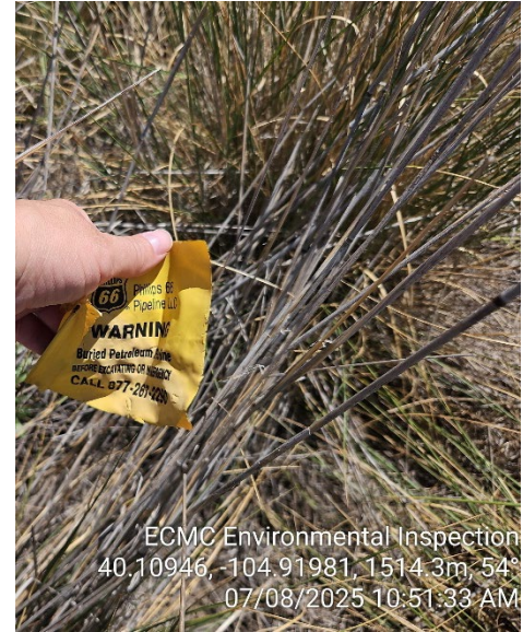
Point Photo 29