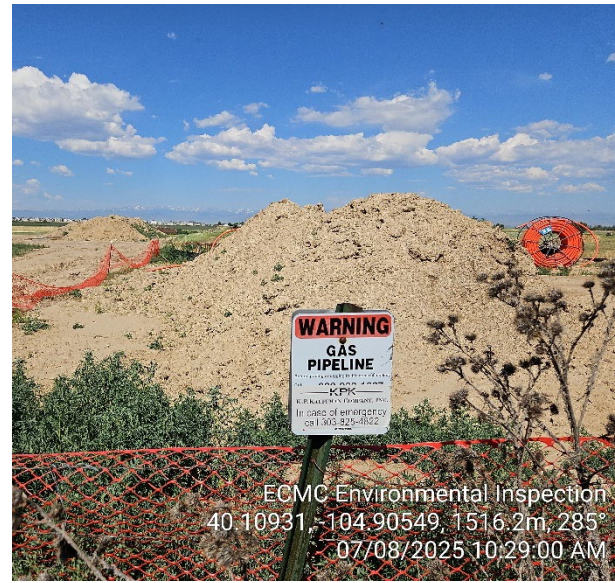
Point Photo 12