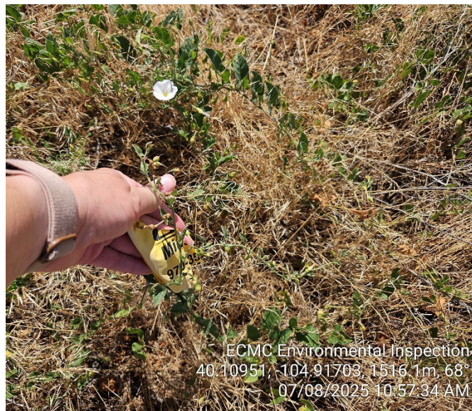
Point Photo 36