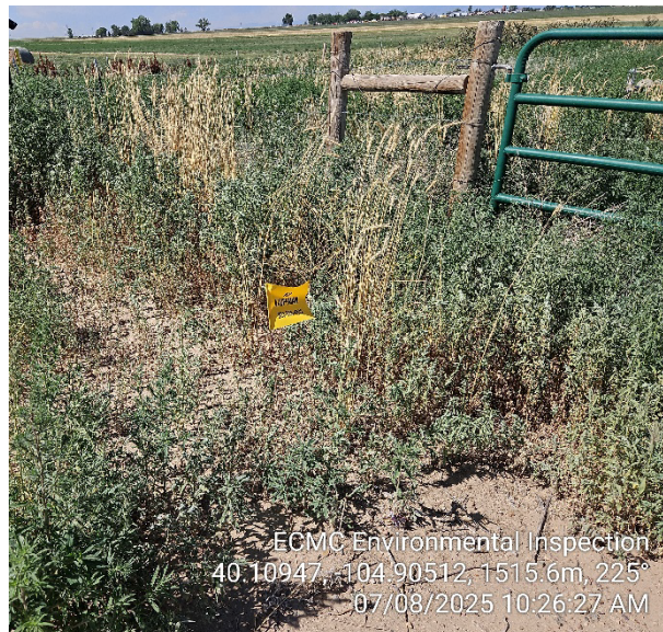
Point Photo 5