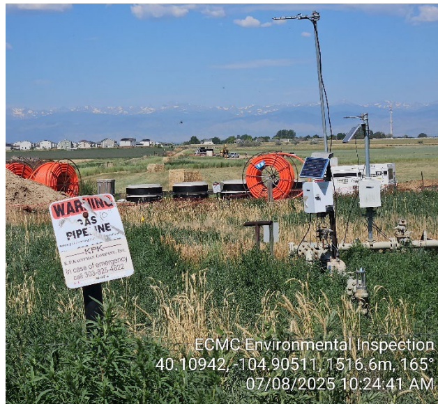
Point Photo 2