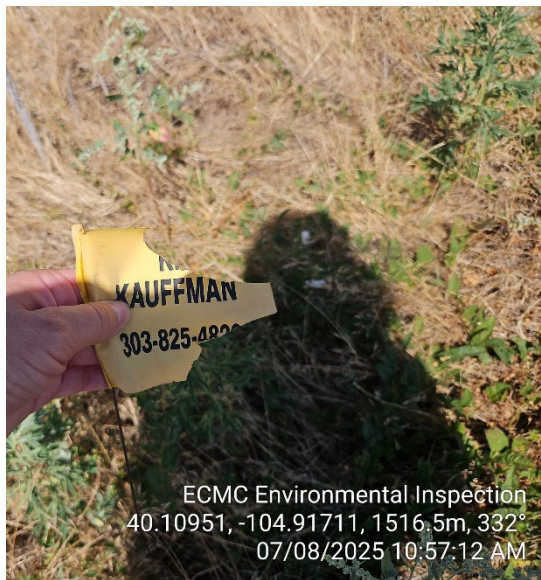
Point Photo 35