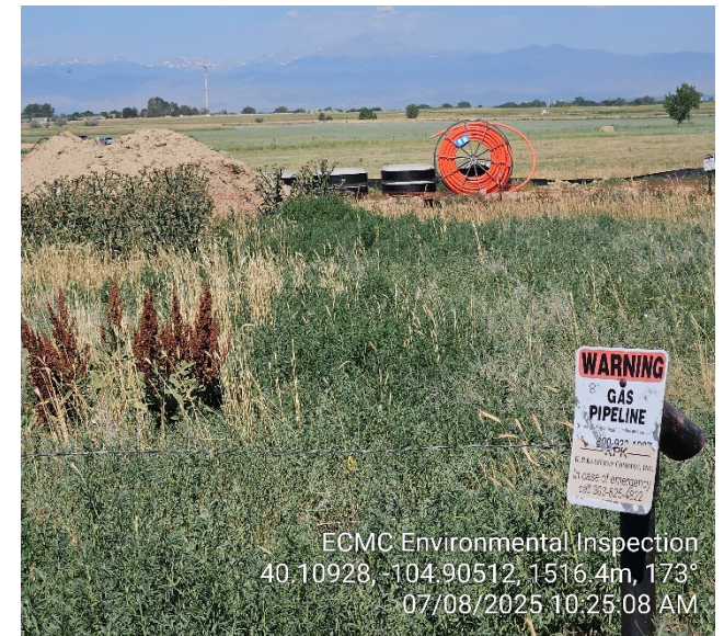
Point Photo 4