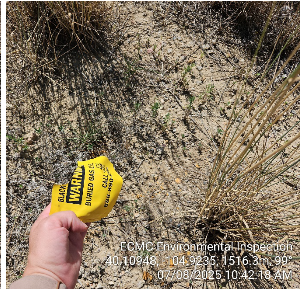
Point Photo 16