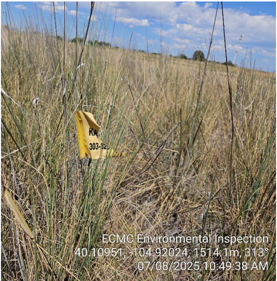
Point Photo 23