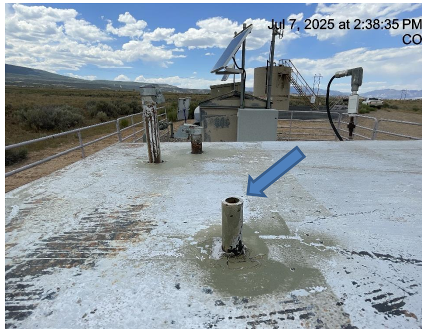
Photo # 9921 PRV vent line on separator does not comply with CECMC pressure safety device rules