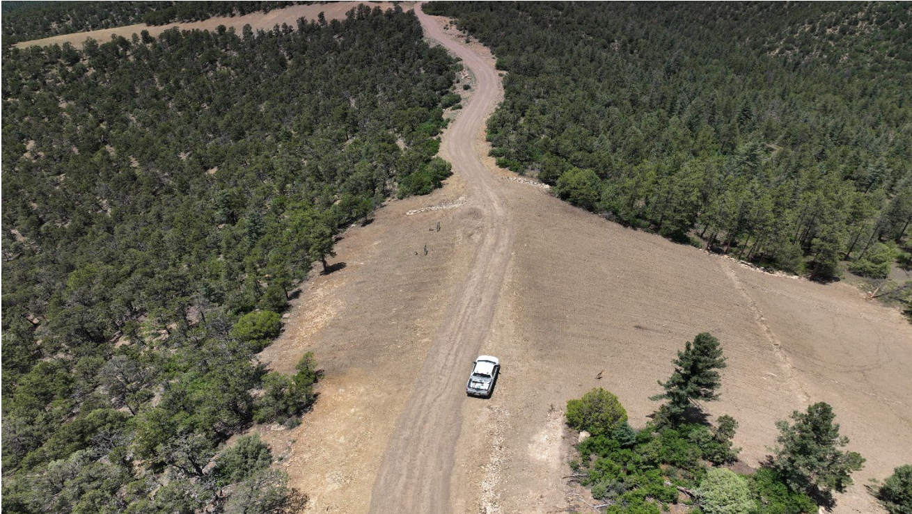
Photo 2. Drone aerial photo facing northwest toward the reclaimed location.