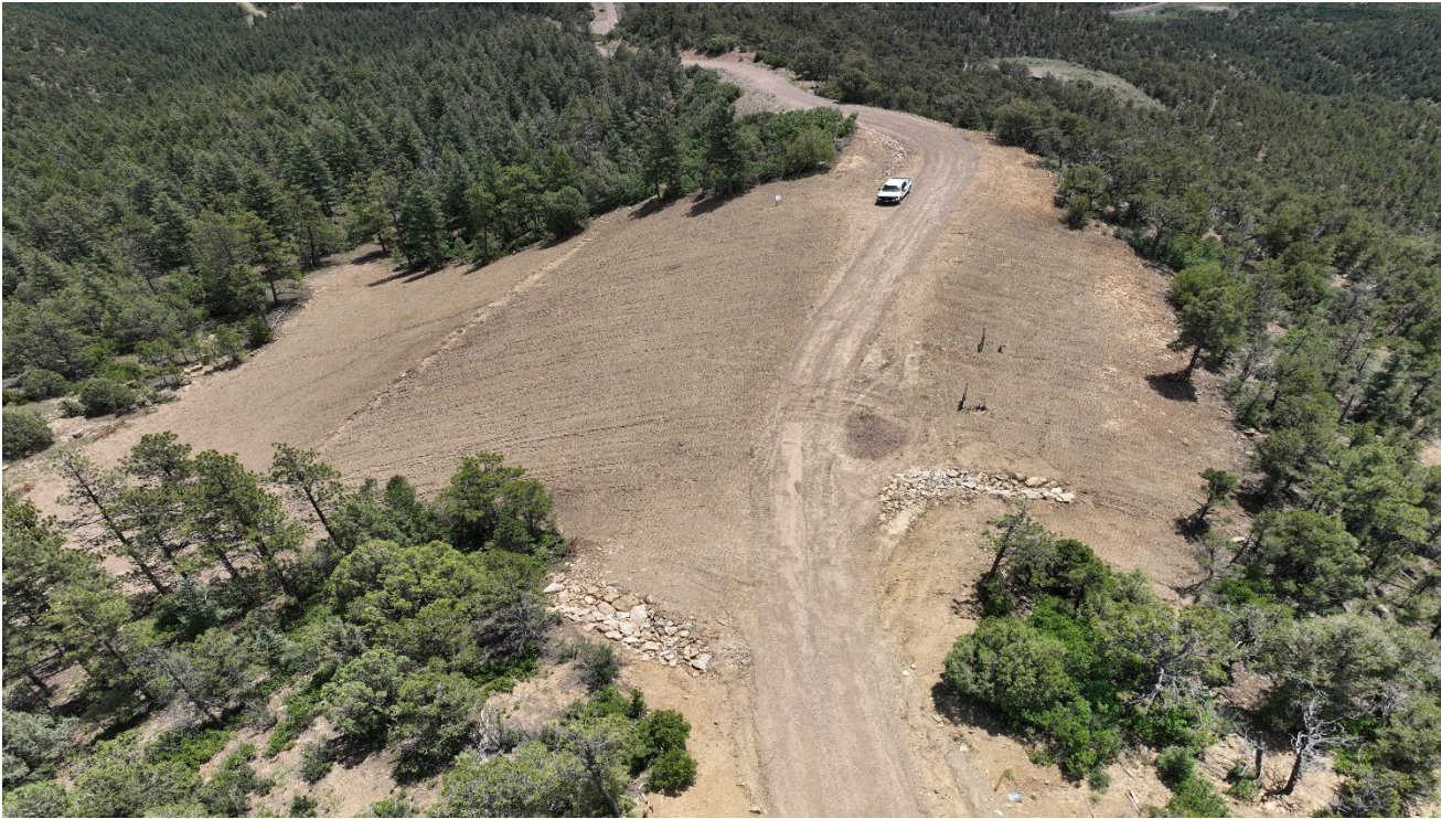
Photo 6. Drone aerial photo facing southeast toward the reclaimed location.