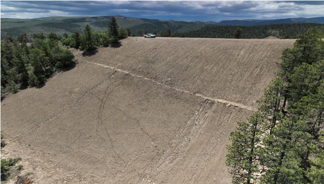
Photo 4. Facing southwest. There is erosion beginning to occur. Additional BMP's such as wattles may be needed on the steep areas of the slope.