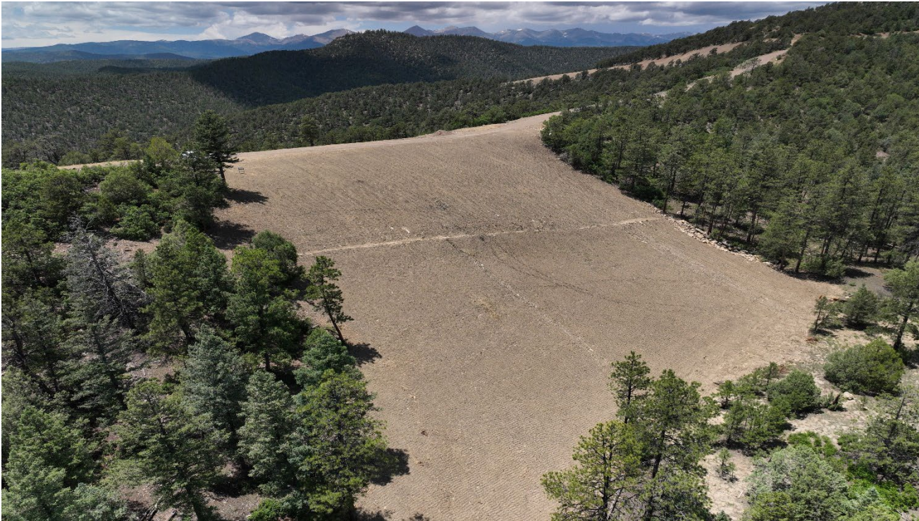
Photo 3. Drone aerial photo facing west toward the location.