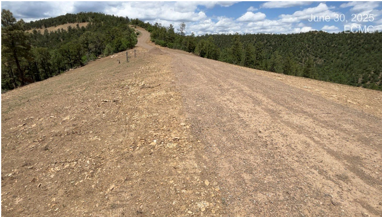
Photo 1. Facing northwest at the location which has been recontoured and reclaimed.