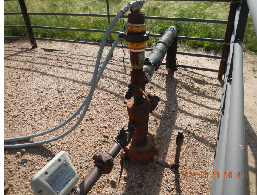
2. View of wellhead.