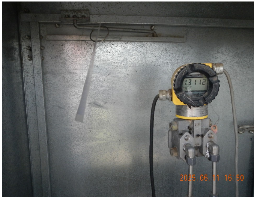
5. Gas Meter inside Meter Box.