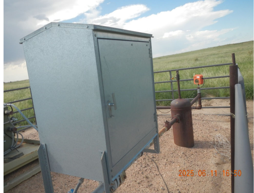
4. View of Flowline Meter Box and Dehydrator.