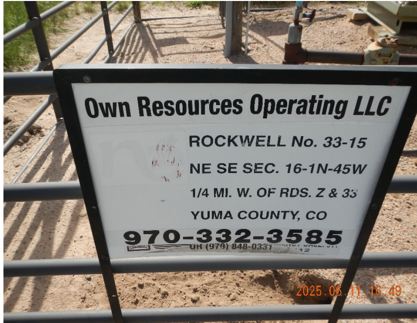
1. Lease sign at well location.