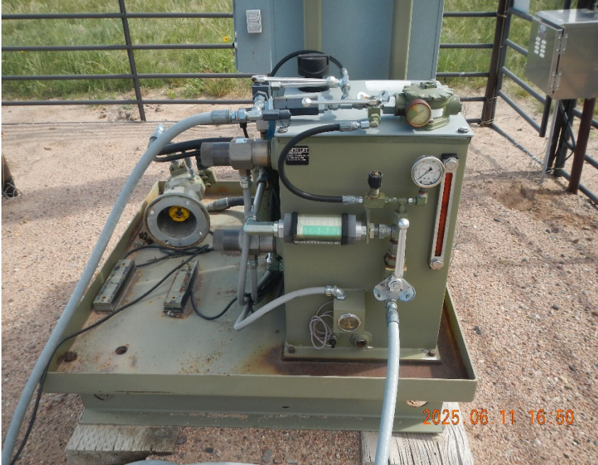
3. View of Smith Lift surface equipment.