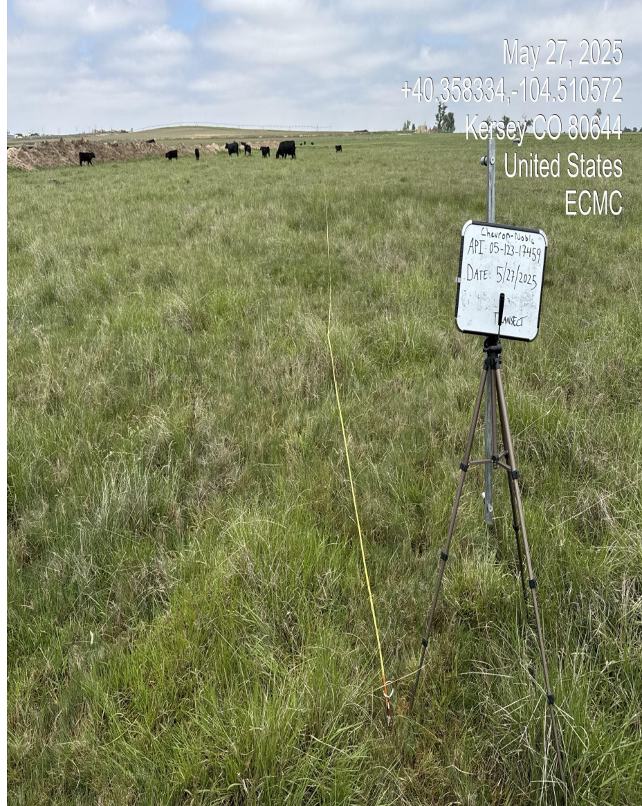
Photo 2. Disturbed and Reference area transects conducted on location.