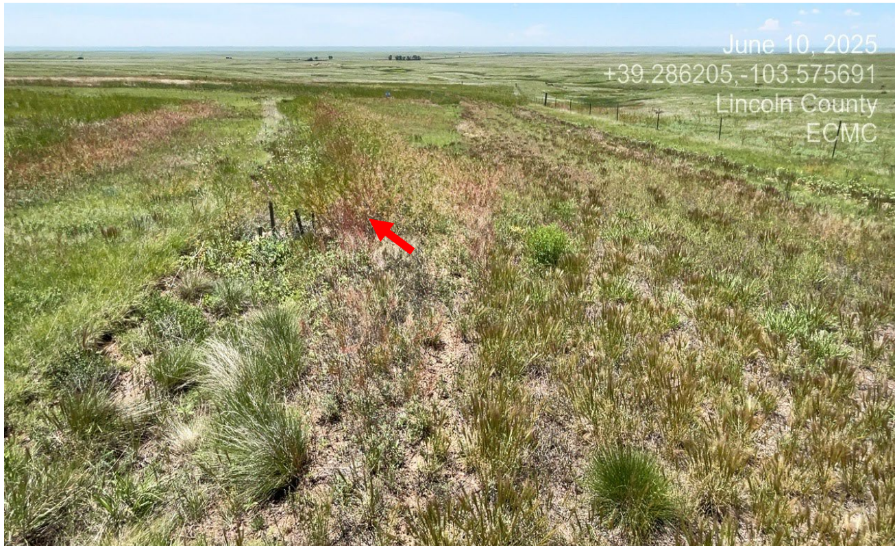
Photo 2. Facing south along the road. There is a diversion ditch shown at red arrow that needs to be filled in and reclaimed.