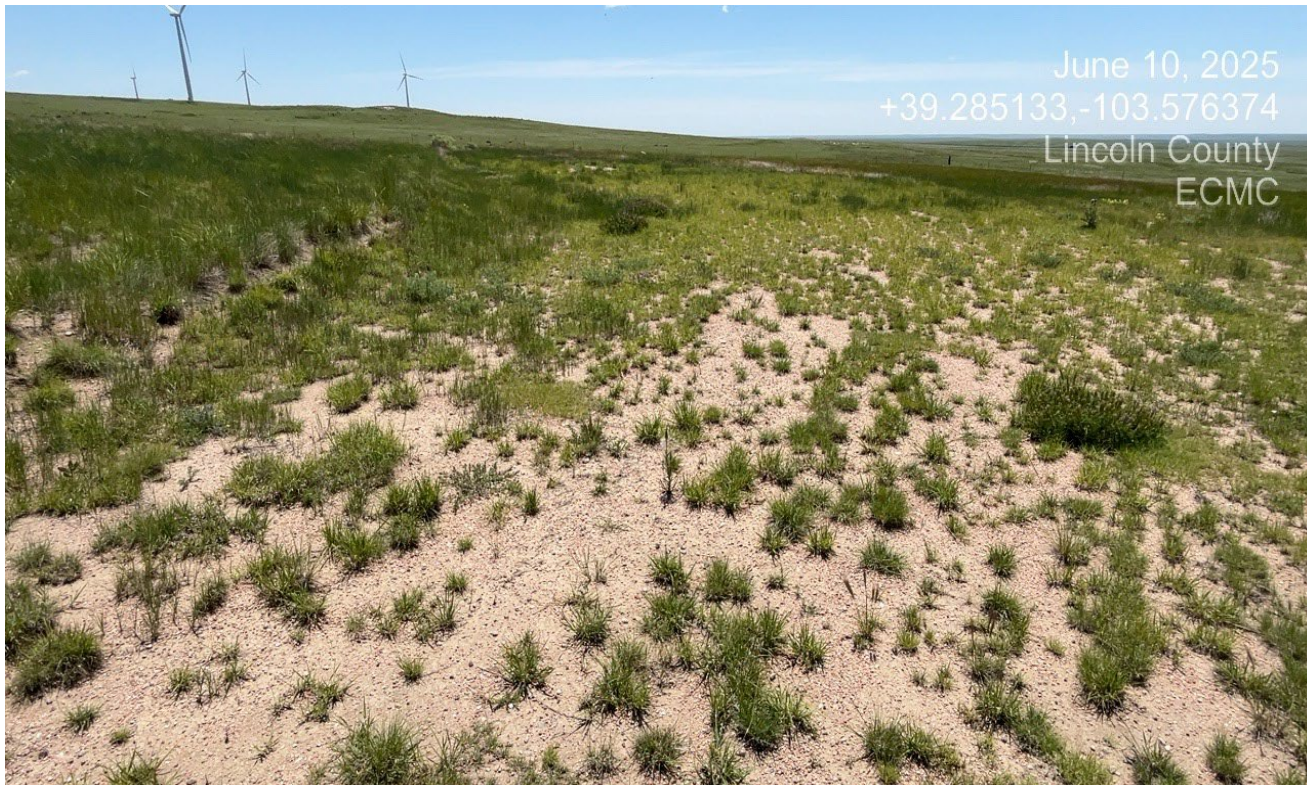
Photo 4. Facing southeast at the location. The location has not been recontoured and reclaimed.