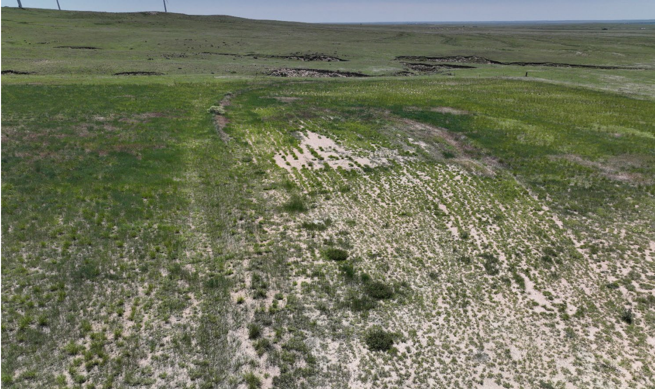
Photo 7. Drone aerial photo facing southeast toward the location.