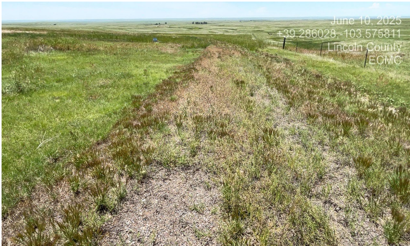
Photo 3. Facing south along the access road. The gravel has not been removed and the road is not reclaimed. There are weeds overgrown on the road (Cheat grass, Kochia).