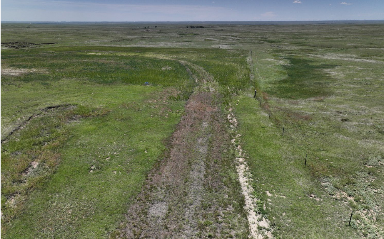
Photo 6. Drone aerial photo facing south down toward the access road.