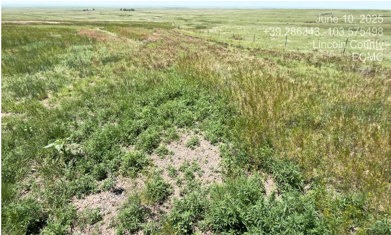
Photo 1. Facing south along the access road. The gravel has not been removed and the road is not reclaimed. There are weeds overgrown on the road (Cheat grass, Kochia).