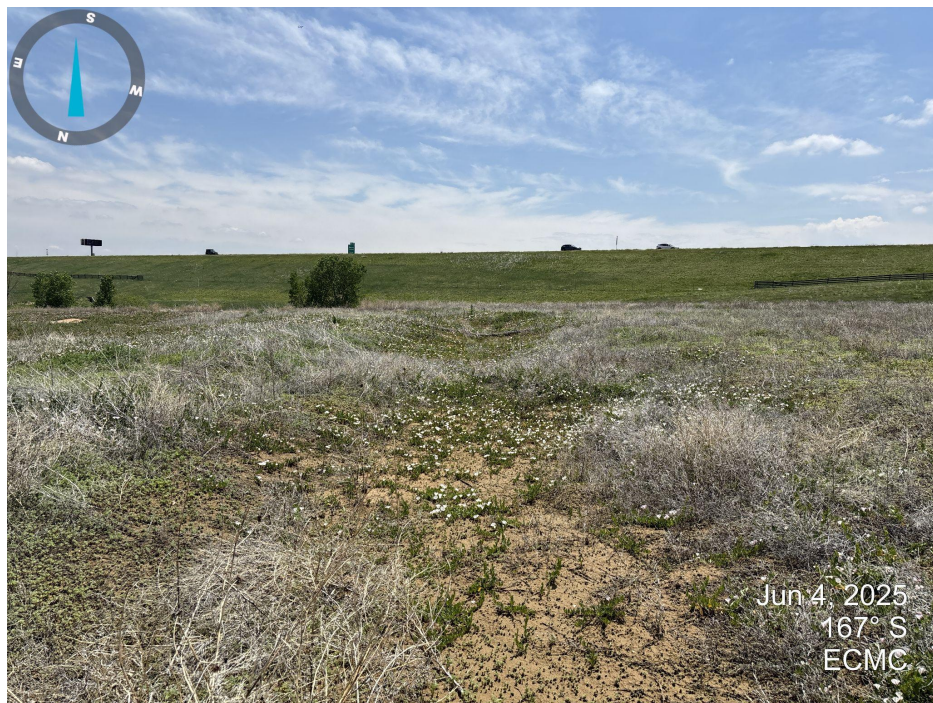
Photo 3. Looking south from the wellbore. See photo 3 comments.