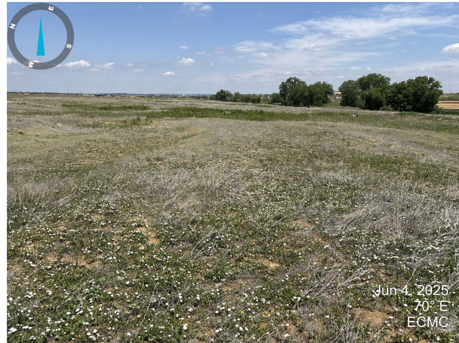
Photo 2. Looking east across the cogis location. GPS coordinates appear to be 50 ft offset from actual location.