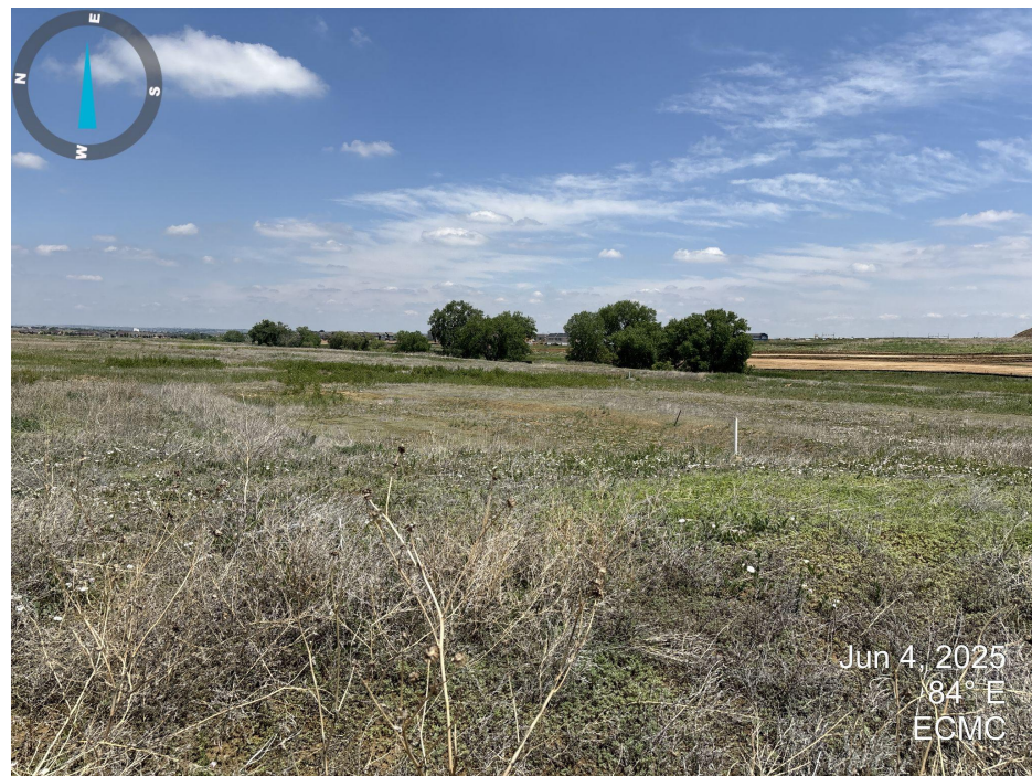
Photo 4. Looking east from the wellbore. See photo 3 comments.