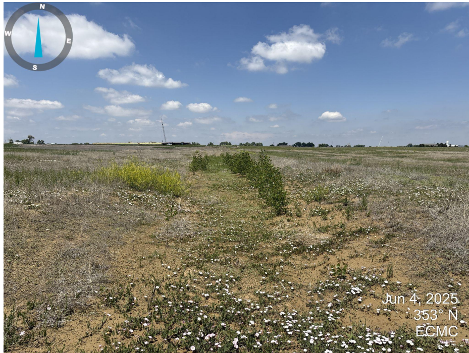
Photo 3. Looking north from wellbore according to imagery. Location appears to be within land use change involving significant earthworks. No oil and gas equipment remains.