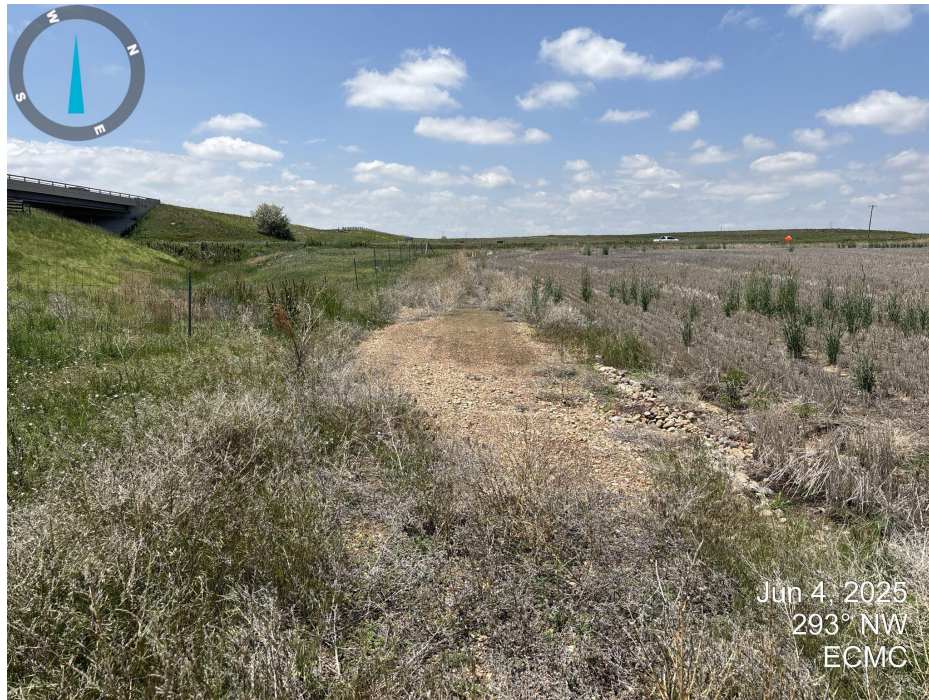
Photo 1. Looking west at the mid point of the access road where it crosses a low point in the field. A portion of the access road remains. Large cobble and gravel are present.