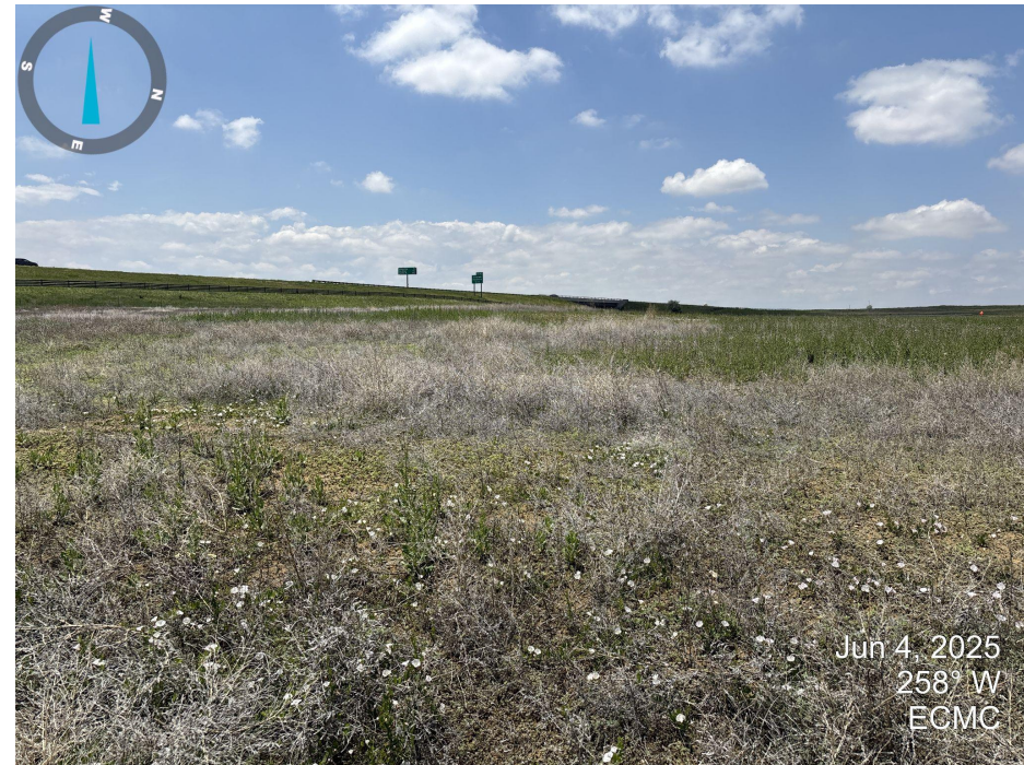
Photo 4. Looking west from the wellbore. See photo 3 comments.