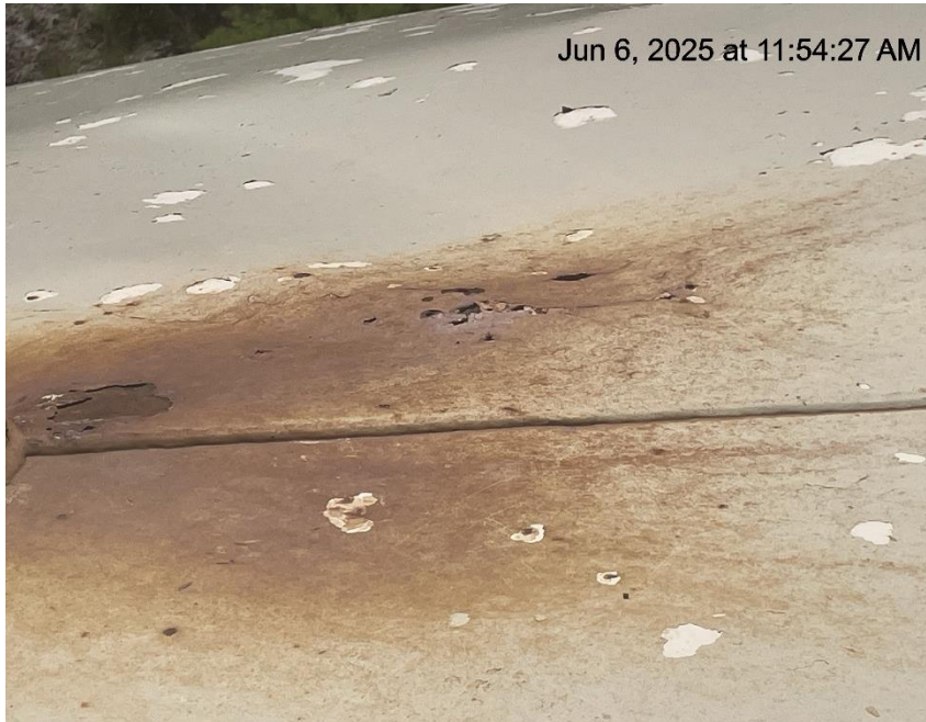
Photo # 7218 Tank failure - Multiple holes in tank/tank lacks integrity