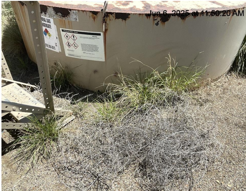
Photo # 7222 Weeds/undesirable plant species in secondary containment