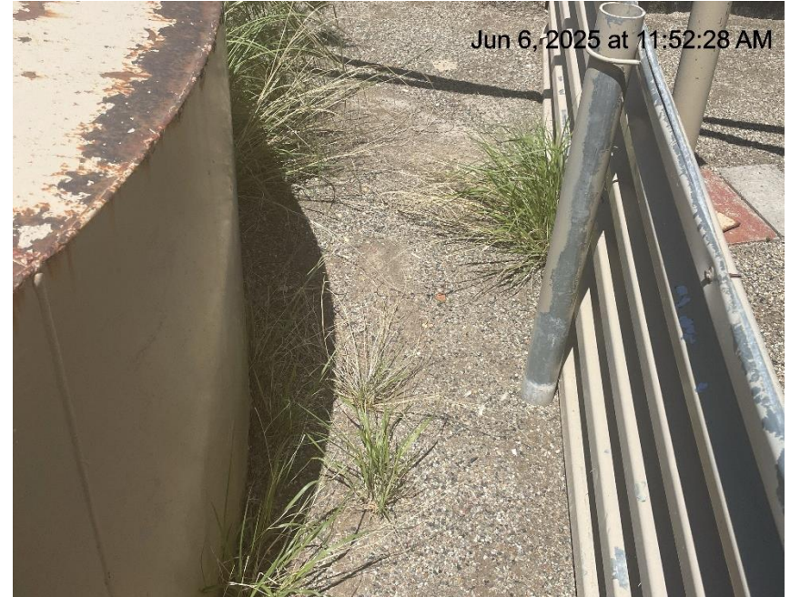
Photo # 7221 Weeds/undesirable plant species in secondary containment