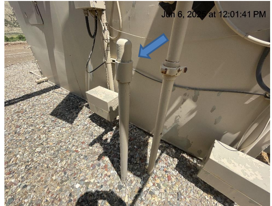
Photo # 7227 Unused flowline does not comply with CECMC 600 & 1100 series rules