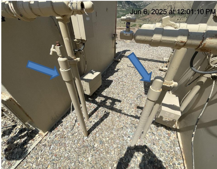
Photo # 7226 Unused flowlines do not comply with CECMC 600 & 1100 series rules