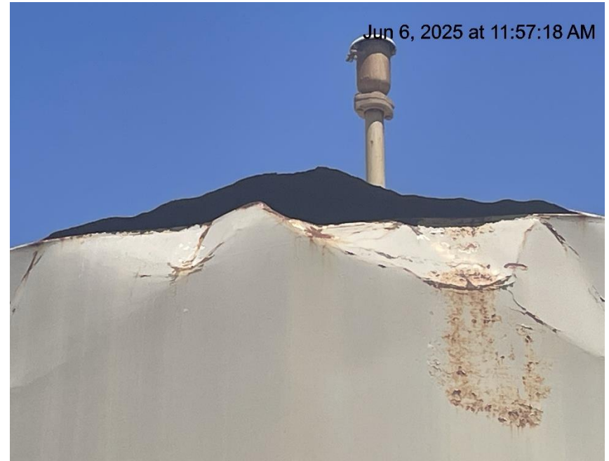
Photo # 7217 Tank failure - Tank damaged/hole in tank/tank lacks integrity