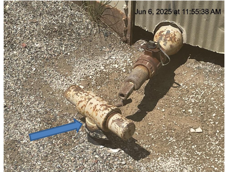
Photo # 7225 Unused flowline does not comply with CECMC 600 & 1100 series rules