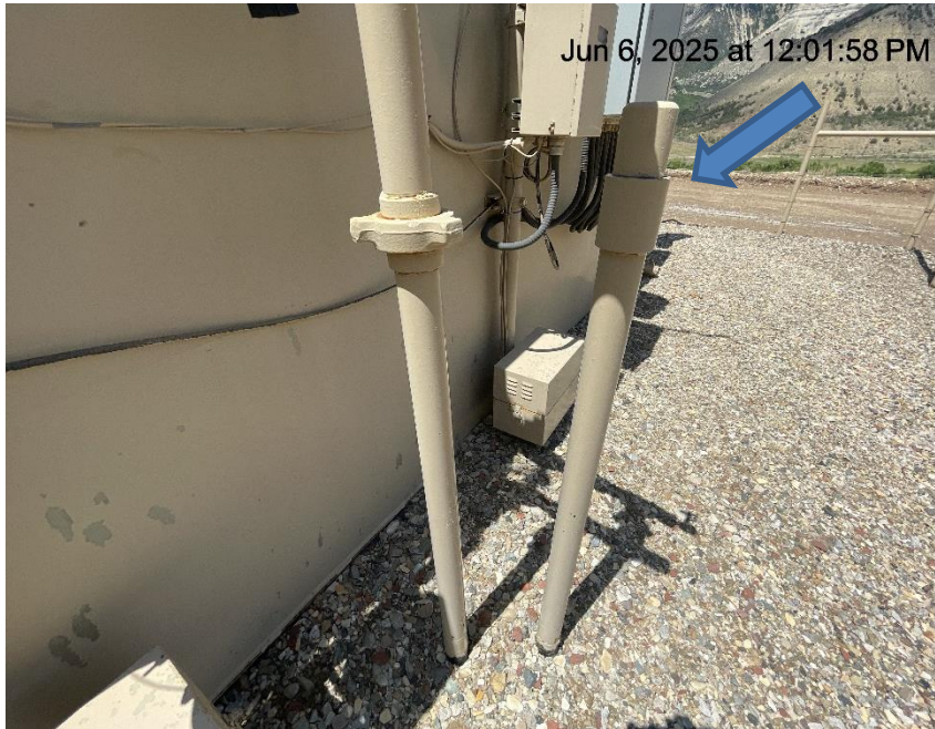
Photo # 7228 Unused flowline does not comply with CECMC 600 & 1100 series rules