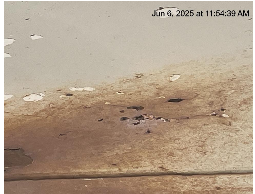
Photo # 7219 Tank failure - Multiple holes in tank/tank lacks integrity