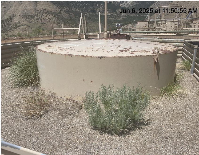
Photo # 7224 Weeds/undesirable plant species in secondary containment