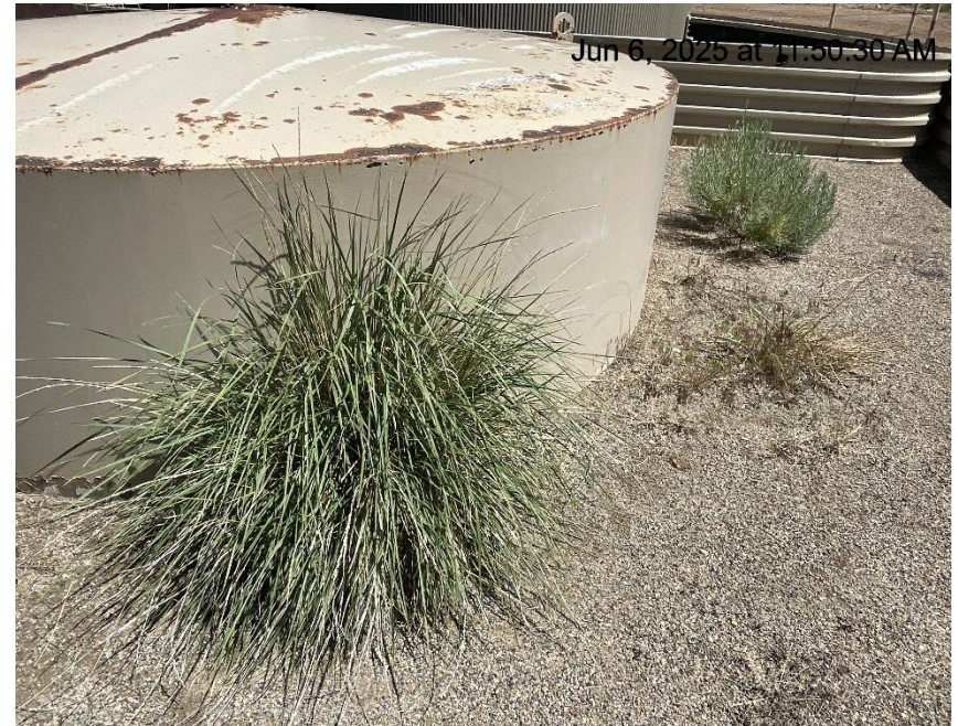
Photo # 7223 Weeds/undesirable plant species in secondary containment