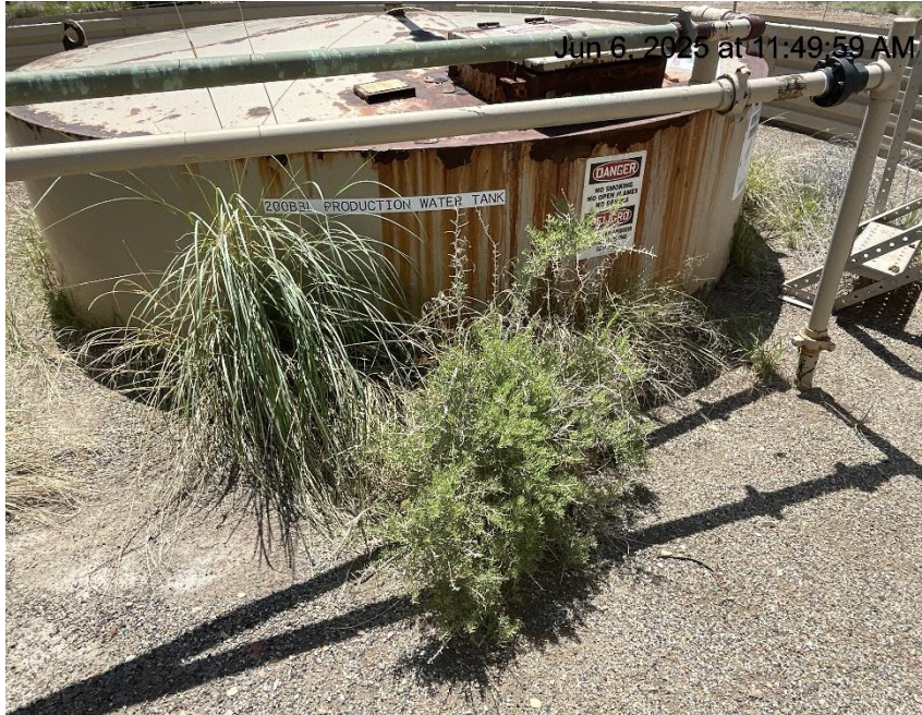
Photo # 7220 Weeds/undesirable plant species in secondary containment