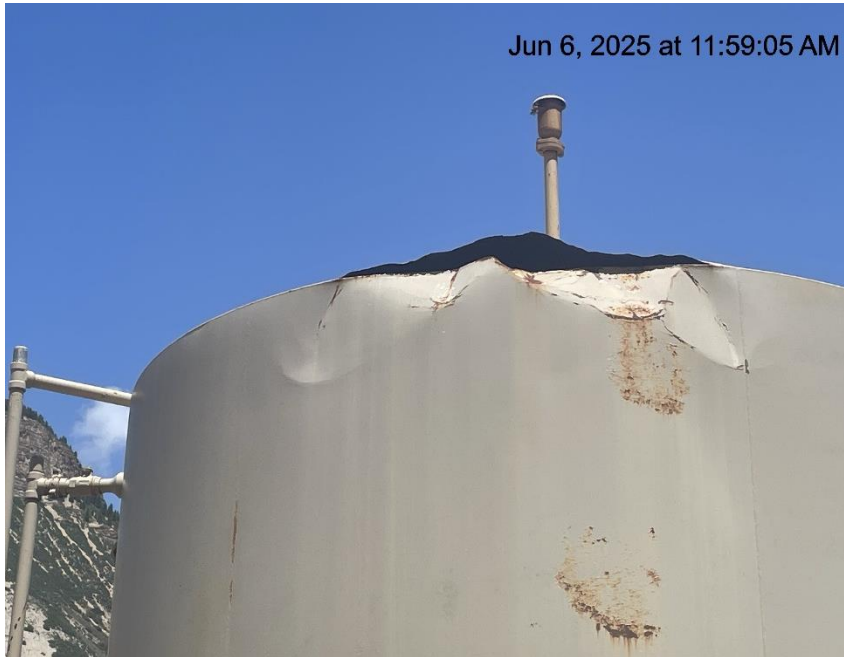
Photo # 7216 Tank failure - Tank damaged/hole in tank/tank lacks integrity