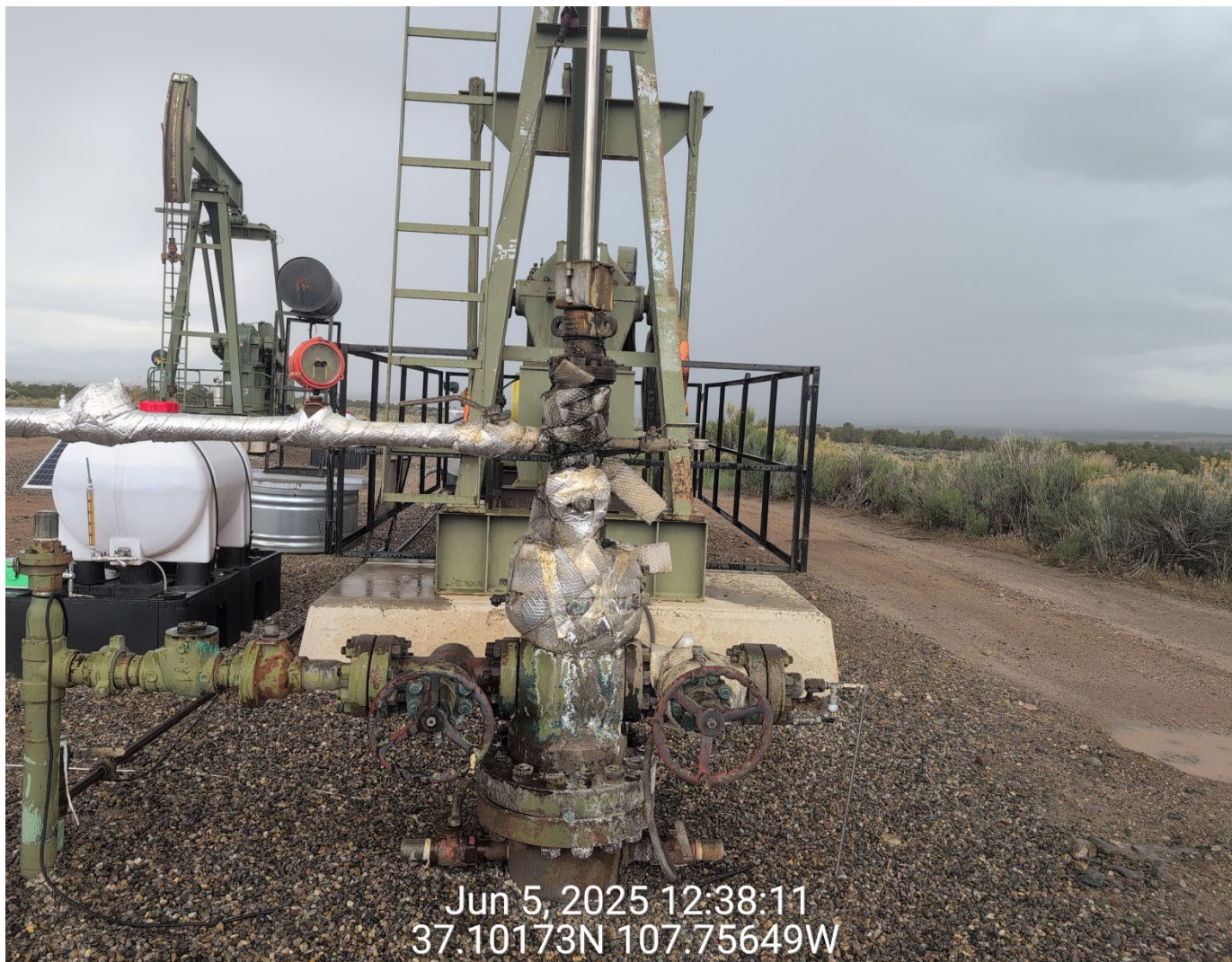
Slugger 22 wellhead. Salt staining on wellhead.

Location Name: Slugger 2 Location ID #: 306981