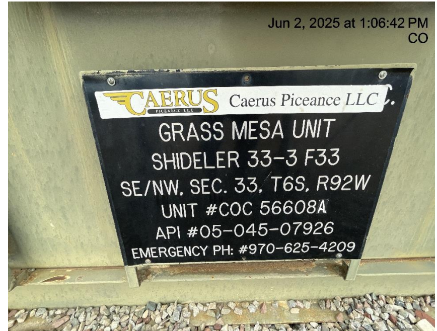
Photo # 6001 Emergency phone # on wellhead sign disconnected & not in service/not in compliance with CECMC rules

Photo # 6002 Emergency phone # on wellhead sign disconnected & not in service/not in compliance with CECMC rules