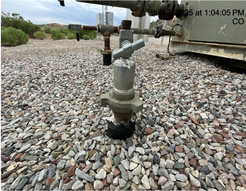
Photo # 6005 Unused flowline does not comply with CECMC 600 & 1100 series rules