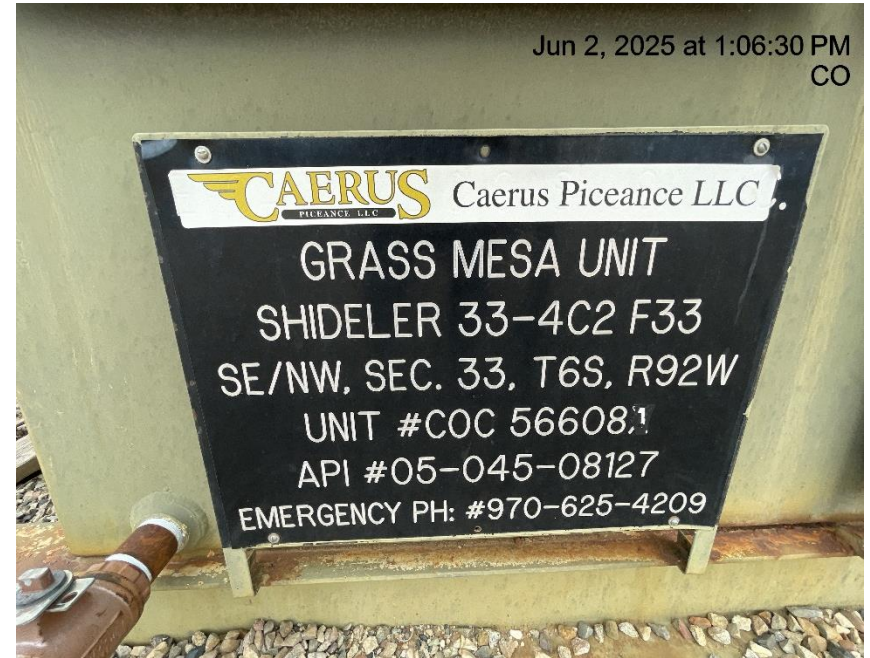
Photo # 6000 Emergency phone # on wellhead sign disconnected & not in service/not in compliance with CECMC rules