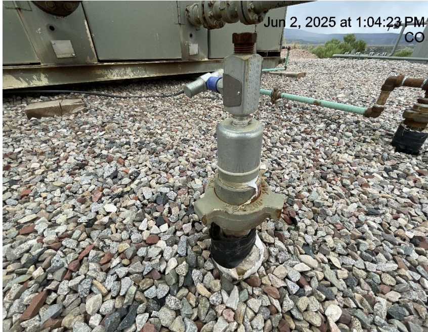
Photo # 6007 Unused flowline does not comply with CECMC 600 & 1100 series rules