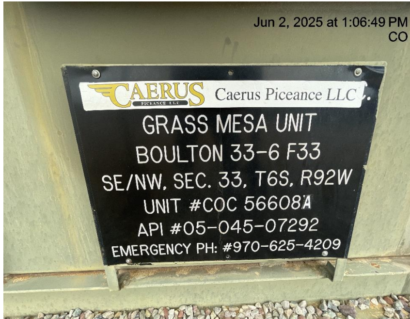
Photo # 6003 Emergency phone # on wellhead sign disconnected & not in service/not in compliance with CECMC rules