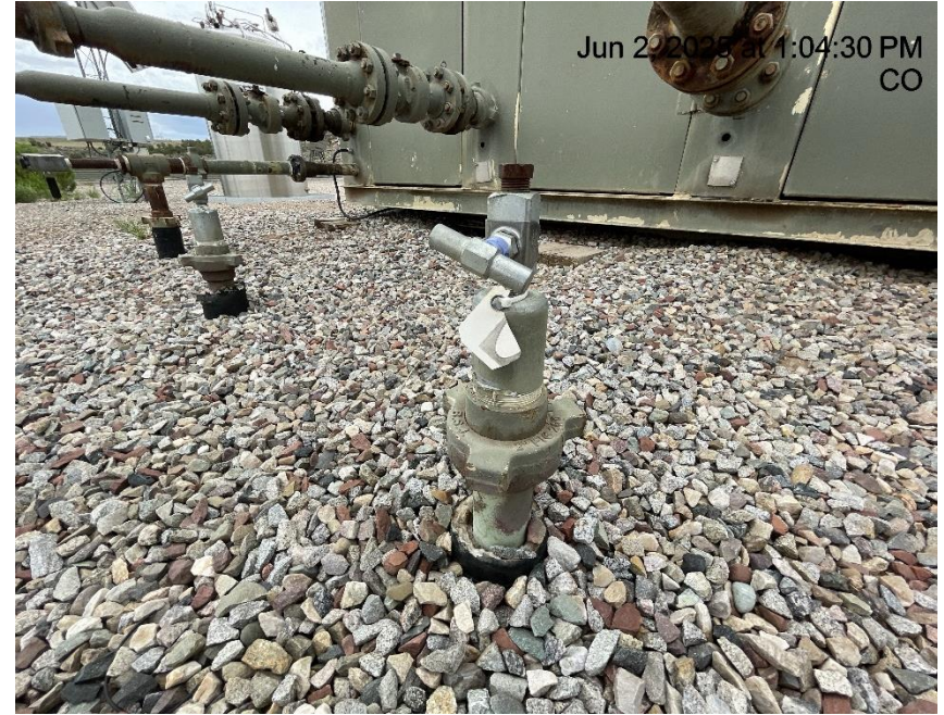
Photo # 6006 Unused flowline does not comply with CECMC 600 & 1100 series rules